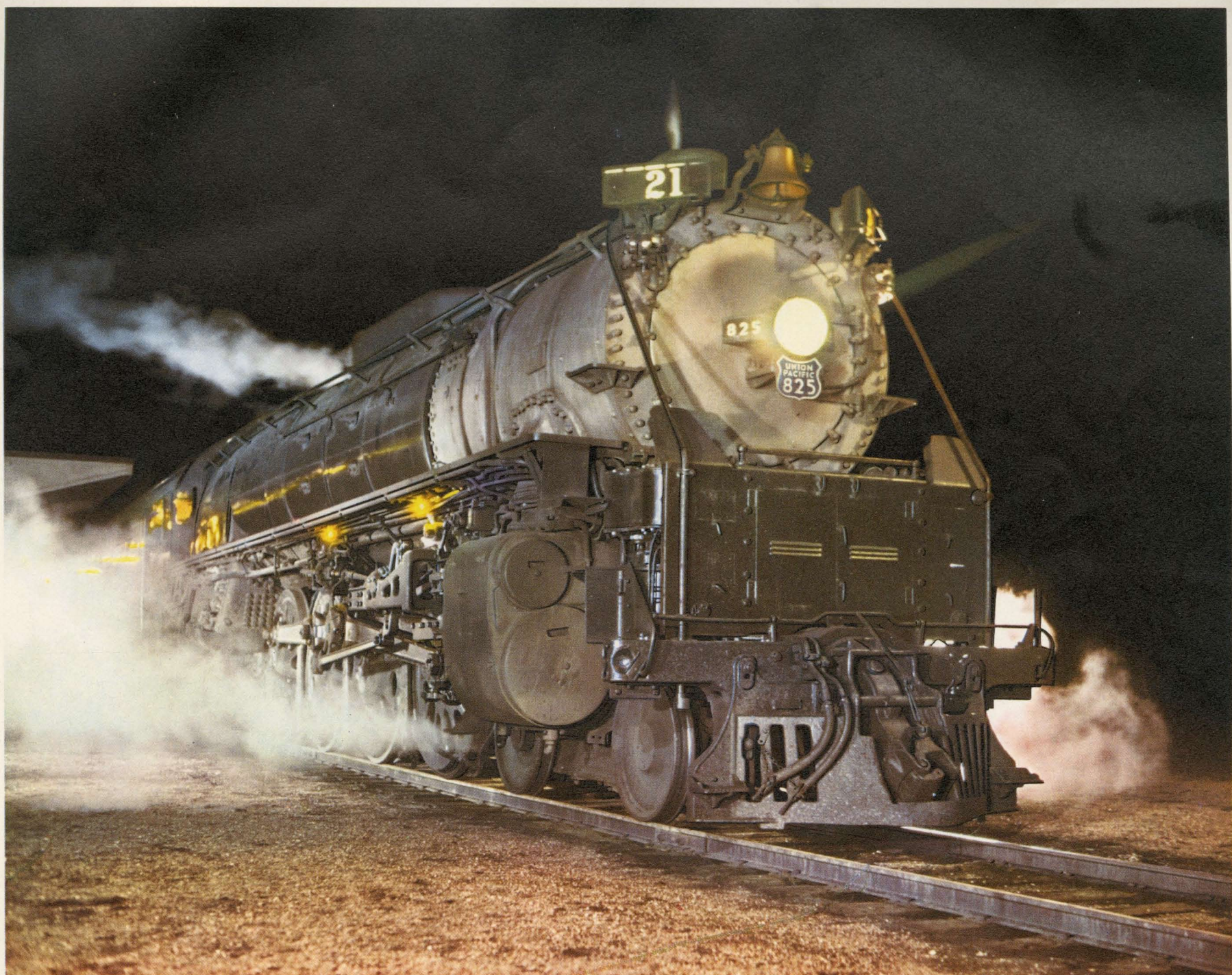
THROUGH THE NIGHT — AND DAY — IN ALL KINDS OF WEATHER — THE UNION PACIFIC CARRIES TROOPS AND WAR MATERIALS TOWARD FAR-FLUNG BATTLE FRONTS