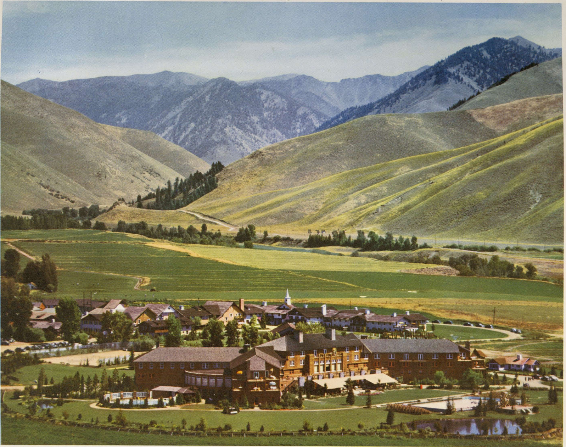
SUN VALLEY, IDAHO, OFFERS HEALTHFUL RECREATION THE YEAR 'ROUND TO KEEP AMERICA FIT