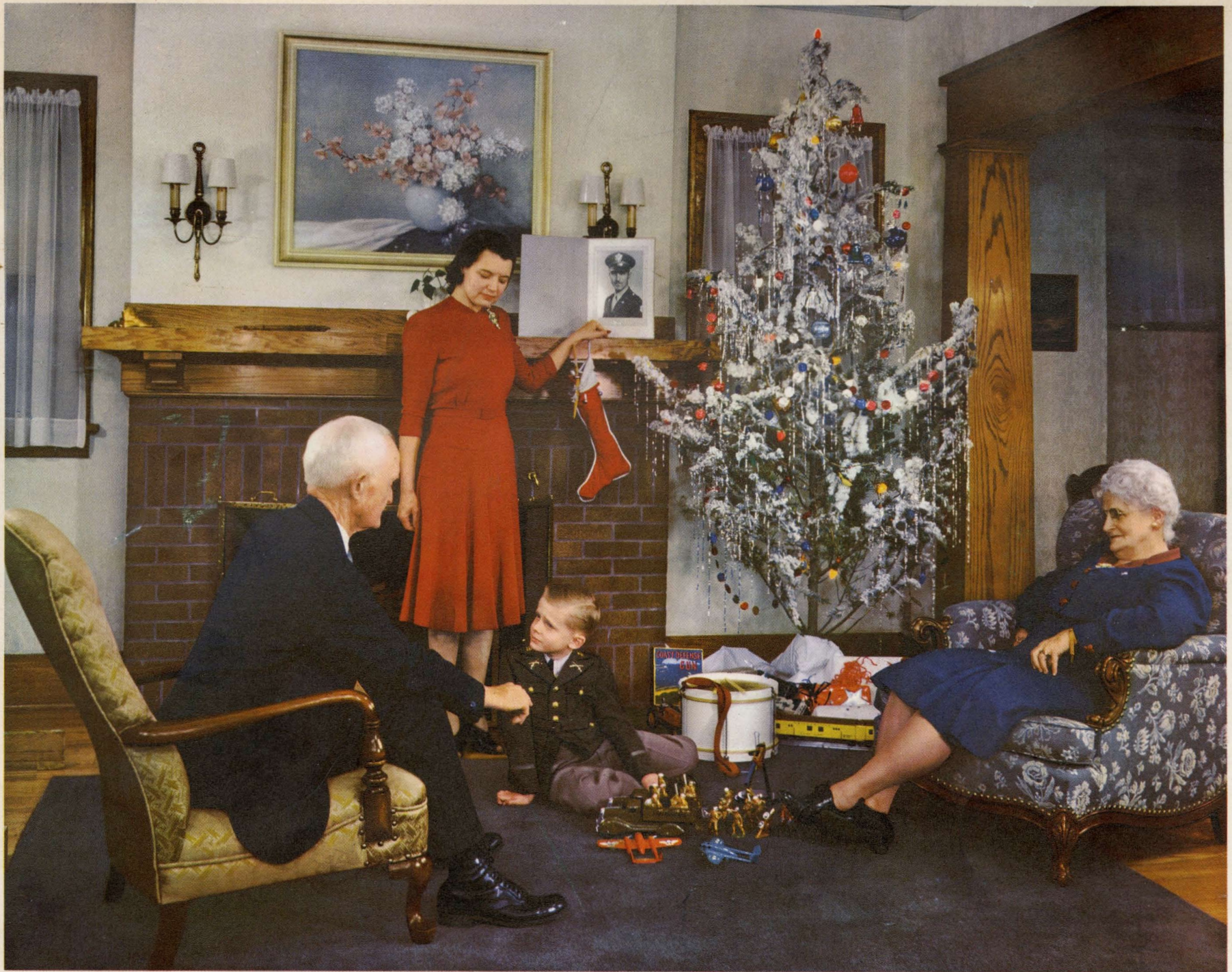
CHRISTMAS — OUR MEN IN UNIFORM ARE FIGHTING TO PRESERVE THIS SYMBOL OF CHRISTIANITY