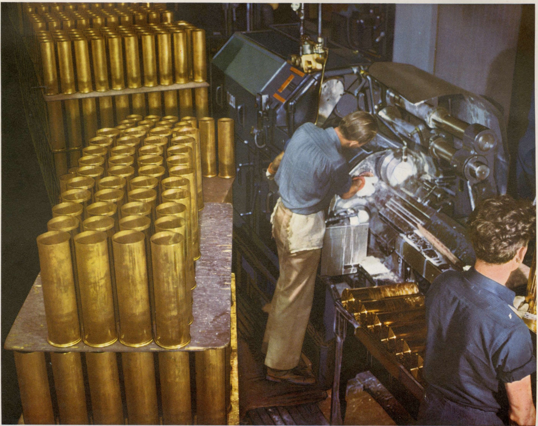
SHELLS — OF WESTERN METALS — MANUFACTURED AND LOADED — AND THEN TRANSPORTED TO TROOPS AND SHIPS BY UNION PACIFIC