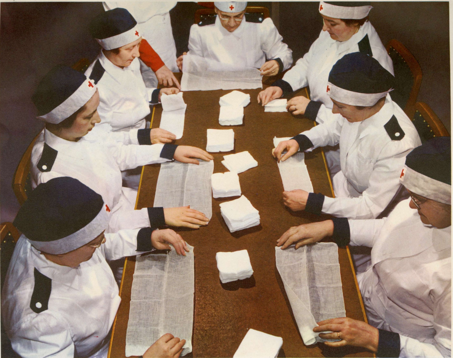
RED CROSS WORK IS A WELL-ORGANIZED ACTIVITY OF MANY UNION PACIFIC WOMEN