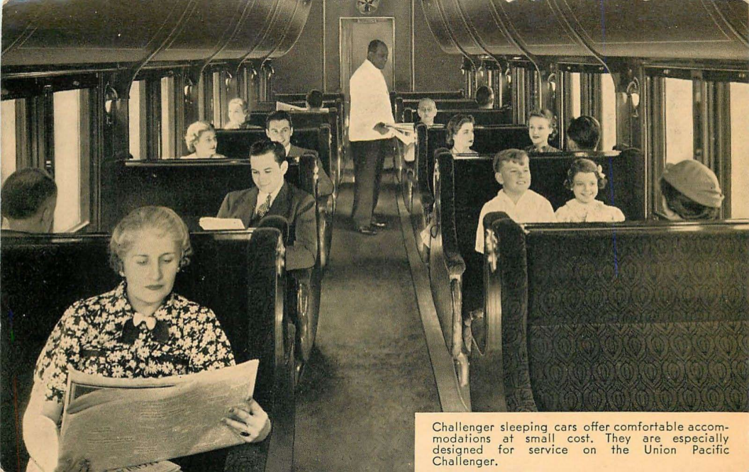
Challenger sleeping cars offer comfortable accommodations at small cost. They are especially designed for service on the Union Pacific Challenger.