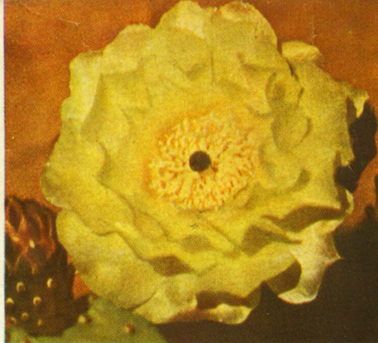
Cactus Opuntia rhodantha