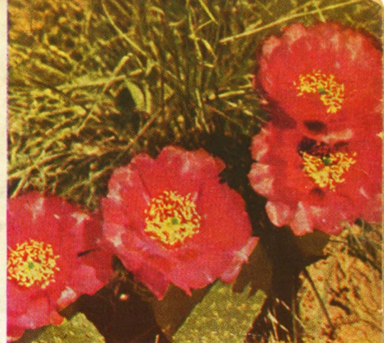
Beavertail Cactus Opuntia basilaris