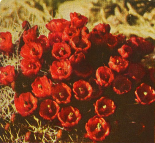
Strawberry Cactus Echinocereus coccineus