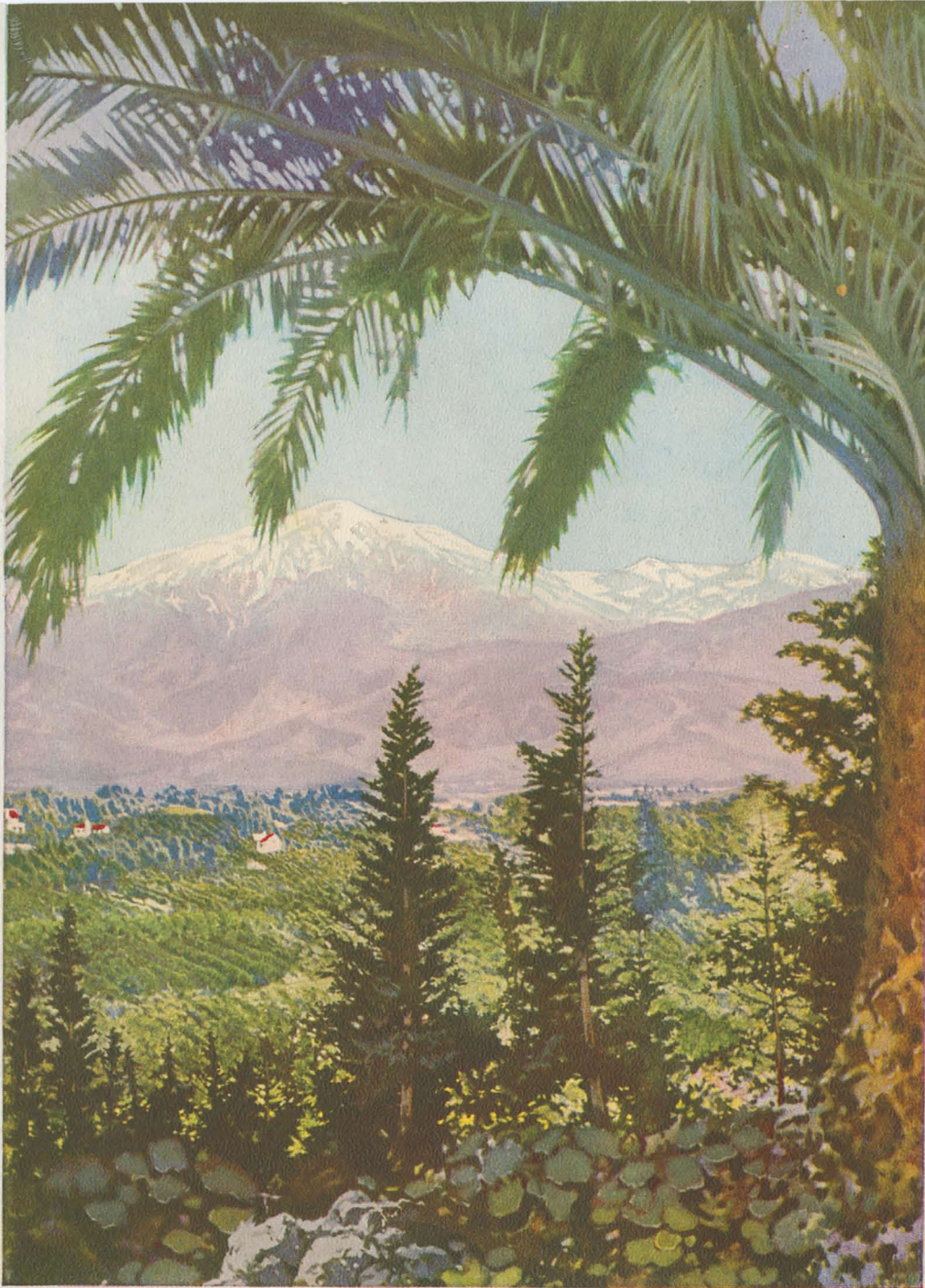
PALMS, ORANGE GROVES AND SNOWY MOUNTAINS—Southern California