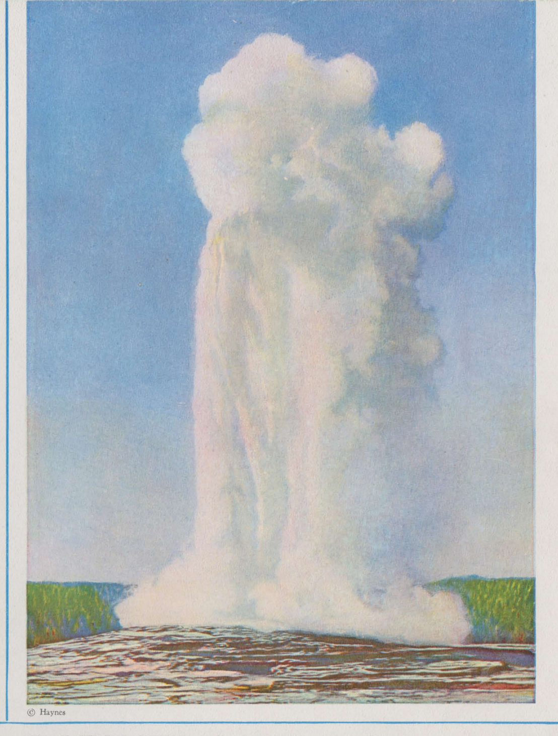
OLD FAITHFUL GEYSER—Yellowstone National Park, Wyoming