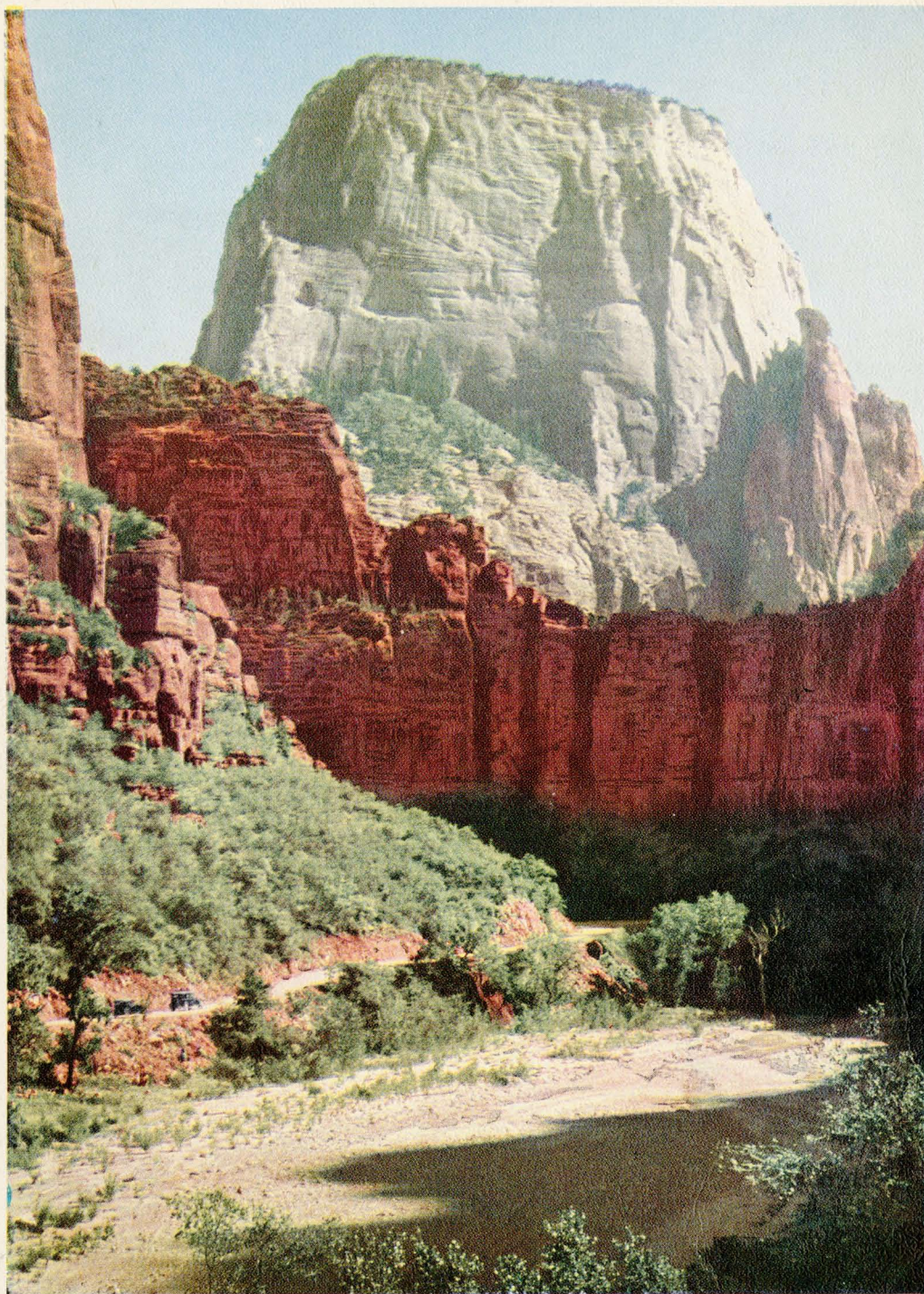
Natural color Photograph

The Great White Throne Zion National Park, Utah