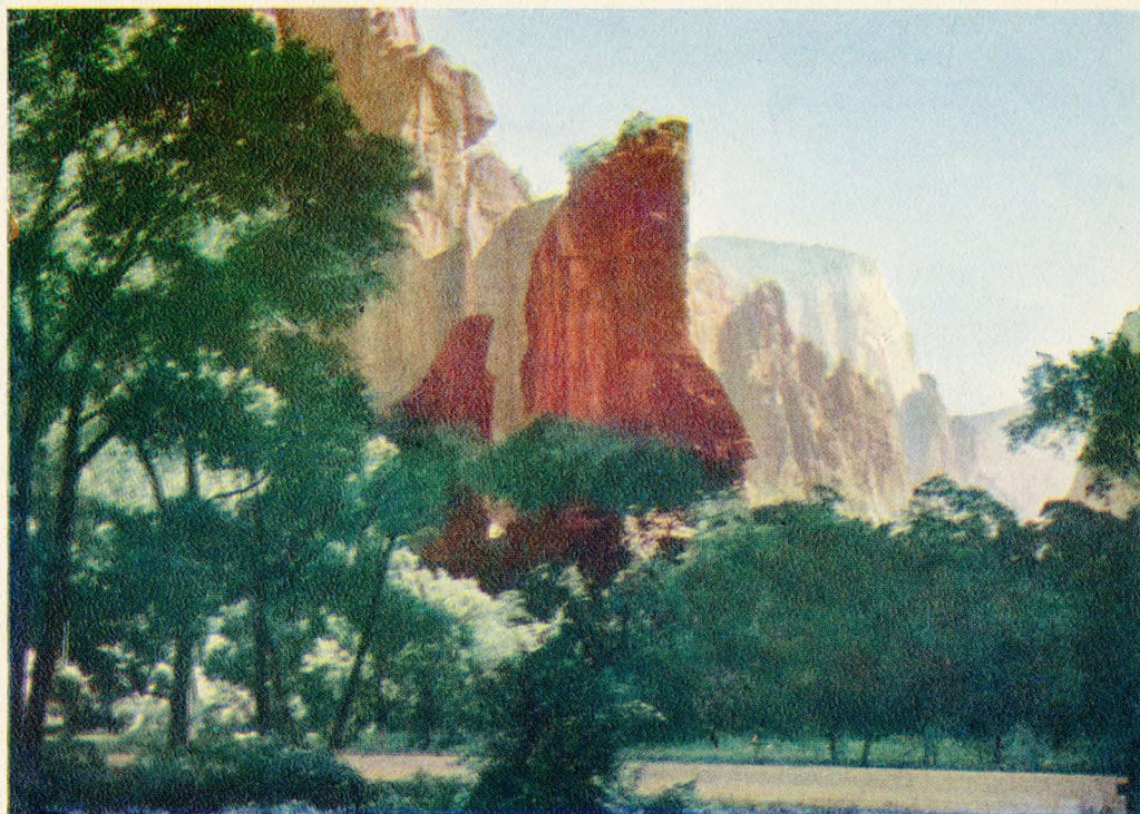
Natural color Photograph