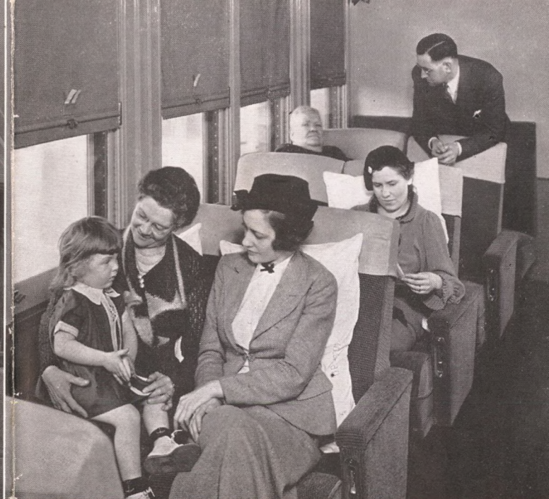
● There's always room in The Challenger coaches. More cars are added, when necessary, to prevent crowding.