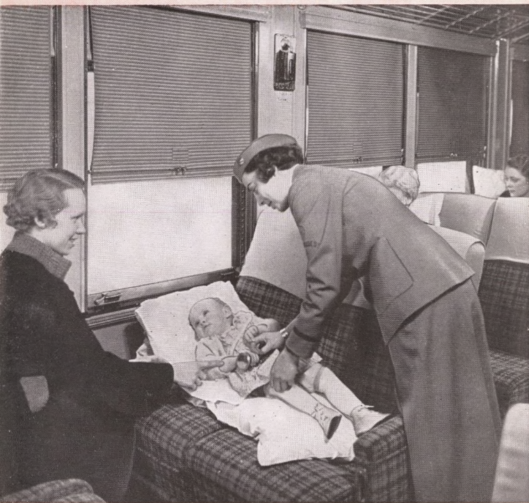
● Mothers traveling with babies especially appreciate the attentive services of the Stewardess-Registered Nurse.