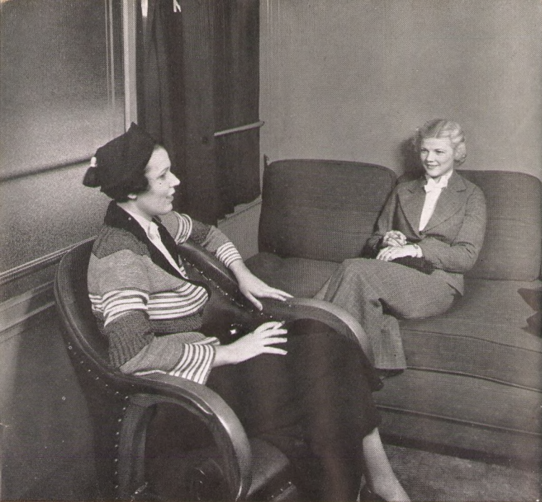
● The ladies' lounge and dressing rooms in coaches on The Challenger are commodious, and well-equipped.