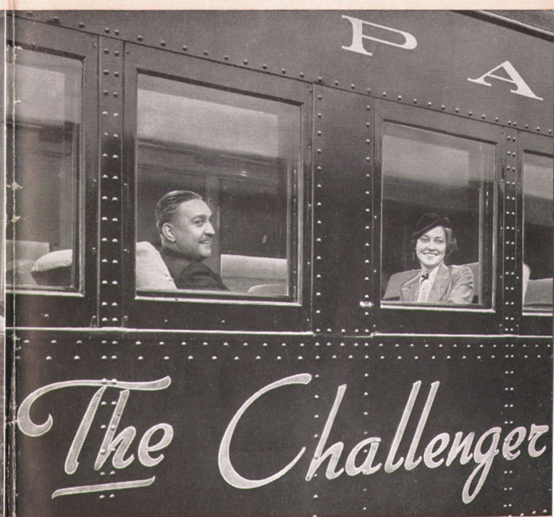
● Over a half million dollars were invested to provide low cost travel comfort on The Challenger.