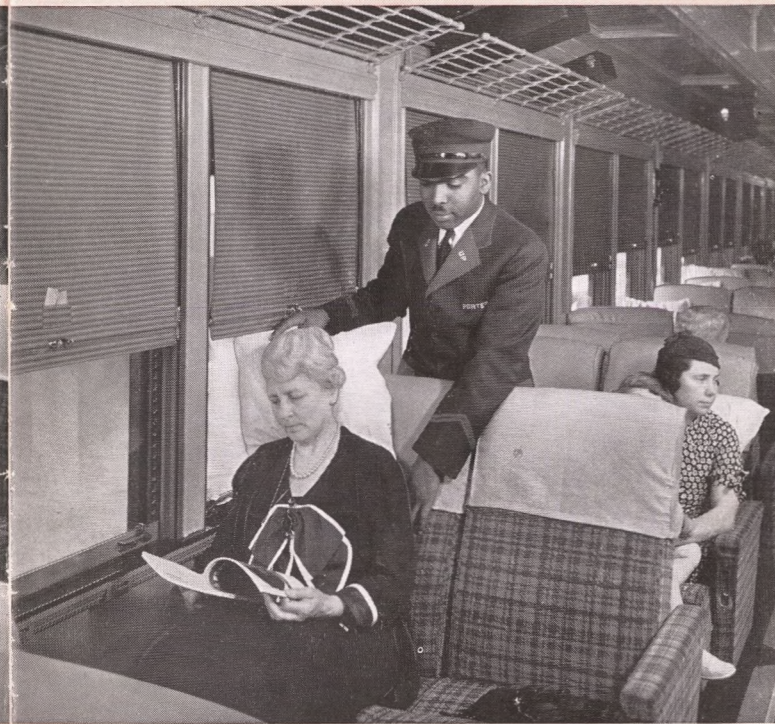
● Soft pillows furnished free to coach passengers add tremendously to their restful comfort, day and night.