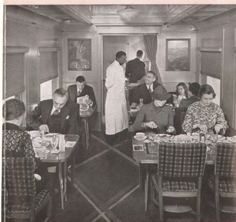
● The smart "Coffee-Shop" dining car is available to guests for recreation purposes, except during meal hours.