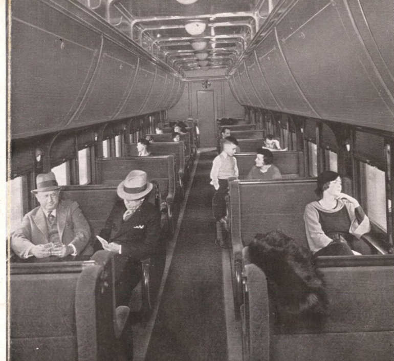
● The attractive tourist sleeping cars on The Challenger were standard Pullman sleeping cars a few years ago.