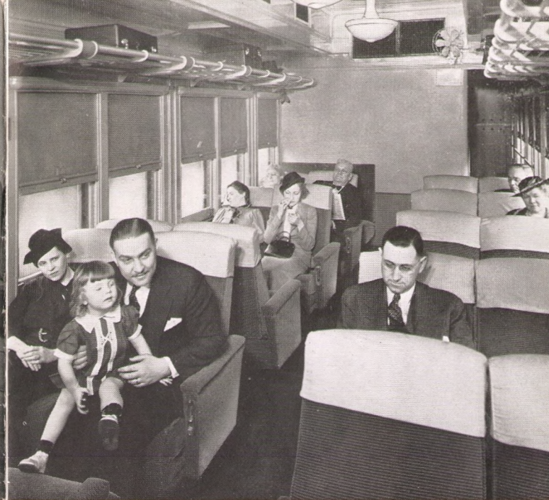
● Deep-cushioned individual, reclining seats in all coaches is another reason for the Challenger's popularity.