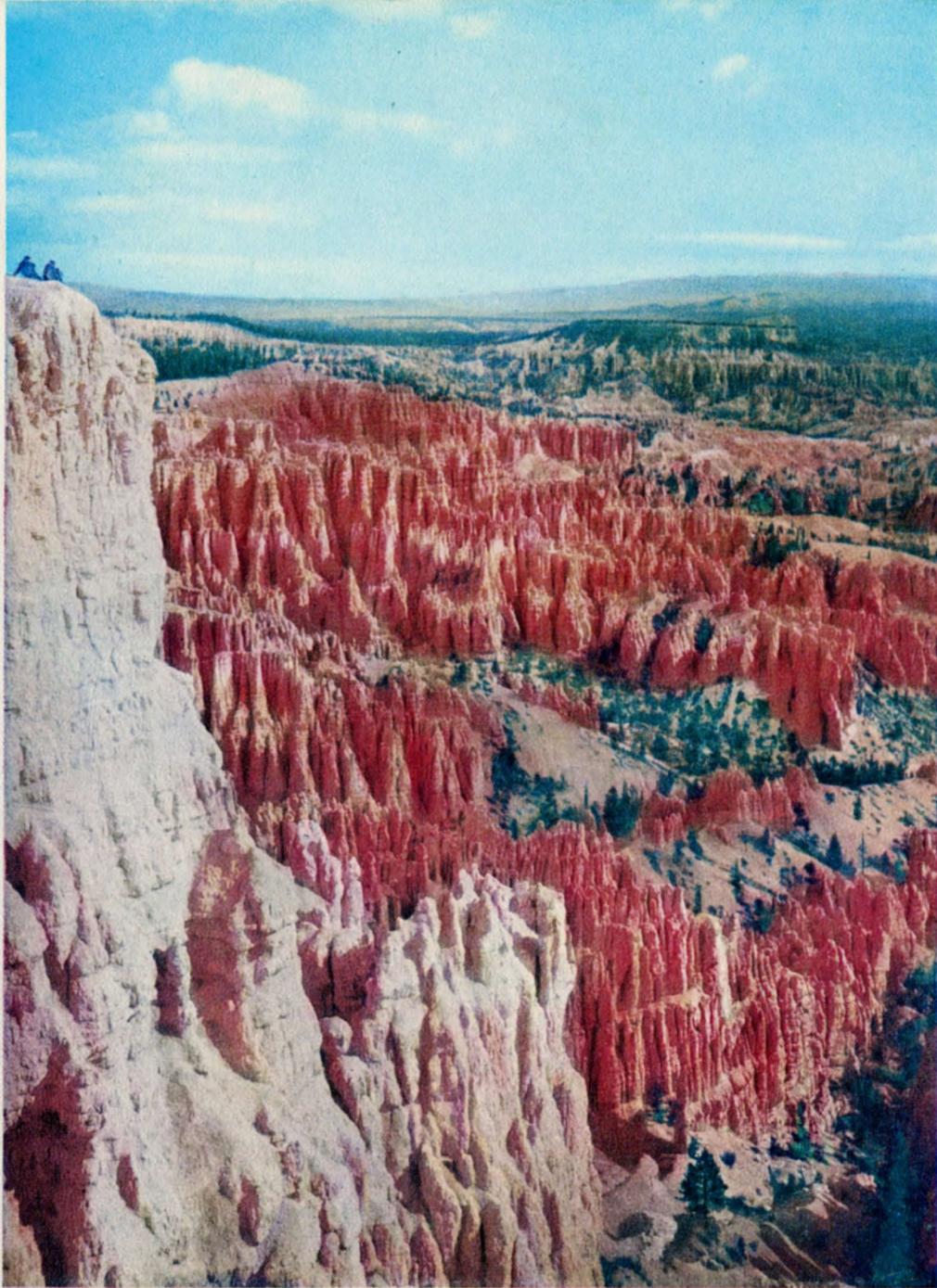
Natural Color Photograph

BRYCE CANYON, UTAH—From Inspiration Point