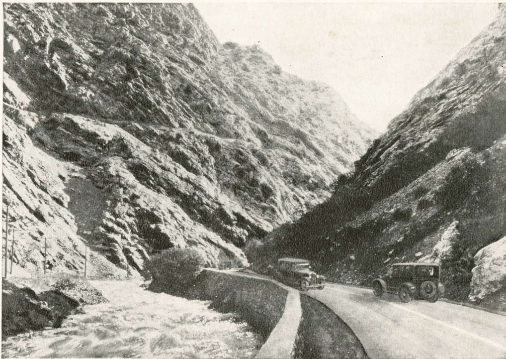
Highway in Ogden Canyon, Utah