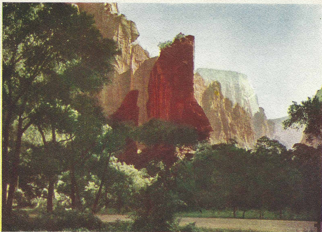
Natural color Photograph