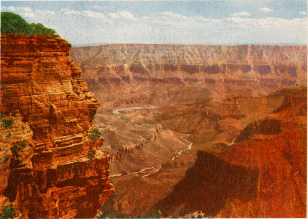
Natural color photograph by Frank G. Fulton