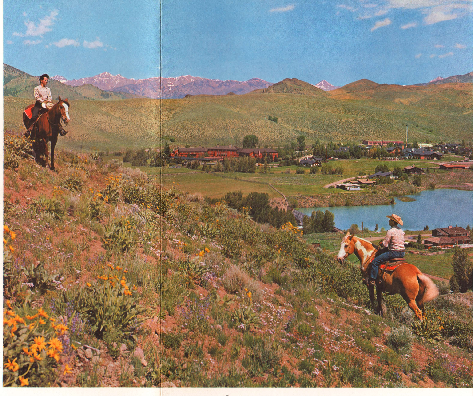
Sun Valley, Idaho — famed for skiing, is supreme also as a summer sports center, with almost every known outdoor recreation.

Sun Valley Lodge, Challenger Inn and Chalets provide a variety of comfortable, attractive guest rooms at a wide range in rates. Union Pacific Domeliners or Streamliners provide service to Shoshone, Idaho, where buses from Sun Valley meet all trains.