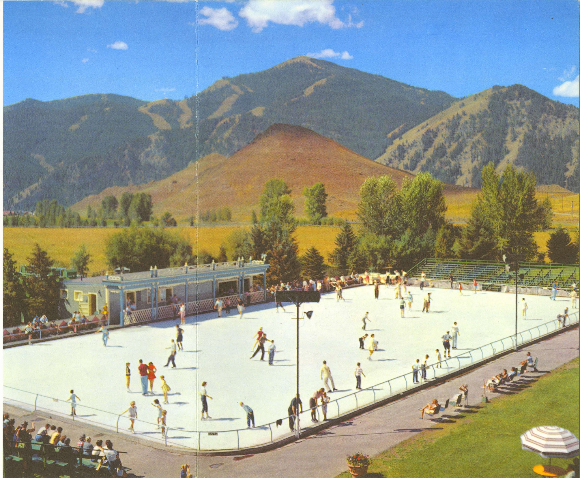
Year around ice skating rink at Sun Valley, Idaho, is of standard Olympic dimensions.

Sun Valley Lodge, Challenger Inn and Chalets provide a variety of comfortable, attractive, clean guest rooms at a wide range in price. Union Pacific Railroad Domeliner or Streamliners take you to Shoshone, Idaho, where you are transported by bus to picturesque Sun Valley Village.