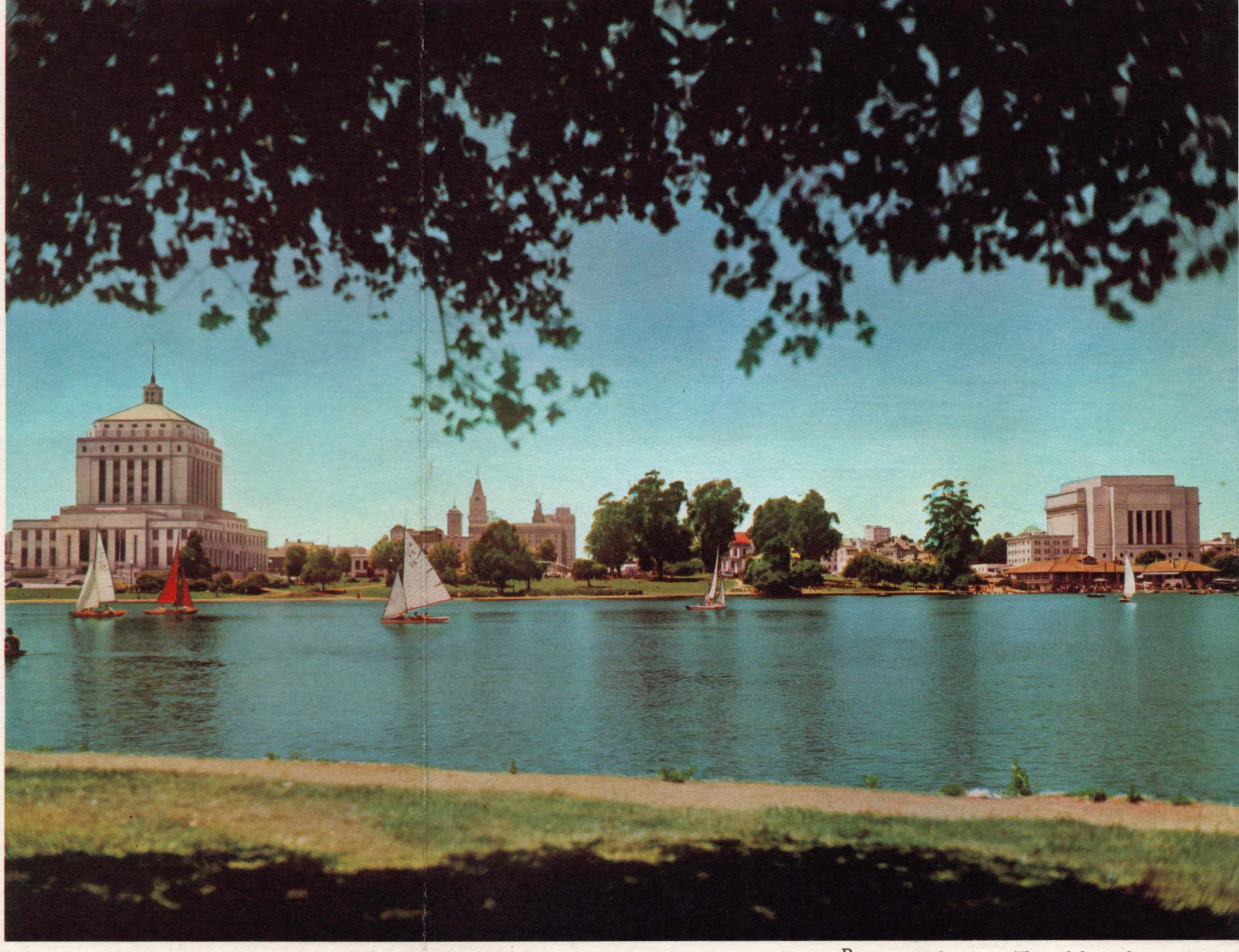
Boating on Lake Merritt-This mile-long salt water tidal lake extends into the heart of Oakland, California.

Surrounding it is a beautiful park, with handsome public buildings. Broad boulevards follow its shore line. Canoes, rowboats and power launches of many kinds ply its surface. A portion of the lake has been fenced off as a wildfowl sanctuary. This lake and its environs has become a very popular playground for the people of Oakland and visitors.