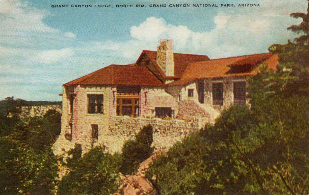
GRAND CANYON LODGE, NORTH RIM, GRAND CANYON NATIONAL PARK, ARIZONA