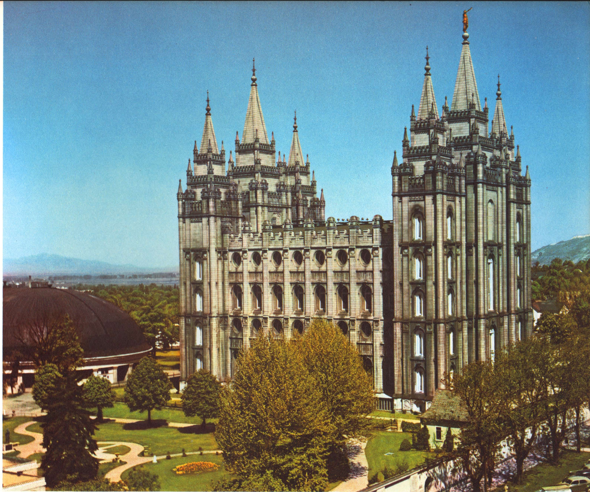
This world famous Temple in Salt Lake City, Utah is the chief sanctuary of the Mormon Church.

The Mormon Temple and Tabernacle, and other religious edifices in "Temple Square," are usually of chief interest to the visitor in Salt Lake City, Utah. The Mormons (Church of Jesus Christ of Latter Day Saints) have built temples from the beginning of their history. There are a number of them, beautiful and interesting structures, in western states, particularly Utah and Idaho. The one in Salt Lake City is a realization of the dreams and religious aspirations of Brigham Young who led the Mormon pioneers to Salt Lake Valley in 1847. It is built of native gray granite, and in classical design, of Romanesque and Gothic architecture. Interior decorations and furnishings are said to have an exalting beauty that is entirely in harmony with the design and purpose of the Temple. The maximum length of the building is 186½ feet, its width 118½ feet. The east center tower rises 210 feet. The statue of the Angel Moroni atop it is 12 feet 5½ inches in height.