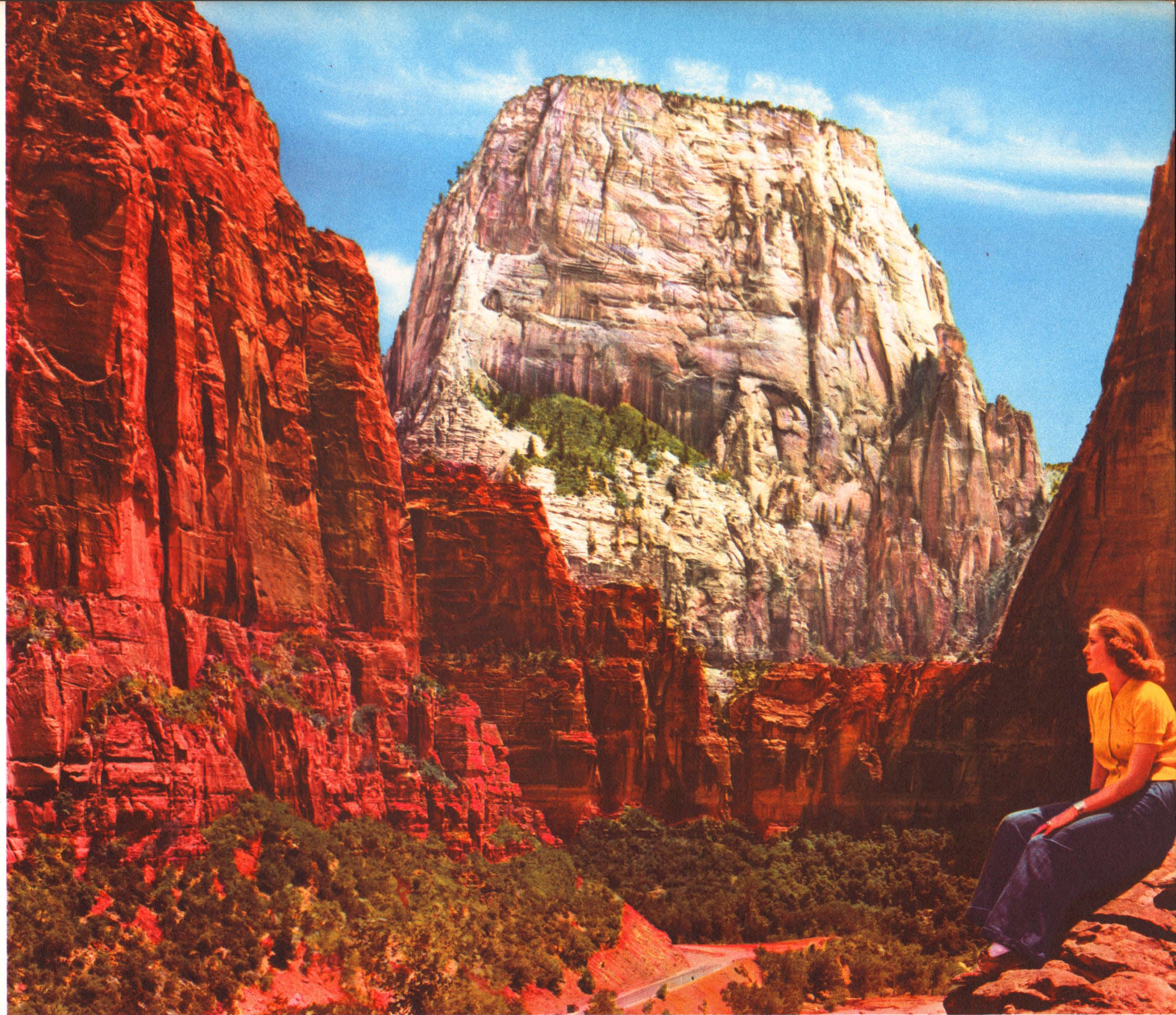
The Great White Throne — majestic mountain in the east wall of Zion, rises nearly 2500 feet above the valley floor.

Many travelers enroute to or from California, via Union Pacific, arrange for stop-over privileges at these world-famed National Parks.