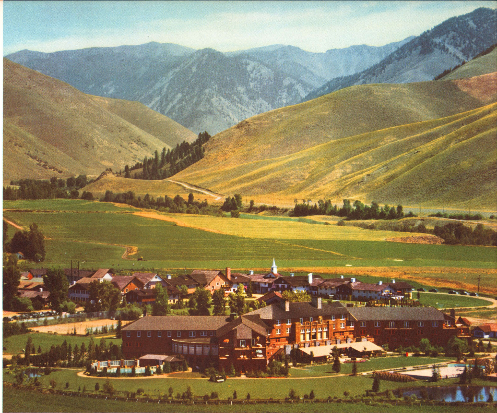
Sun Valley, Idaho—famed for skiing, is supreme also as a summer sports center. Every known outdoor recreation is available.

Challenger Inn and Sun Valley Lodge provide a variety of comfortable, attractive guest rooms at a wide range in price. Union Pacific trains take you to Shoshone, Idaho, where you are transported by bus to picturesque Sun Valley Village.