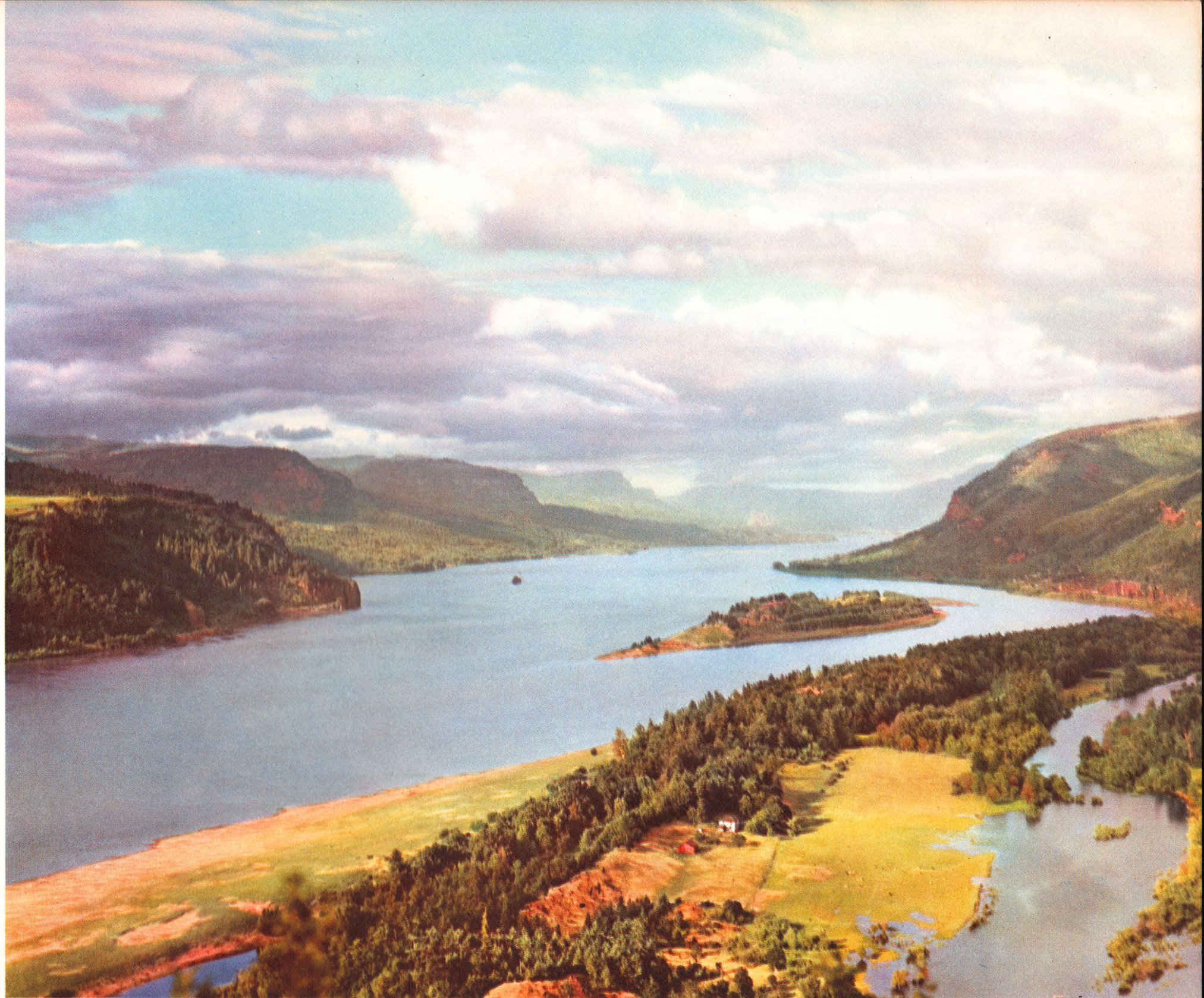
Columbia River, Oregon—Among the great rivers of the world, the Columbia ranks high, historically, commercially, scenically.

A trip to the Pacific Northwest is incomplete without a drive over the famed Columbia River Highway. The magnificent road passes 11 waterfalls in 11 miles. A bright carpet of wild flowers lends enchantment to the vari-colored rocks along the way.