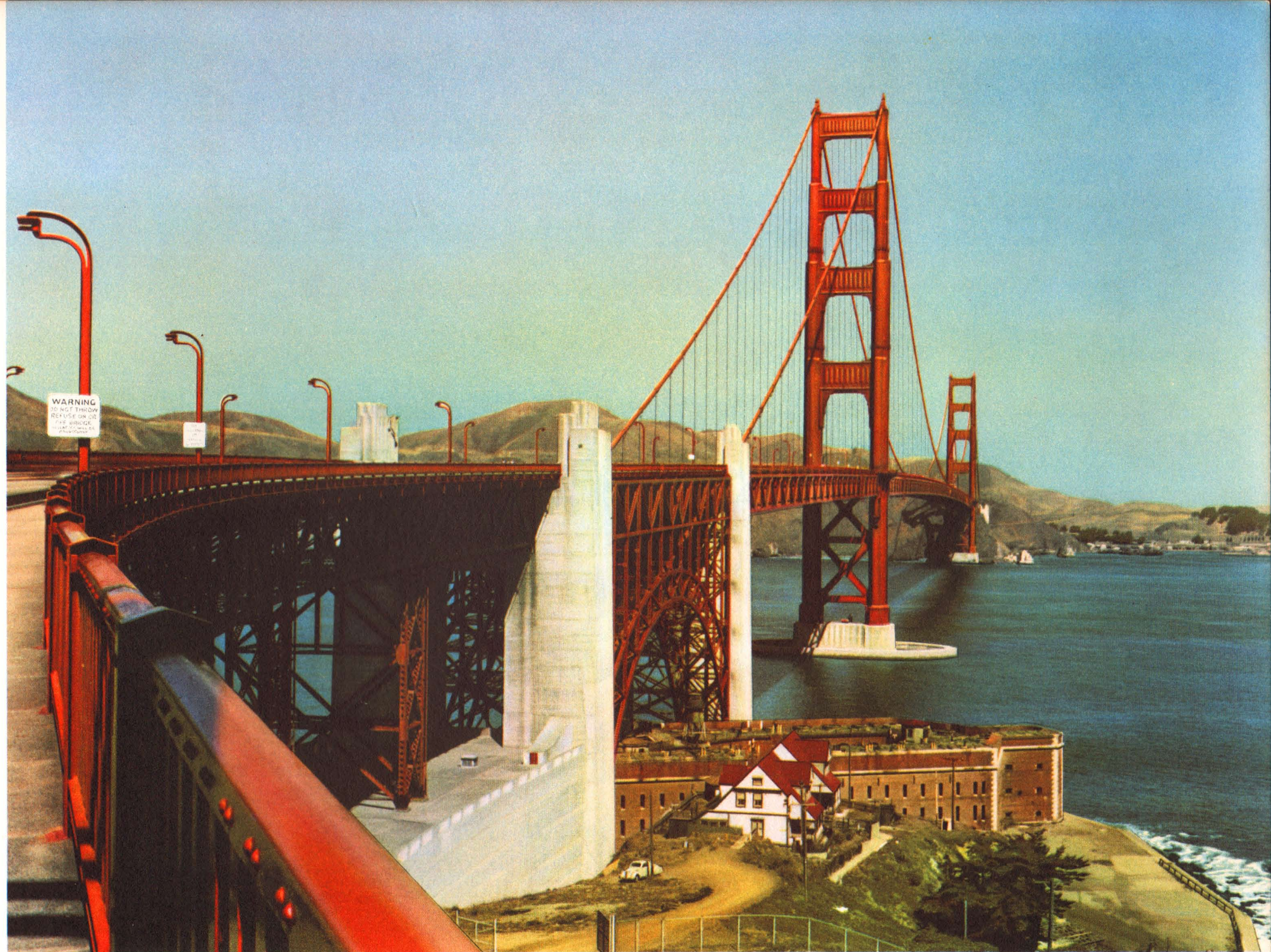
Golden Gate Bridge—World's largest single-span suspension type; connects San Francisco with the North Bay shore, a mile away.

Its graceful architecture is a thing of beauty; it has wide driveways to carry the endless traffic that is offered between the Peninsula and the North Bay shore; and it stands as a fitting monument to the progressive spirit of San Francisco and the Bay Area.