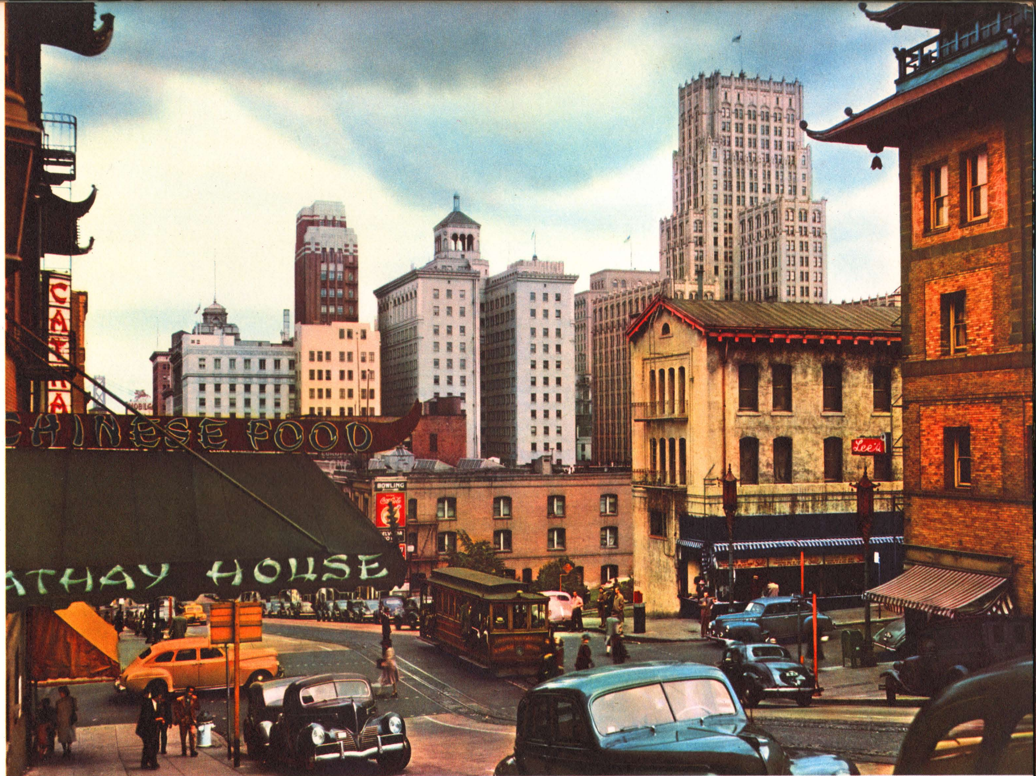
East Meets West—Modern skyscrapers of the Occident look down on a corner of transplanted Orient in San Francisco's Chinatown.

This area adjoins the best business section of San Francisco and is easy of access, friendly to all who come. Its buildings have an oriental touch and its shops and fine stores are filled with treasures from China.