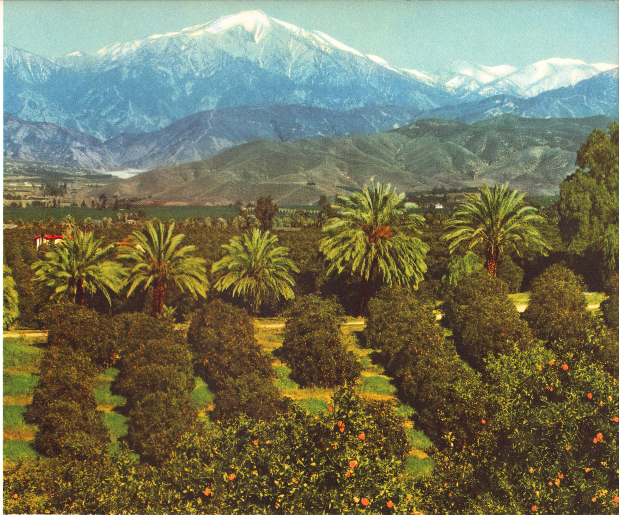
Orange Groves and Snowy Peaks—A delightful vista in Southern California's citrus fruit area.

The great cities of California are among the most interesting and romantic in the world, San Diego with its year around equable climate, Los Angeles with its nearby movie colonies, and San Francisco at the Golden Gate, redolent of pioneer and gold-rush days.