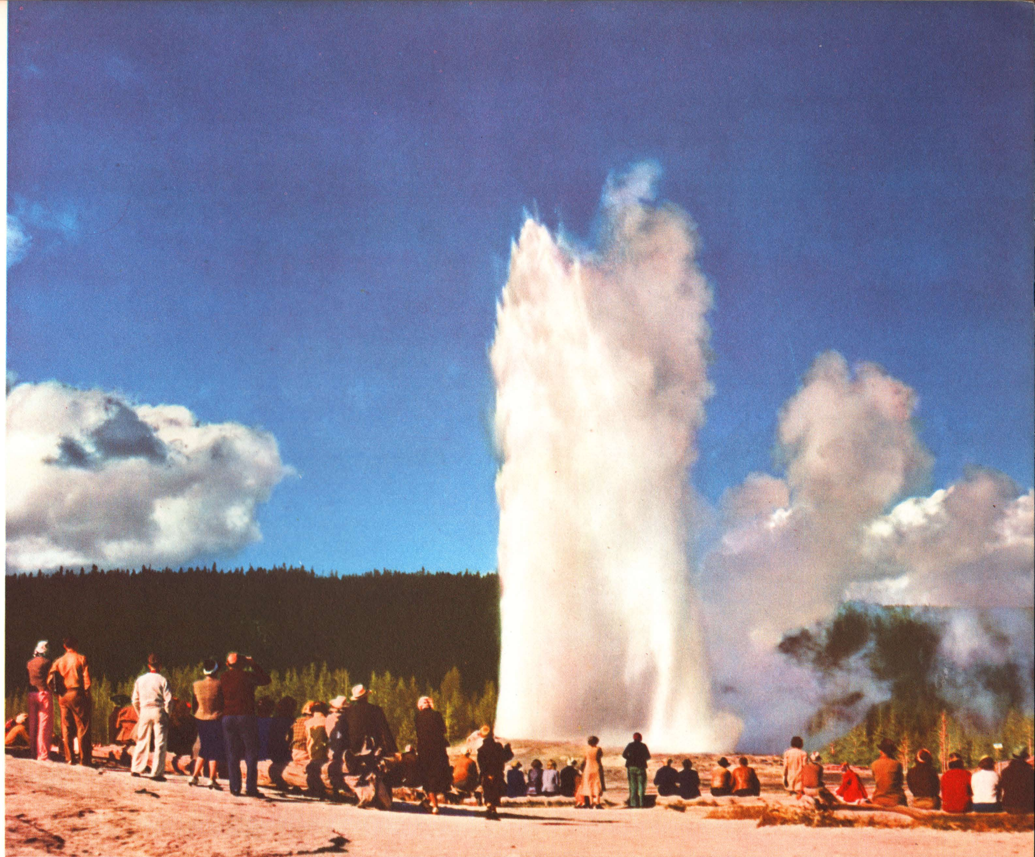
Old Faithful Geyser — This famed "actor" in Yellowstone Park never fails to delight his "house" with a first class show.

Thousands of Union Pacific travelers visit Yellowstone and near-by Grand Teton National Park annually as complete vacations, but they can also be seen as a short side-trip on your way to or from the Pacific Northwest.