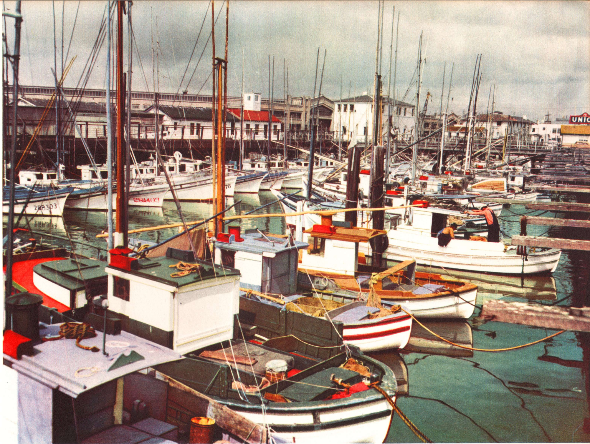
Fishermen's Wharf—Always of interest to visitors in San Francisco; as colorful as its counterpart in the Bay of Naples.

Here, also, are many fine night clubs and restaurants specializing in deliciously fresh sea foods.