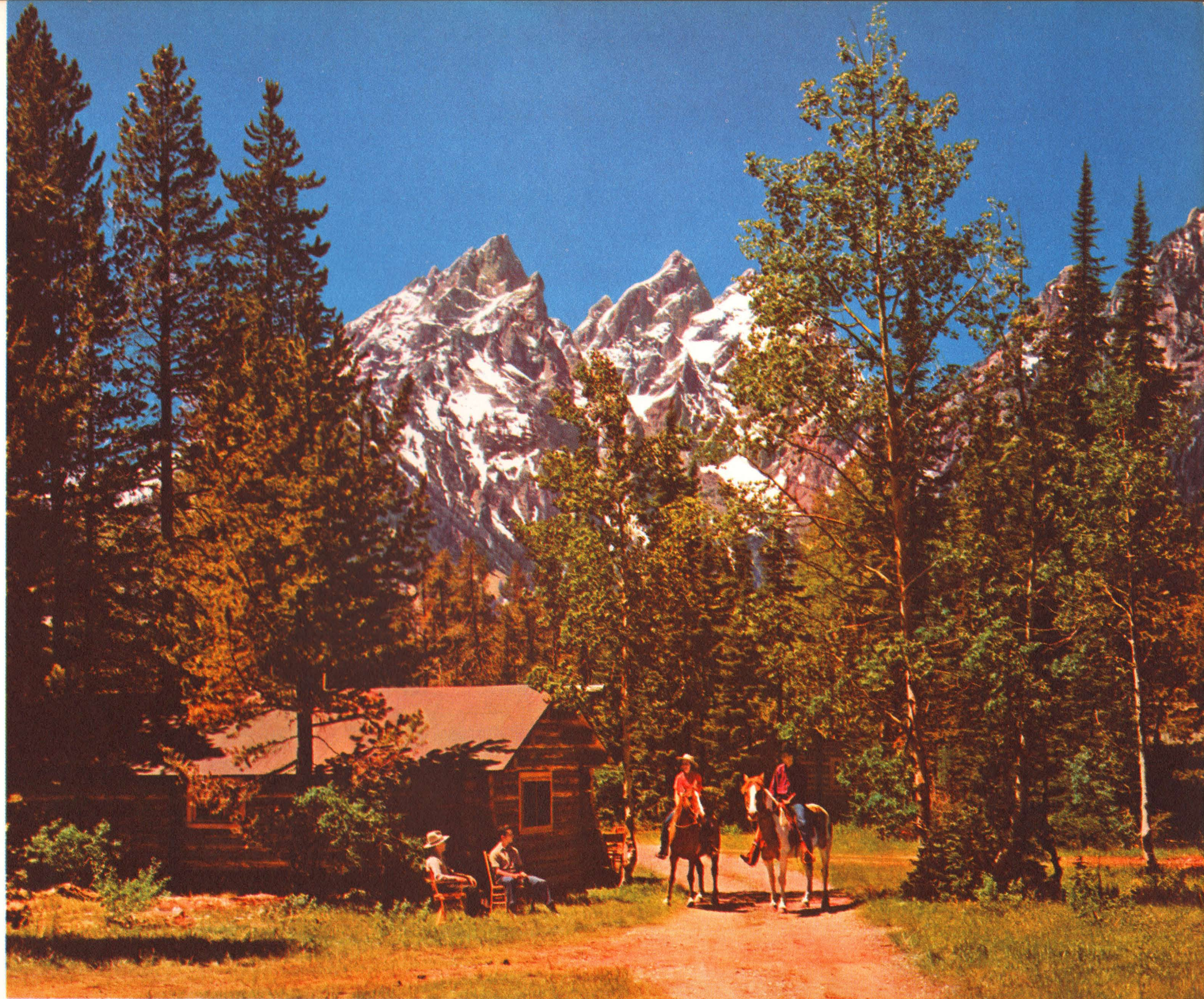
Dude Ranch Country—From the ranches in Jackson Hole, Wyoming, are many fine views of the Teton Mountains.

In the Union Pacific West there are many such ranches that take paying guests and provide them with all the facilities for a vacation in the real Western outdoors. They are found in the Grand Teton and Snowy Range regions of Wyoming, and in equally beautiful and romantic areas of Colorado, Idaho, Montana, California, Nevada, Oregon and Washington.