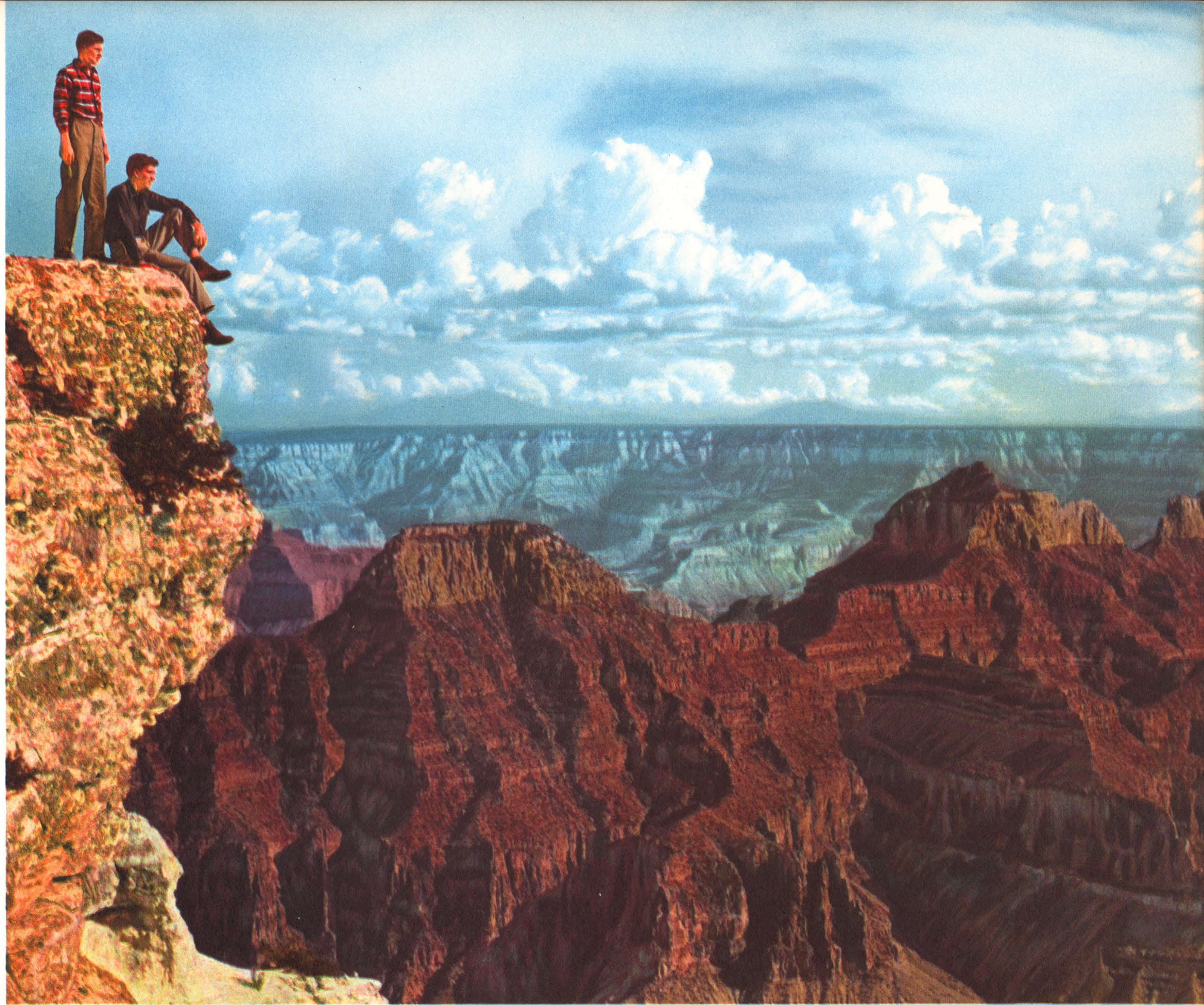
Grand Canyon from North Rim — immense, awesome, yet intimate and friendly with those who learn to know and love it.

Many travelers enroute to or from California, via Union Pacific, arrange for stop-over privileges at these world-famed National Parks.