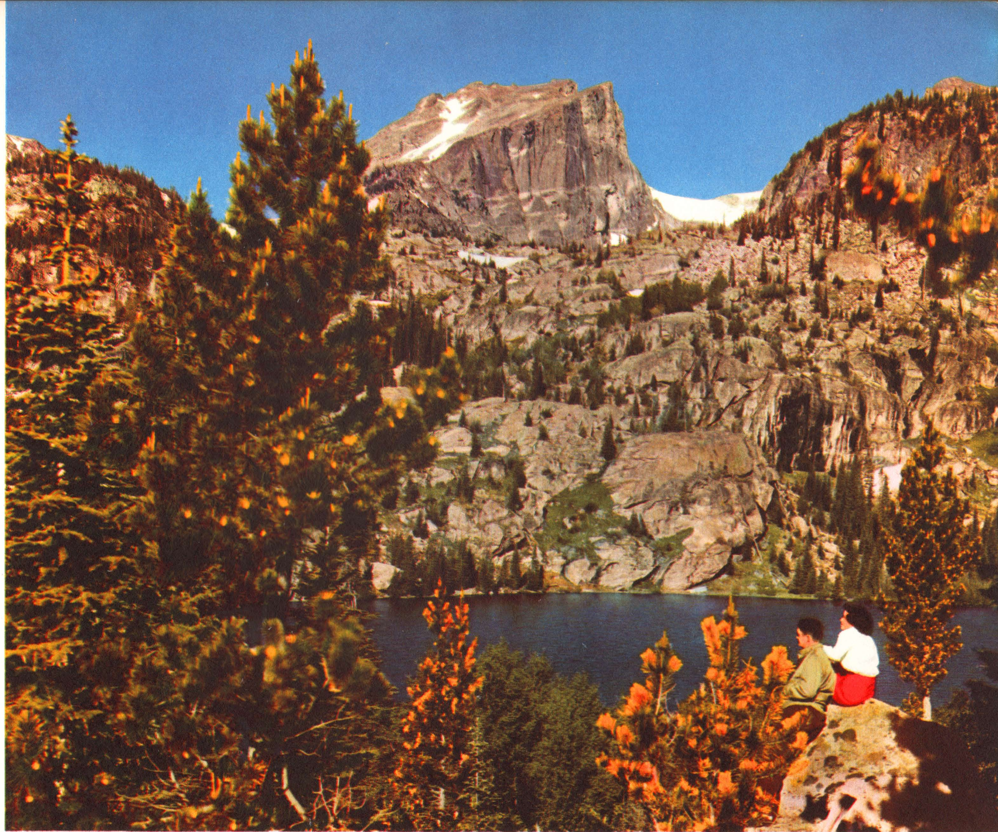
Bear Lake and Hallett Peak—One of the great scenic gems in Rocky Mountain National Park, Colorado.

The most noble grouping of these mountain masses is to be found in a compact area of about 400 square miles, some 70 miles northwest of Denver. This region, set aside as a national playground, is known as Rocky Mountain National Park. The famous Estes Park and Estes Park village are adjacent to its eastern entrance. Bear Lake, Dream Lake, Fern Lake and other mountain-rimmed bodies of water of similar beauty are found in its inner recesses.