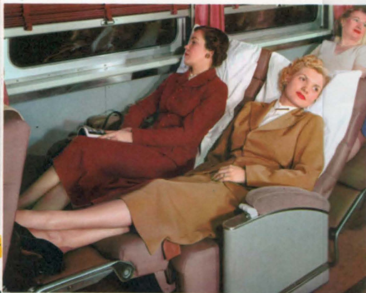
Coach seats have adjustable, reclining backs and stretch-out leg rests for day and night comfort.

● Whether you travel by Pullman or Coach, the modern equipment adds to the pleasure of your journey. Pullman accommodations include berths, roomettes and bedrooms. In the modern Coaches, as shown on the right, all seats are reserved in advance.