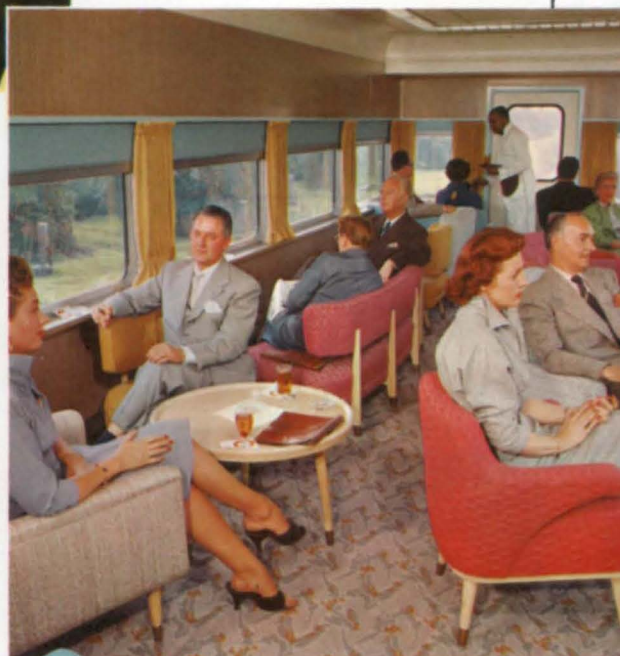
The Main Lounge of the Dome Lounge Car.

Children are given special attention. They enjoy the attractively illustrated souvenir menus which offer properly balanced meals at reduced prices. The Steward also has free coloring books and crayons for them.