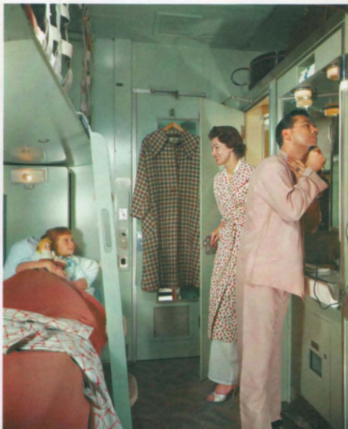
Bedrooms and roomettes offer privacy, comfort and safety.