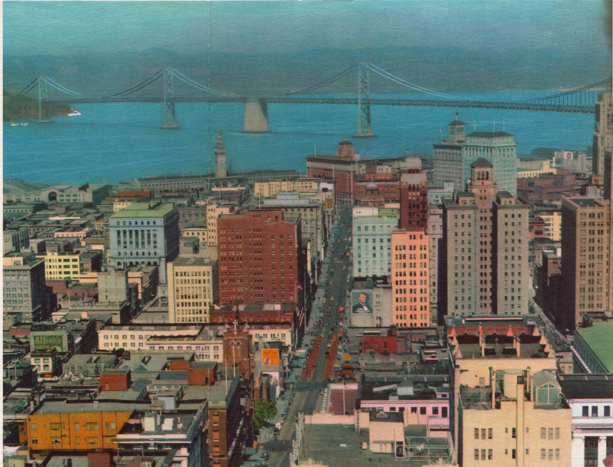
A portion of downtown San Francisco with the San Francisco-Oakland Bay Bridge in the background, also the Ferry Building and part of the Embarcadero.

Perhaps it is this fusing of so many races that contributes to the strength and vigor of San Francisco, and adds so much to its cosmopolitan charm. Truly, it is one of the great cities of the world.