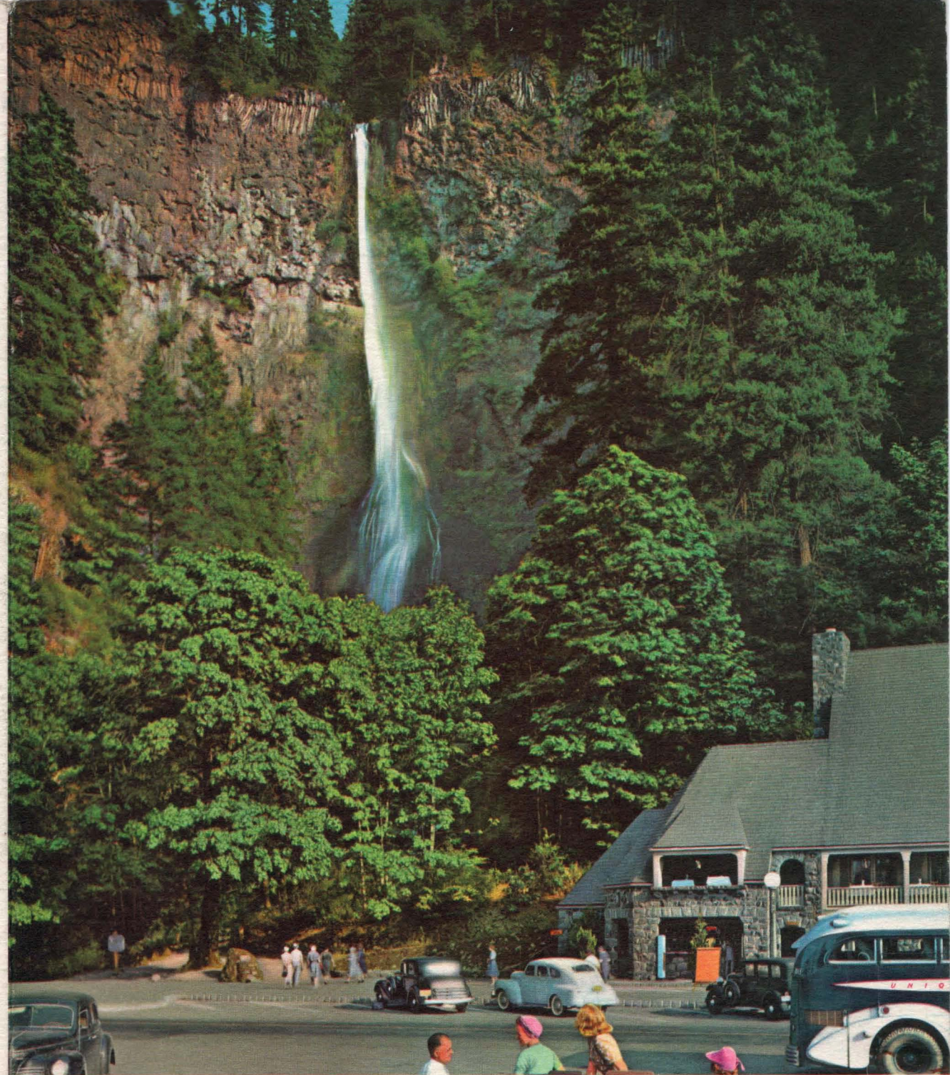
Graceful Multnomah Falls drops daintily a distance of 620 feet into a tree-fringed bowl sending up a cloud of misty spray.