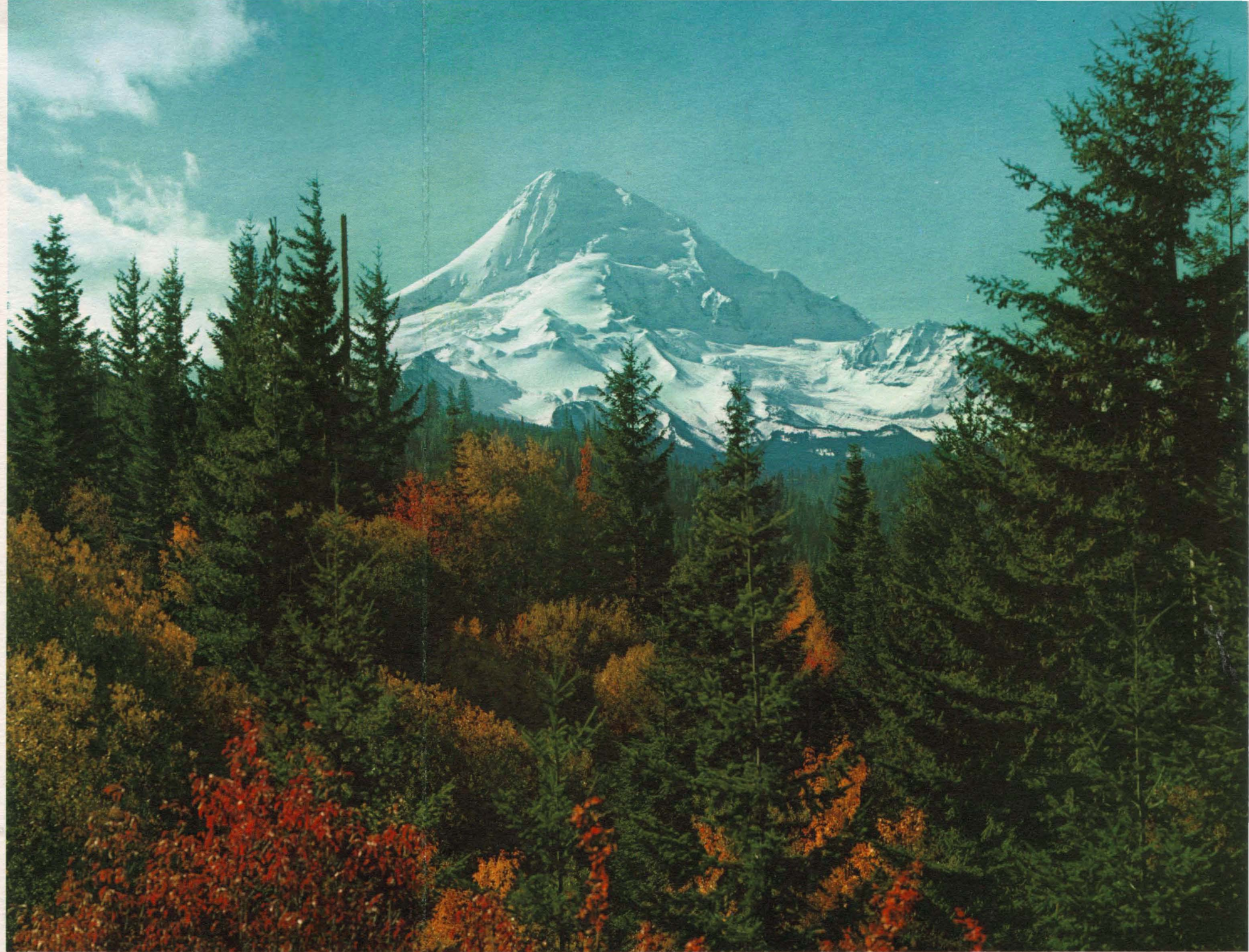
The brilliant fall coloring of foliage enhances the beauty of snow-clad Mt. Hood in Oregon

The Streamliner "City of Portland" parallels the majestic Columbia River for nearly 200 miles to and from Portland.