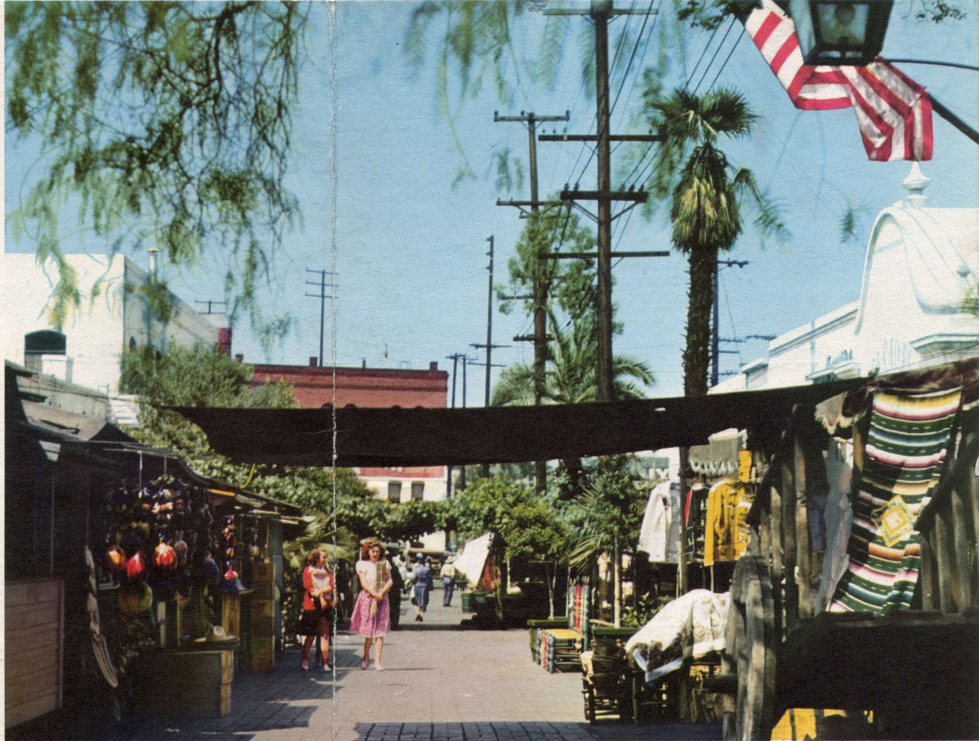
Quaint Olvera Street, in downtown Los Angeles, is a colorful and charming bit of Old Mexico right in the heart of the city.

The work of restoring this particular bit of present-day Los Angeles to the manner of an old Mexican street was completed and the street dedicated in 1930. Seventy shops of various kinds line either side and in the center are stalls and booths with tempting souvenir articles for sale. Baskets, beadwork, lacework, sombreros, Mexican delicacies and hundreds of other articles line the shelves and counters. Brilliantly colored gourds and other dried fruits and vegetables hang from the canopies. Gay caballeros strum guitars in front of the colorful cafes, and a carnival atmosphere prevails. Several shops feature the manufacture of sweet-scented candles, and native candlemakers may be seen at work practicing the art that has been handed down from generation to generation. A carved wooden cross at the entrance commemorates the founding of the pueblo of Los Angeles in 1781.