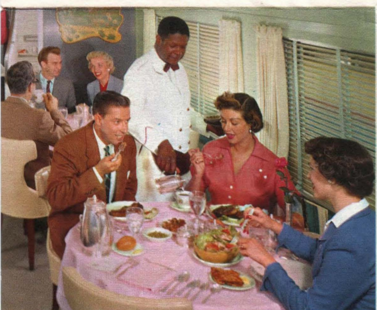
A section of the beautifully appointed main dining room.