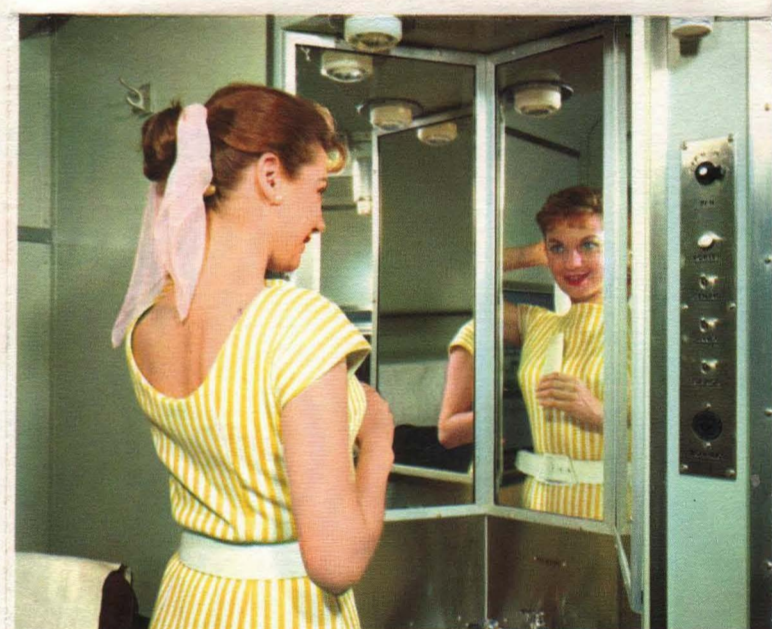
Women patrons in the new bedrooms or compartments will be delighted with vanity mirror and wash basin with cosmetic tray. Each room has enclosed toilet facilities.

The "City of Los Angeles" Domeliner offers you a choice of the very newest style in Pullman accommodations. New Pullmans have push-button doors a child can open. Spacious bedrooms—single and en suite—compartments and drawing rooms have enclosed toilet facilities.