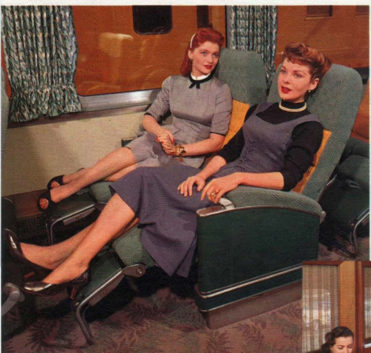
Latest style Coaches are not only economical but are designed for restful comfort, day or night. The seat backs may be adjusted to reclining positions and the full-length leg rests are foam rubber padded, assuring head-to-toe comfort.