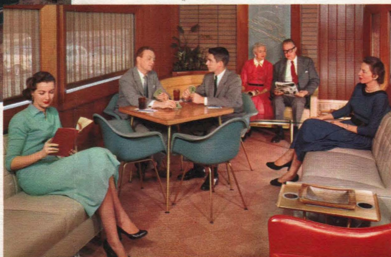
In addition to the three Astra Dome cars the "City of Los Angeles" also features a beautiful Redwood Club-Lounge . . . it is in a new Pullman which has five double bedrooms of the very newest design.