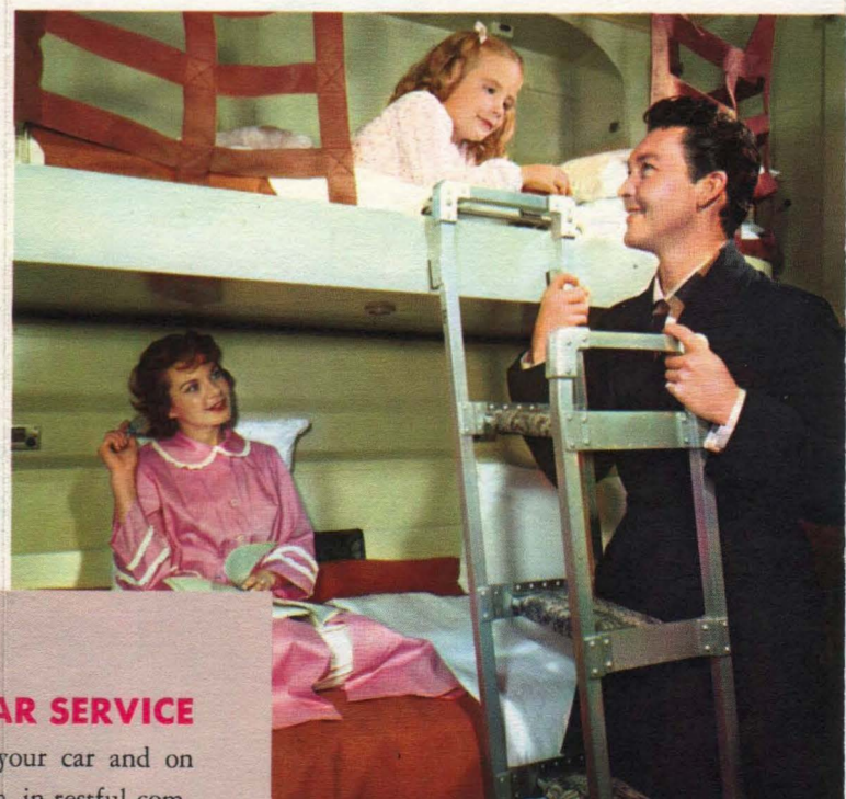
Comfortable beds and clean, crisp linens add to the pleasure of Pullman travel. A newly designed ladder with hand rail is an added convenience.