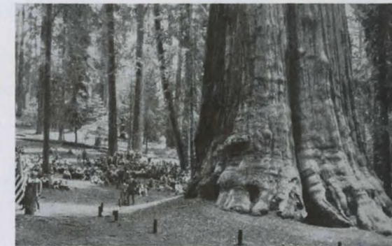
General Sherman tree—Sequoia National Park