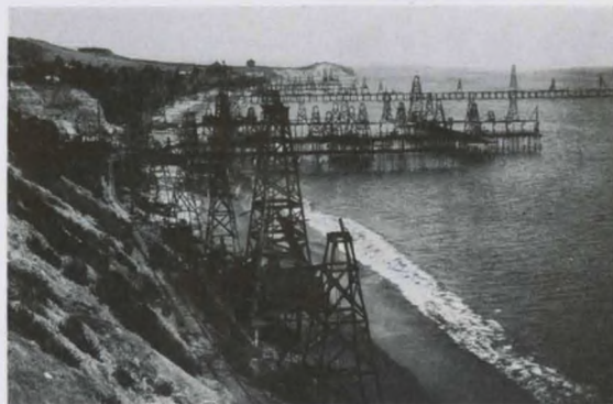
Oil wells at Summerland