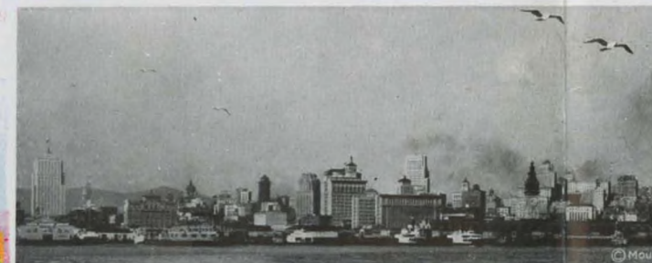
Your introduction to San Francisco!