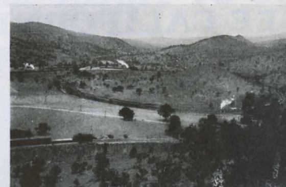
Tehachapi "loop"—railroad engineering feat

Note —Through sleeper to Yosemite leaves Los Angeles 6:05 P.M. on "West Coast," arriving El Portal 9:55 A.M.