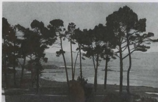
Carmel Bay—Monterey Peninsula

L EAVING Los Angeles, you pass through the San Fernando Valley. Then over the San Fernando Mountains. Ventura, by the sea, with Mission San Buenaventura to be seen from your train. Summerland, where you see oil being pumped from beneath the ocean's bed.