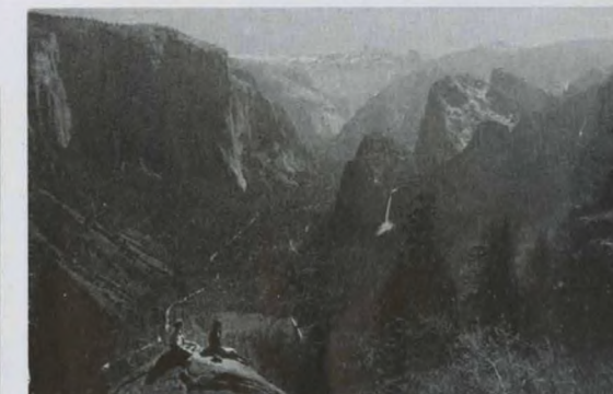
Yosemite Valley—from Inspiration Point