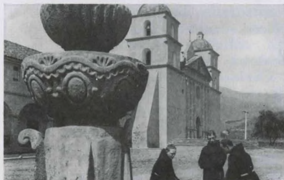
Mission Santa Barbara