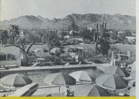
• SOUTHERN ARIZONA desert winter resort.