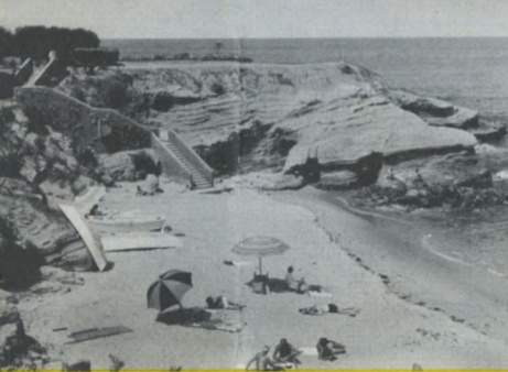
· CALIFORNIA is famous for its beaches.