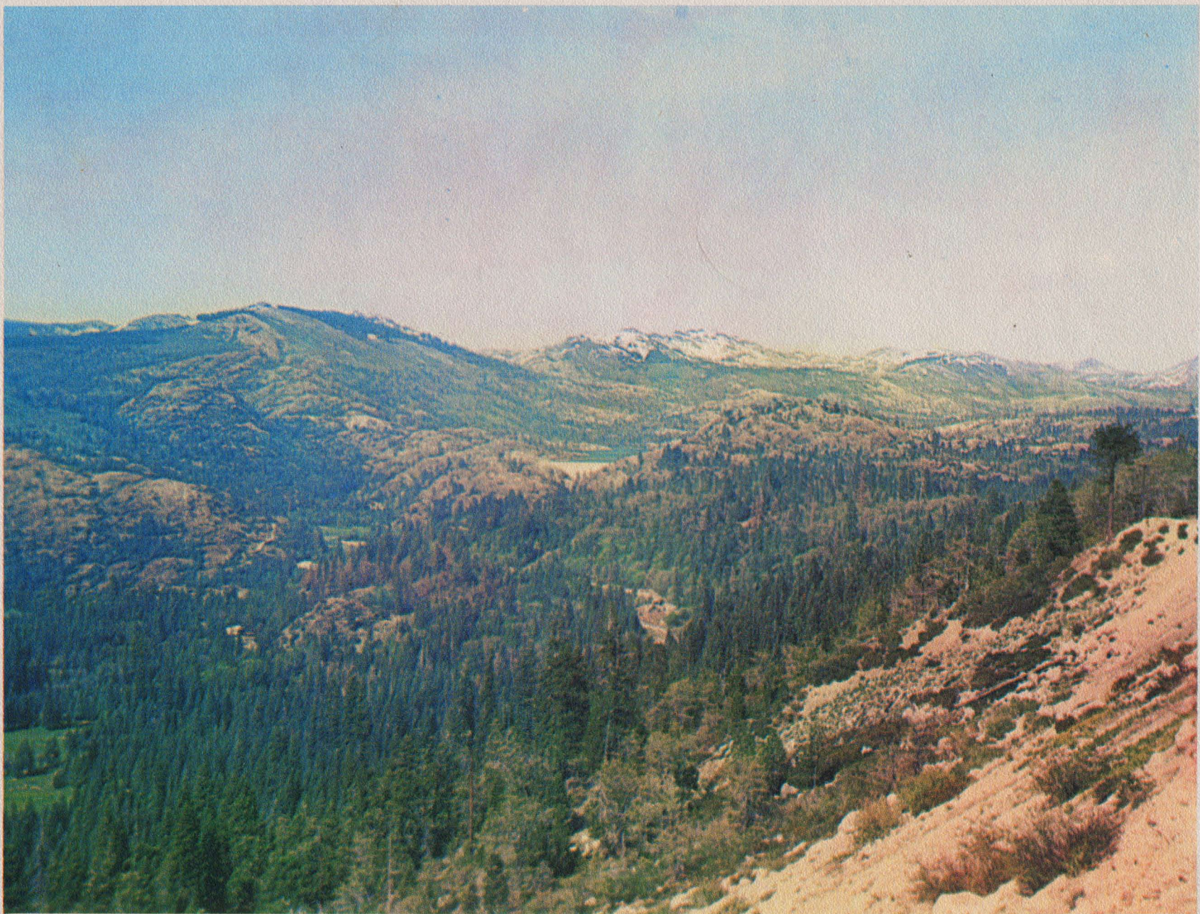
EMIGRANT GAP, MOST FAMOUS OF MANY SIERRA PASSES USED BY EARLY IMMIGRANTS IN THEIR TREK TO CALIFORNIA