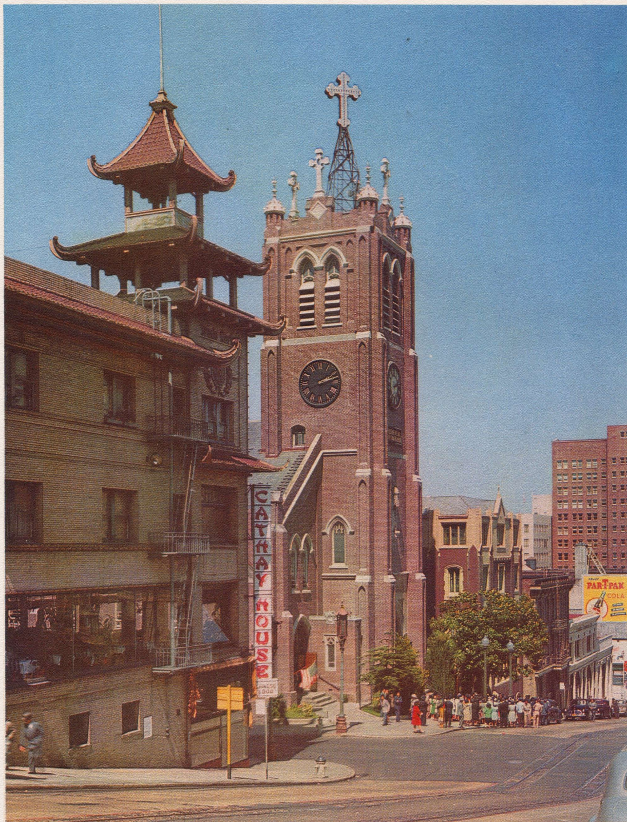
OLD ST. MARY'S CHURCH IN SAN FRANCISCO'S CHINATOWN