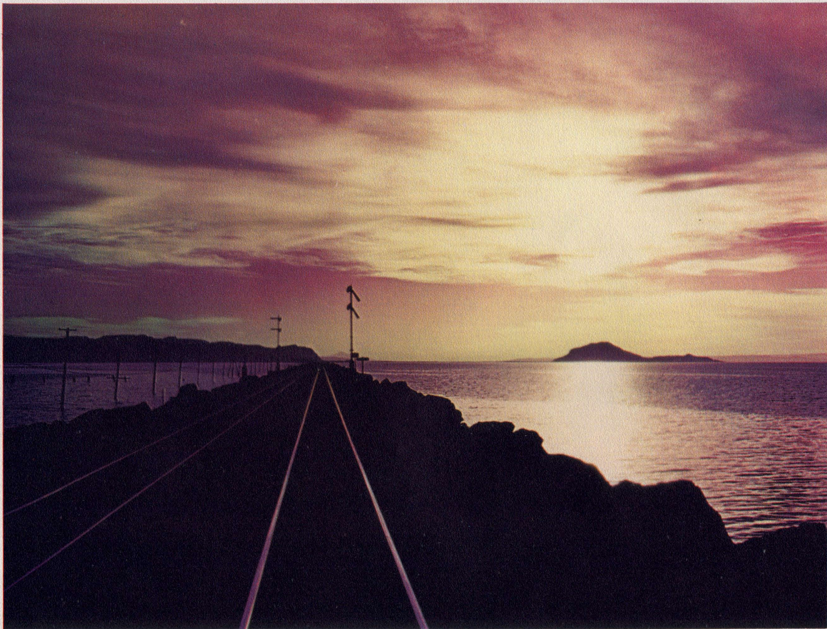
THE GREAT SALT LAKE AT SUNSET