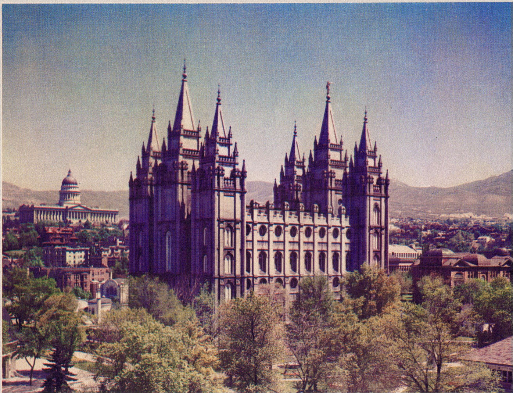
THE MORMON TEMPLE (FOREGROUND) AND THE CAPITOL OF THE STATE OF UTAH (LEFT REAR), SALT LAKE CITY