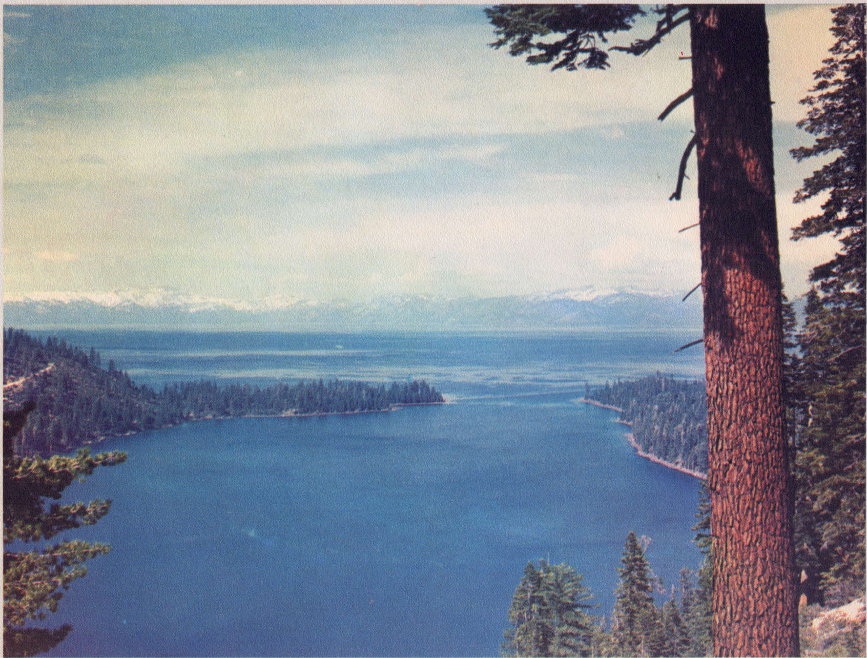
MILE-HIGH LAKE TAHOE SURROUNDED BY SNOW-COVERED PEAKS OF CALIFORNIA'S HIGH SIERRA