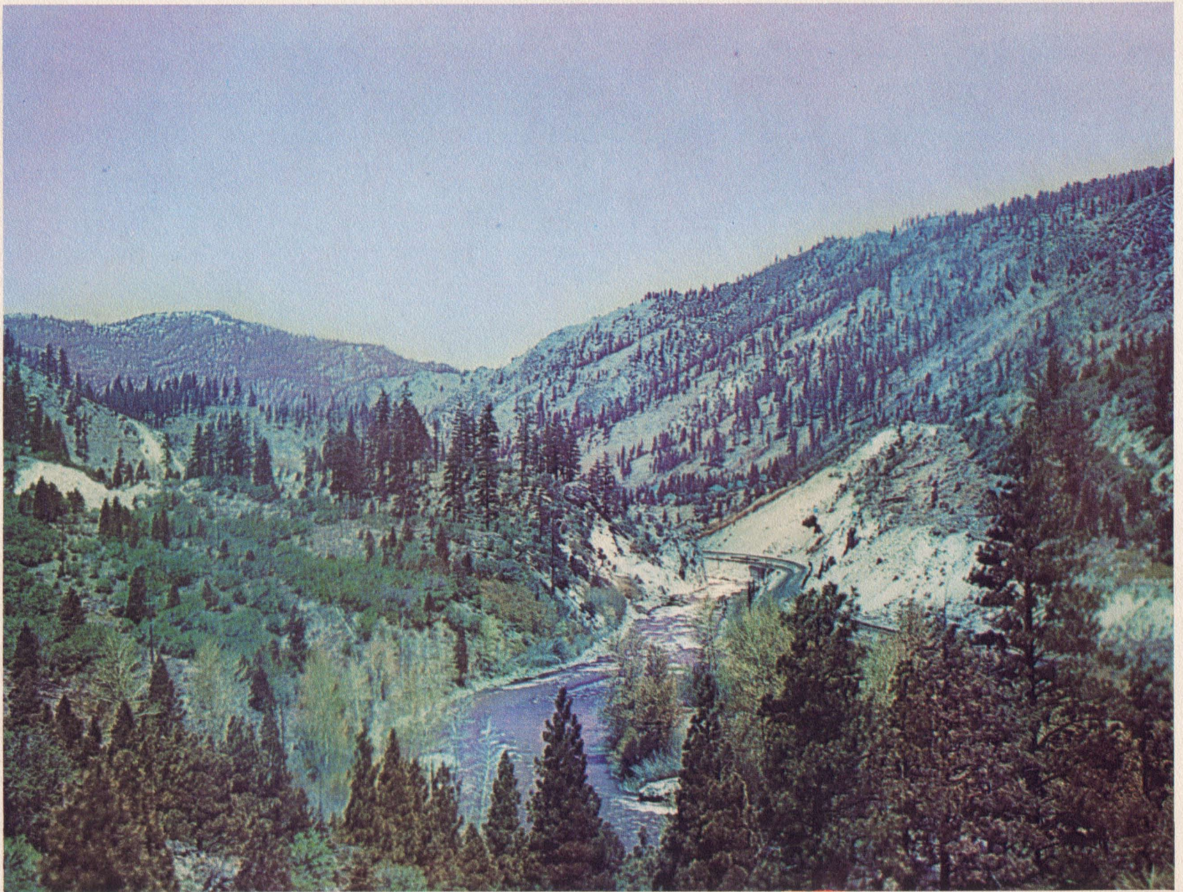
THE TRUCKEE RIVER CANYON ON THE EASTERN SLOPE OF THE SIERRA