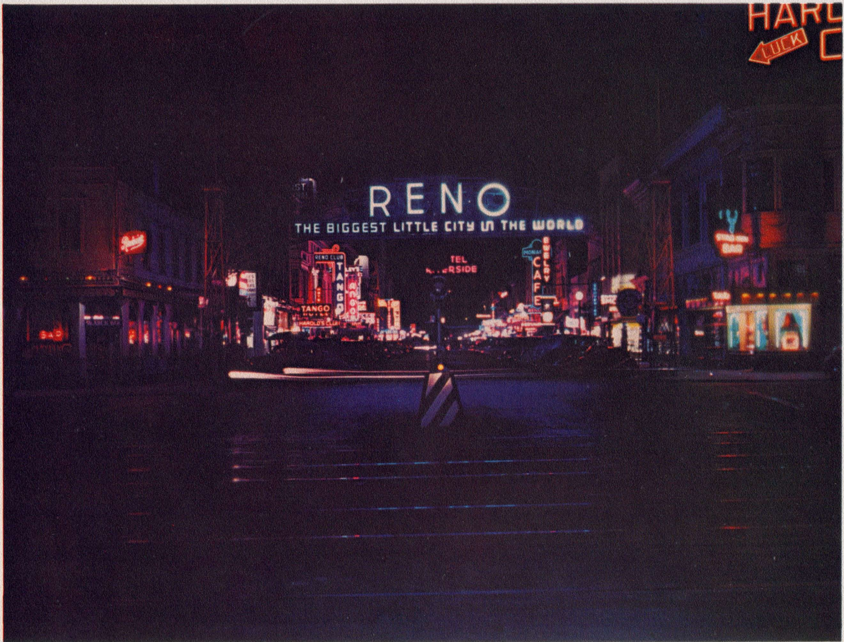
RENO, NEVADA AT NIGHT