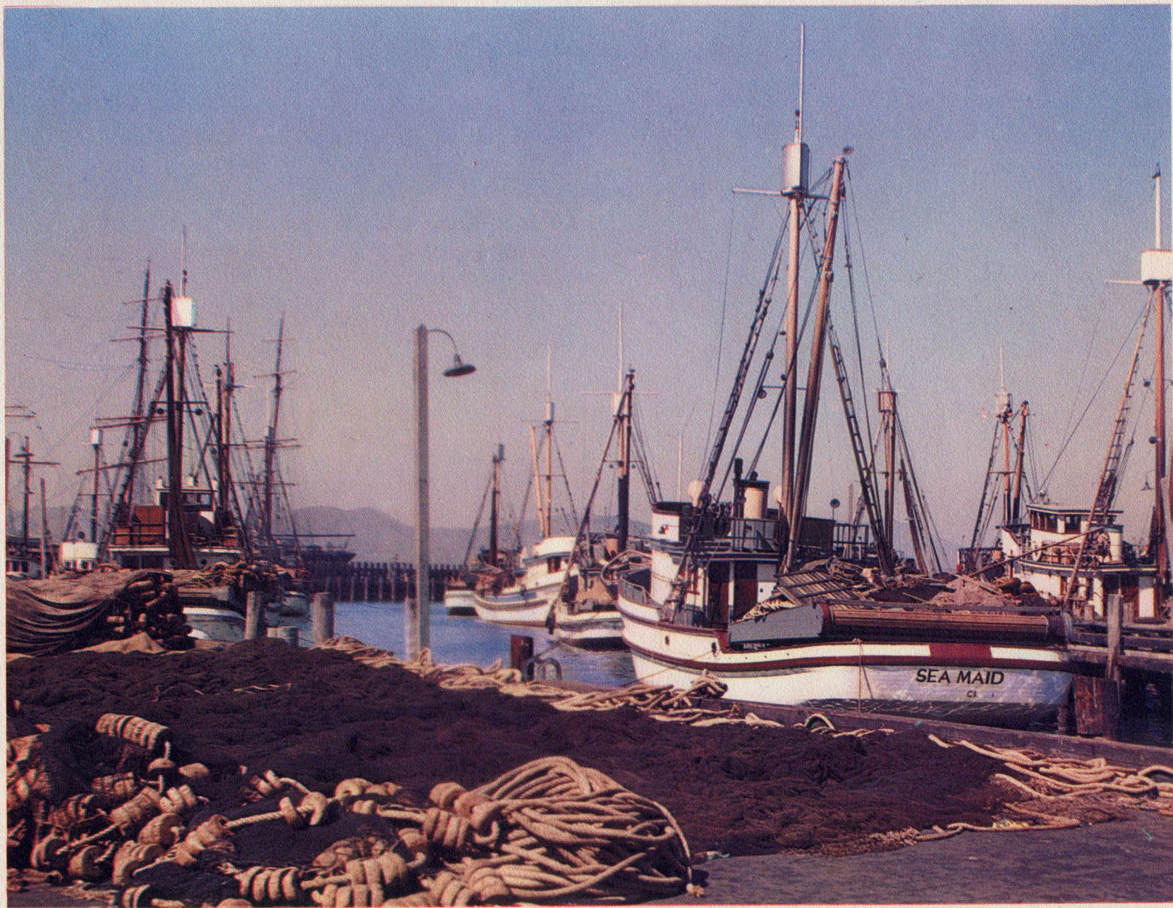
FISHERMAN'S WHARF, SAN FRANCISCO