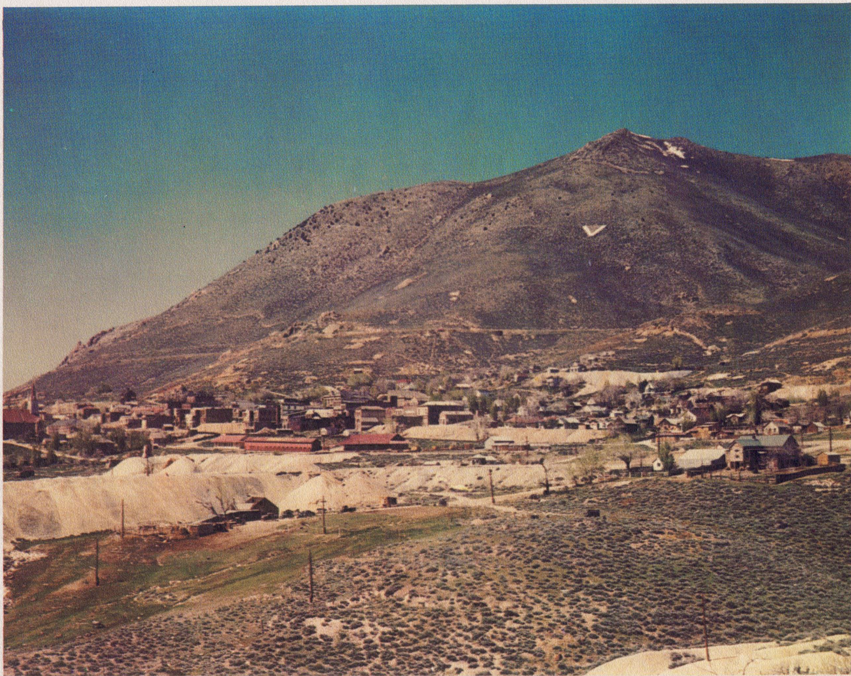
VIRGINIA CITY, NEVADA, CENTER OF THE FAMED COMSTOCK LODGE