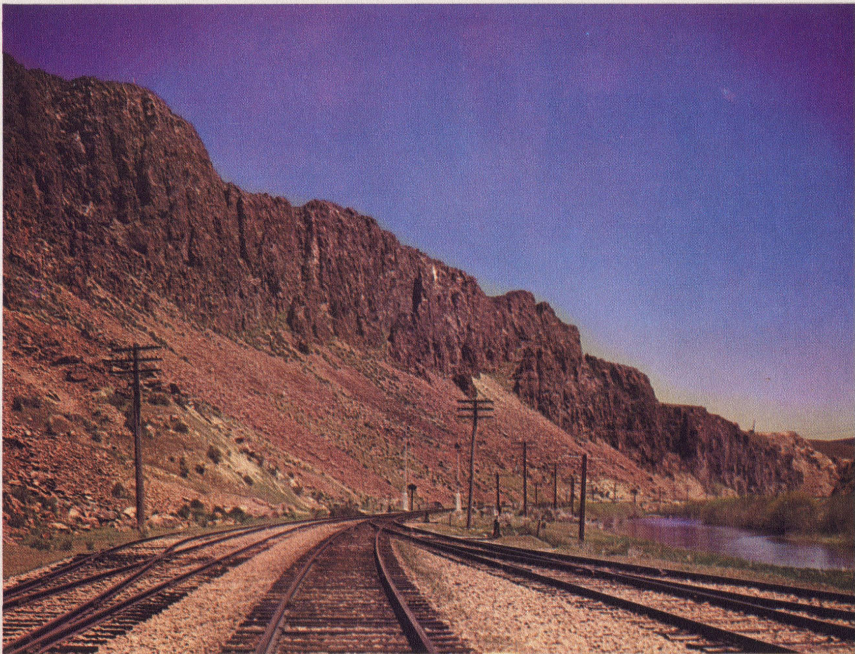
PALISADES CANYON, NEVADA