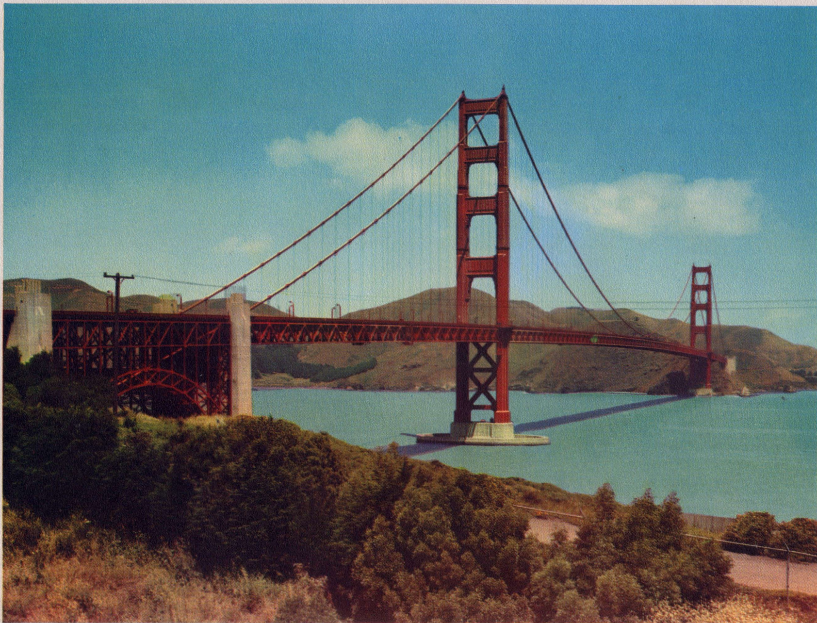
THE GOLDEN GATE BRIDGE, SAN FRANCISCO. WORLD'S LONGEST SINGLE SPAN—4,200 FEET