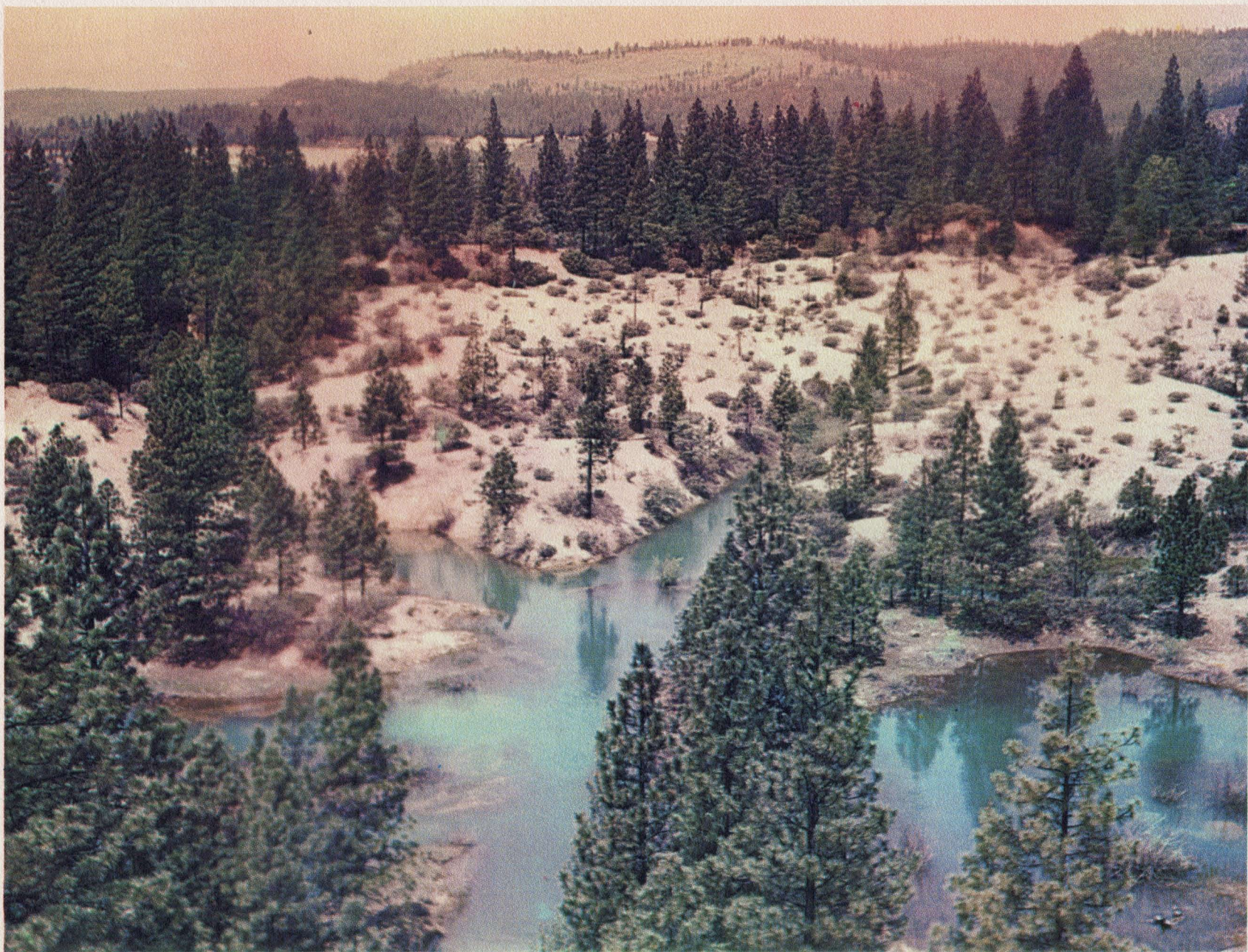
PLACER WORKINGS IN CALIFORNIA'S SIERRA GOLD COUNTRY