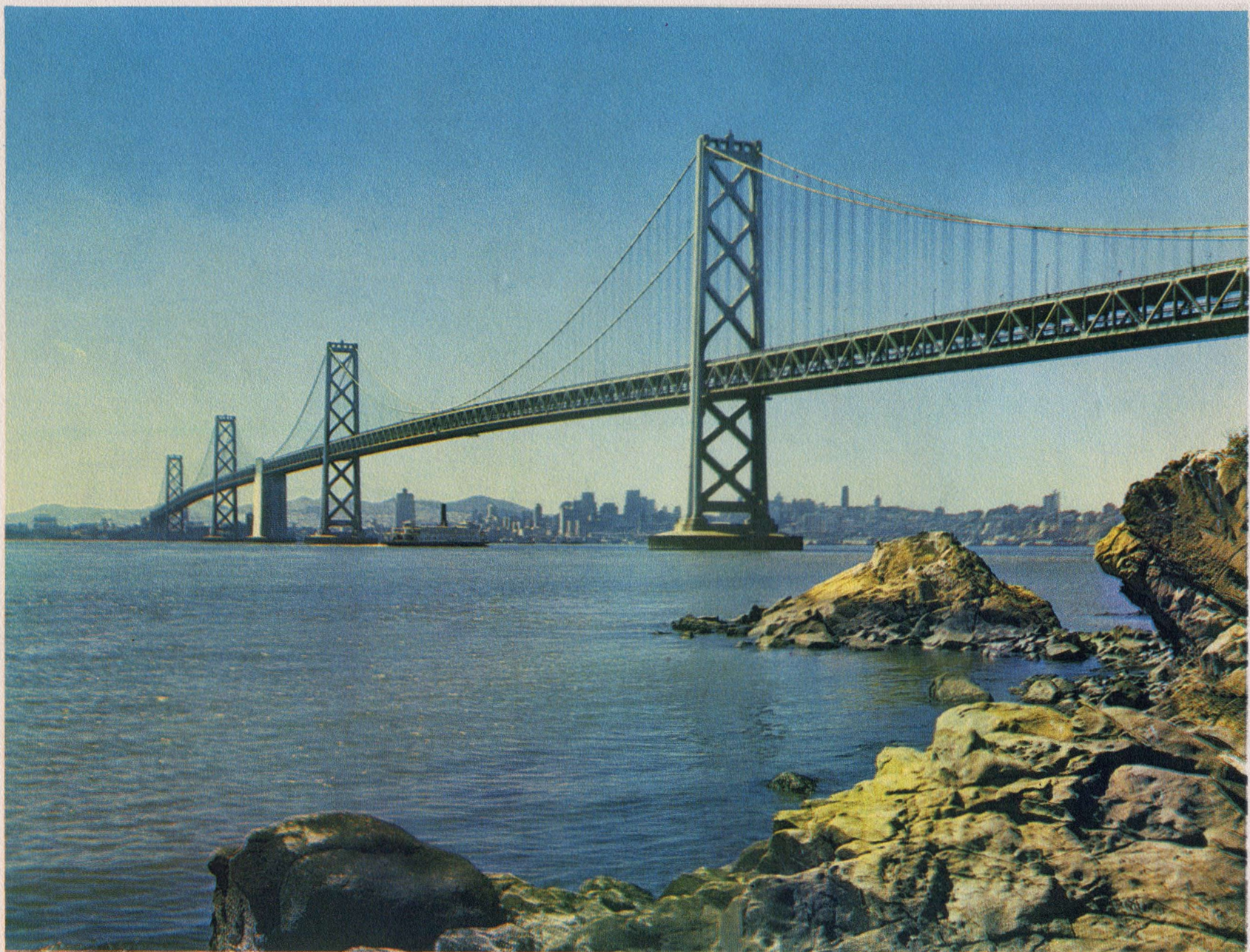
THE SAN FRANCISCO-OAKLAND BAY BRIDGE FROM YERBA BUENA ISLAND—SAN FRANCISCO'S SKYLINE IN DISTANCE