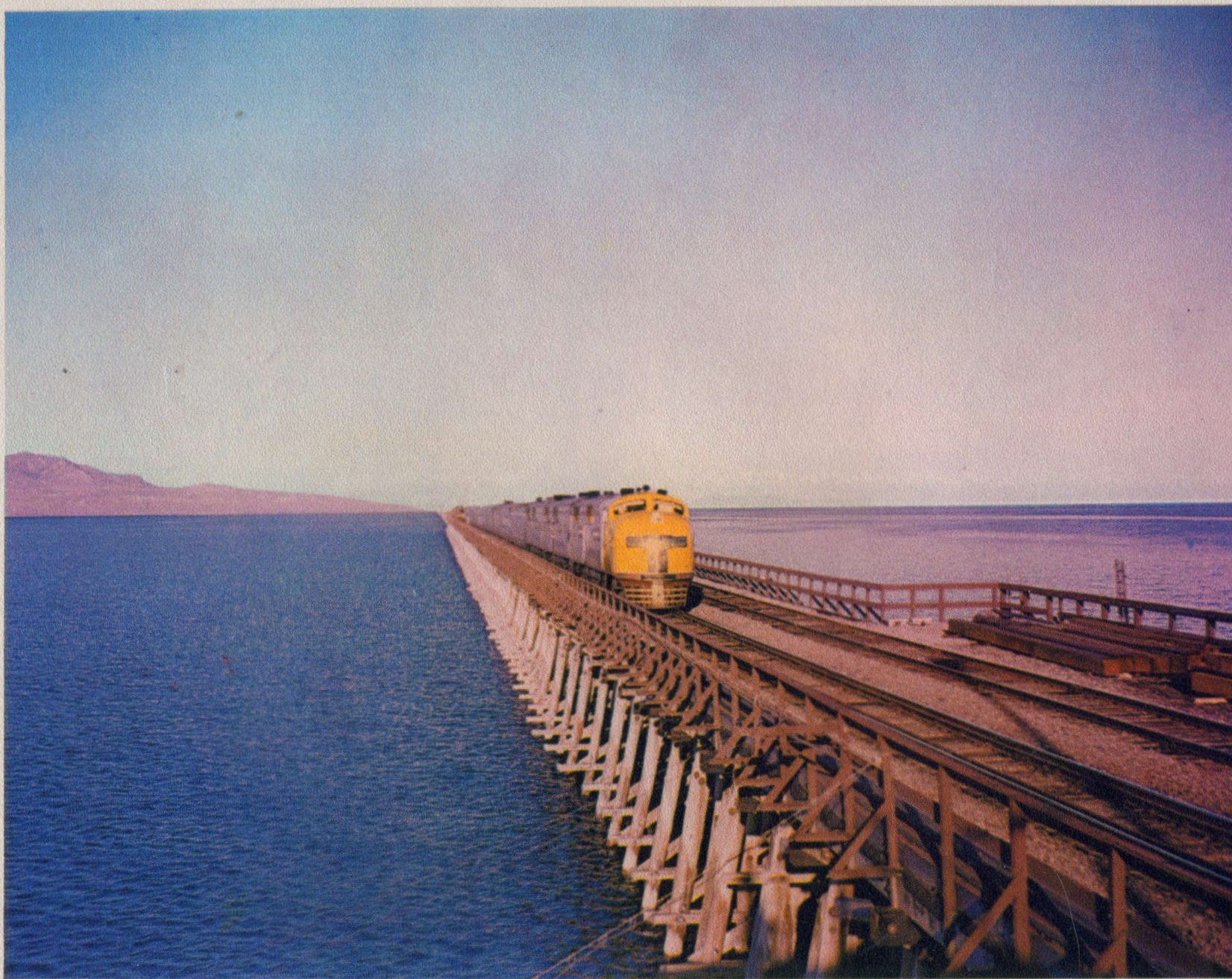
GOING TO SEA BY RAIL—THE "CITY OF SAN FRANCISCO" ON THE 32-MILE LUCIN CAUSEWAY ACROSS GREAT SALT LAKE