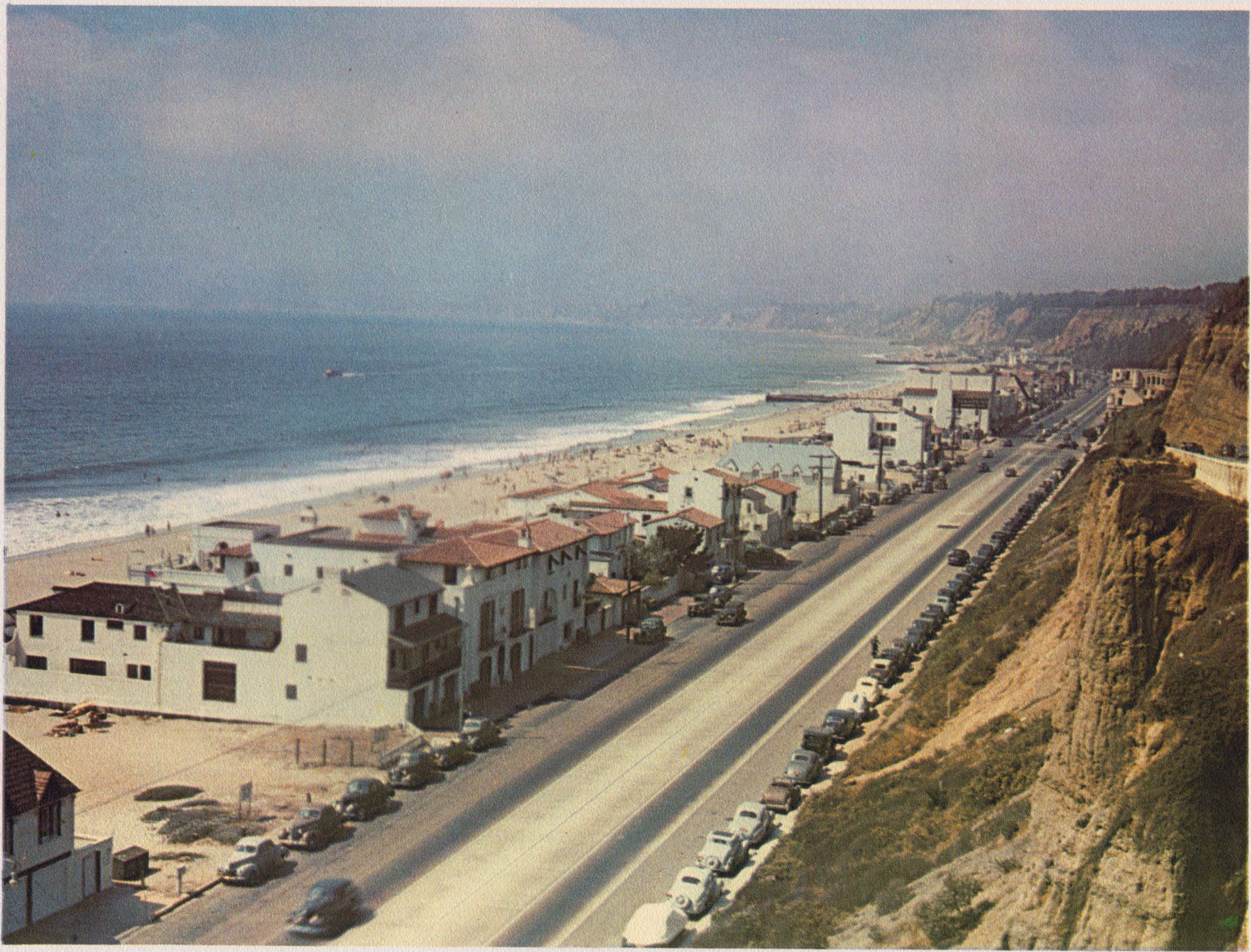
SANTA MONICA BEACH, SOUTHERN CALIFORNIA