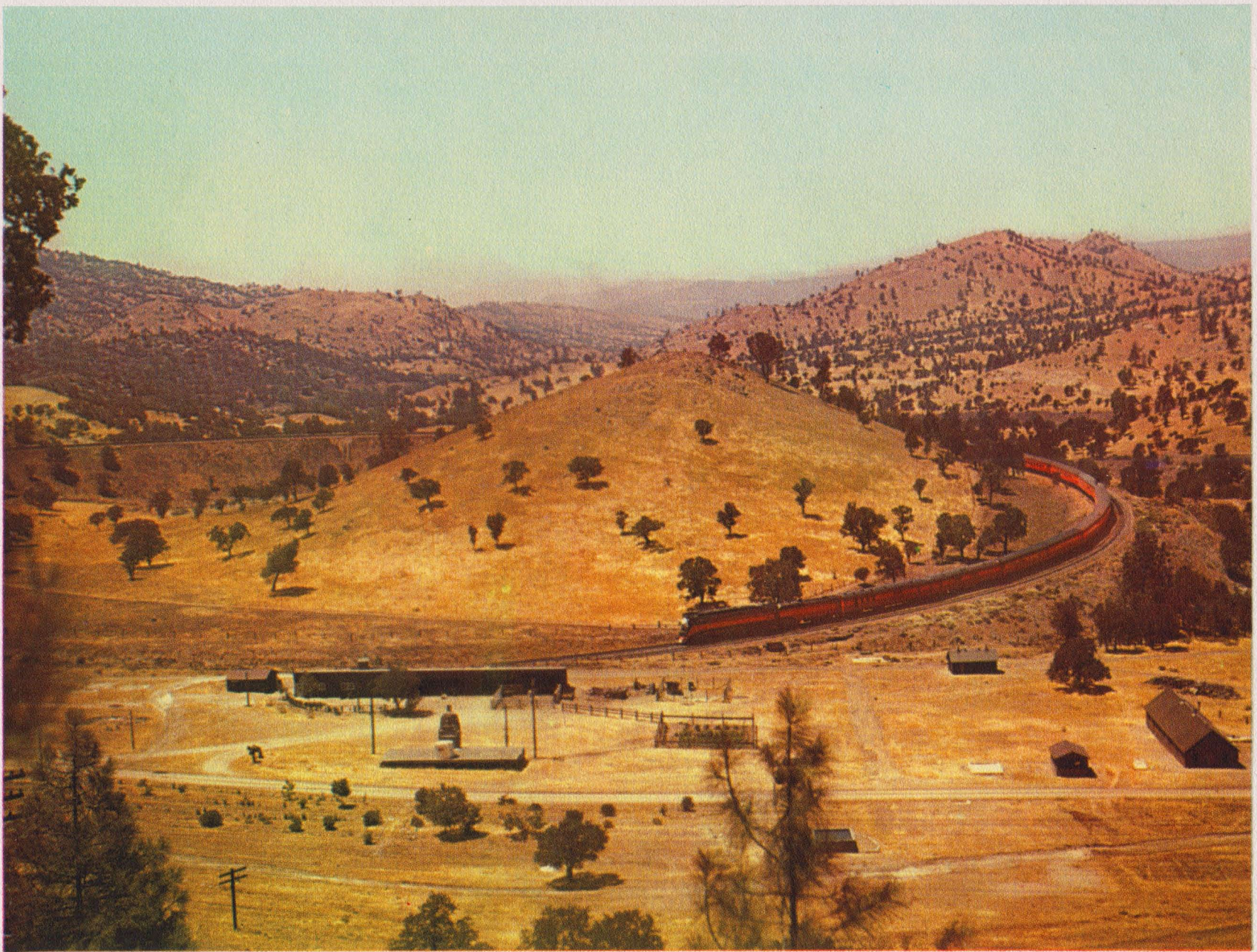
THE STREAMLINED "SAN JOAQUIN DAYLIGHT" ON THE VALLEY ROUTE'S TEHACHAPI LOOP BETWEEN SAN FRANCISCO AND LOS ANGELES