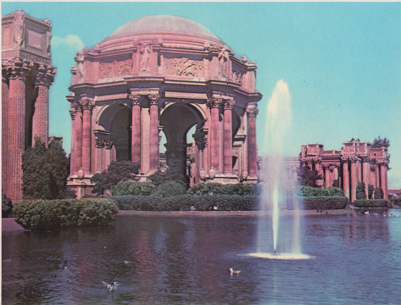
THE PALACE OF FINE ARTS, SAN FRANCISCO