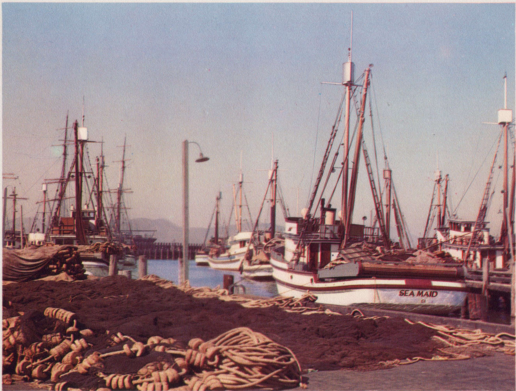
FISHERMAN'S WHARF, SAN FRANCISCO