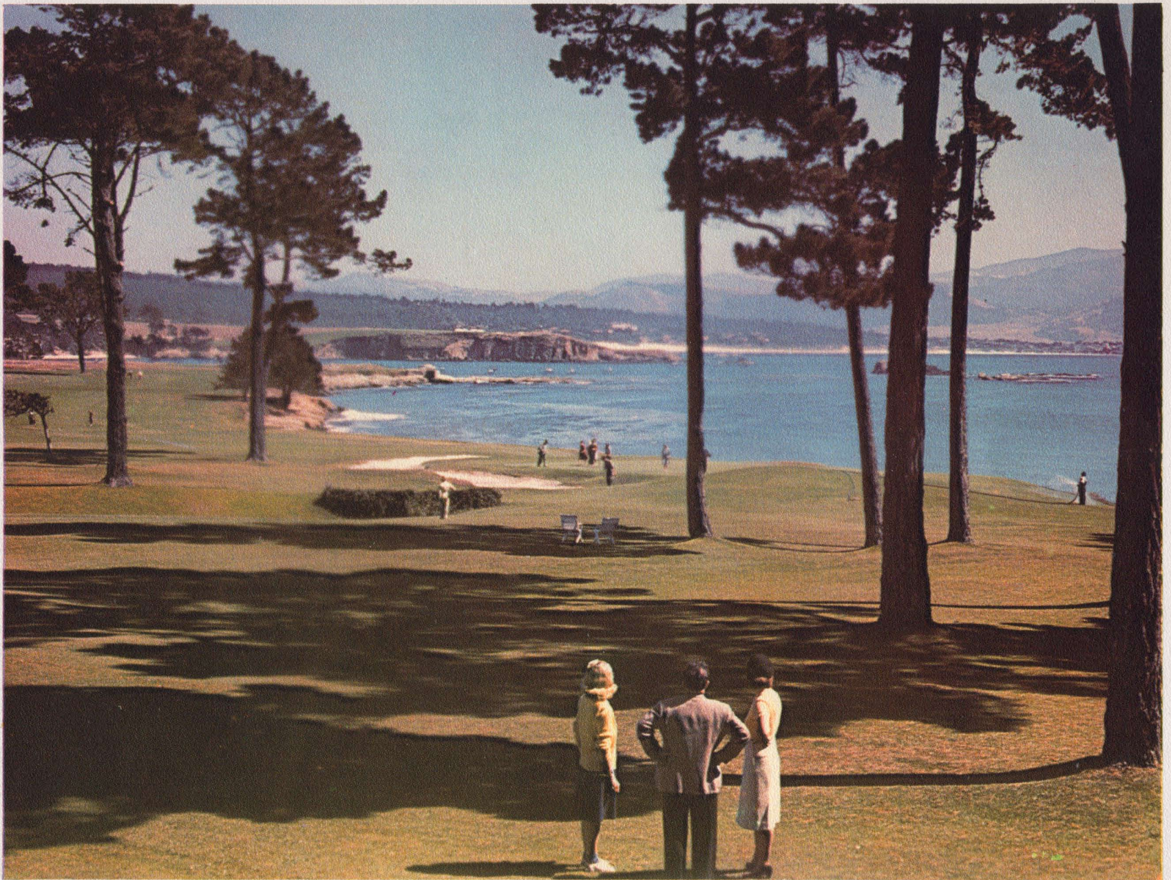
PEBBLE BEACH GOLF COURSE ON CALIFORNIA'S MONTEREY PENINSULA