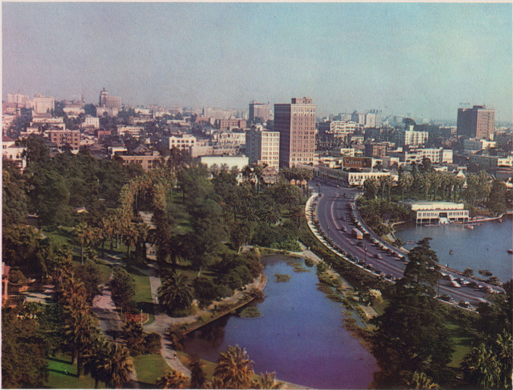
WILSHIRE BOULEVARD THROUGH MacARTHUR PARK, LOS ANGELES