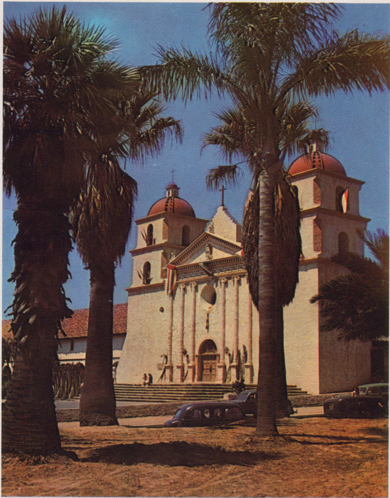
MISSION SANTA BARBARA, FOUNDED 1876, SANTA BARBARA, CALIFORNIA