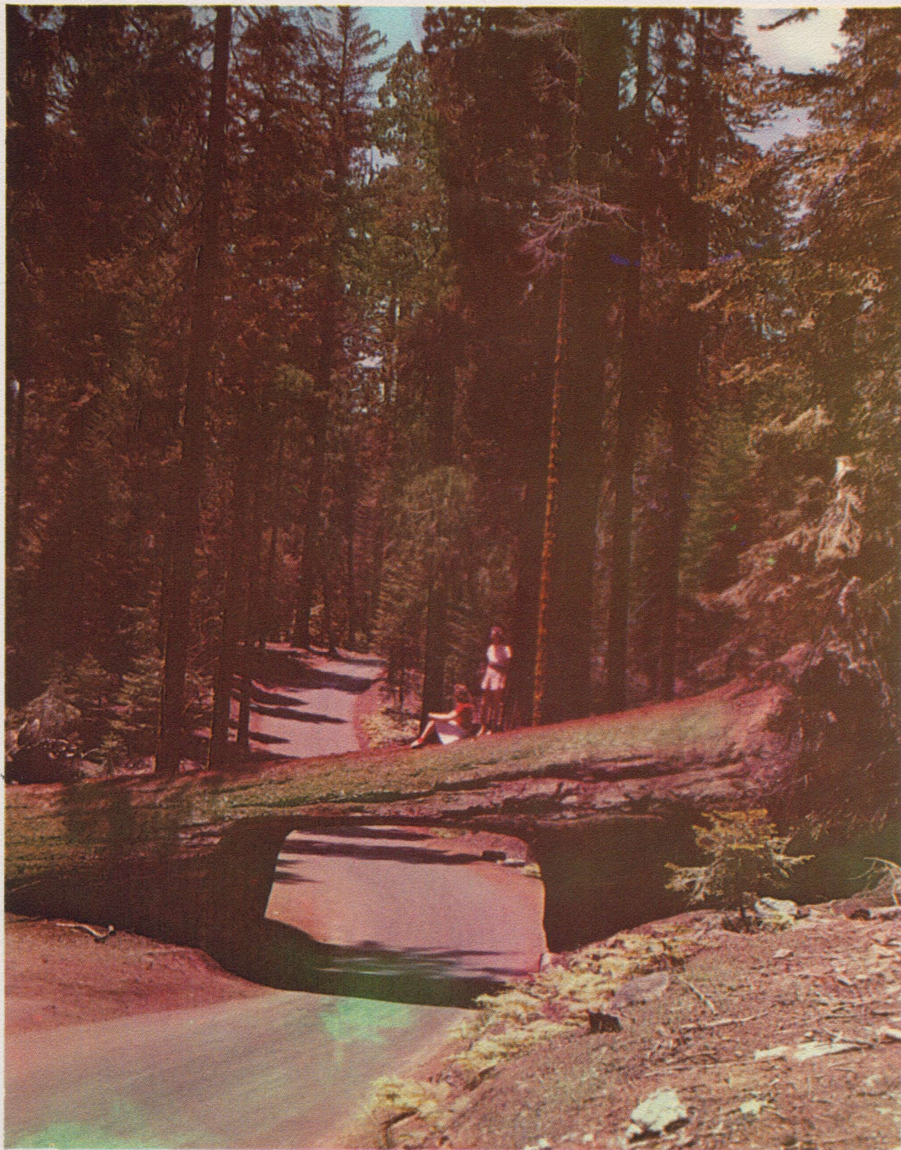
SEQUOIA-KING'S CANYON NATIONAL PARK, CALIFORNIA