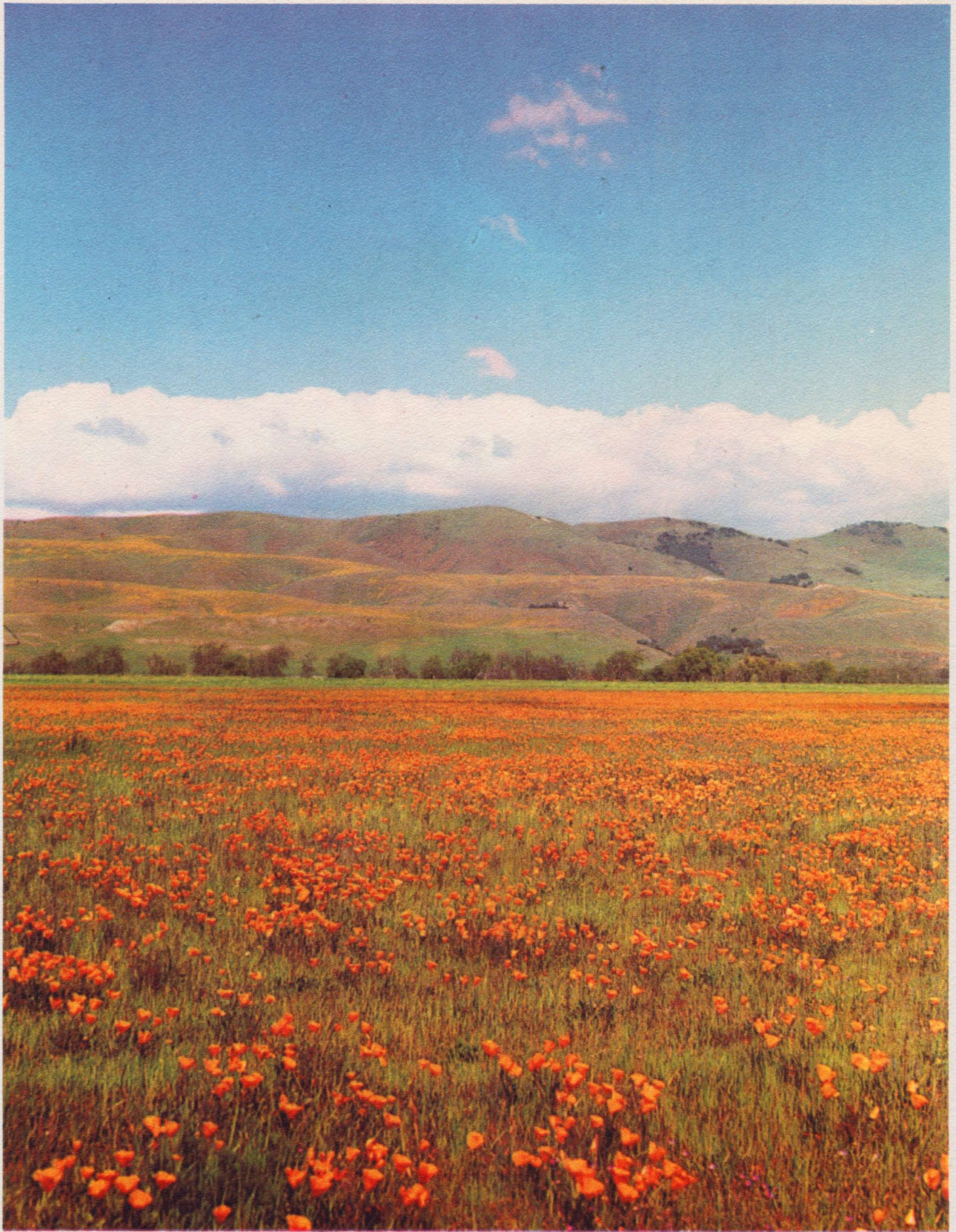
A FIELD OF CALIFORNIA POPPIES ON THE VALLEY ROUTE BETWEEN SAN FRANCISCO AND LOS ANGELES