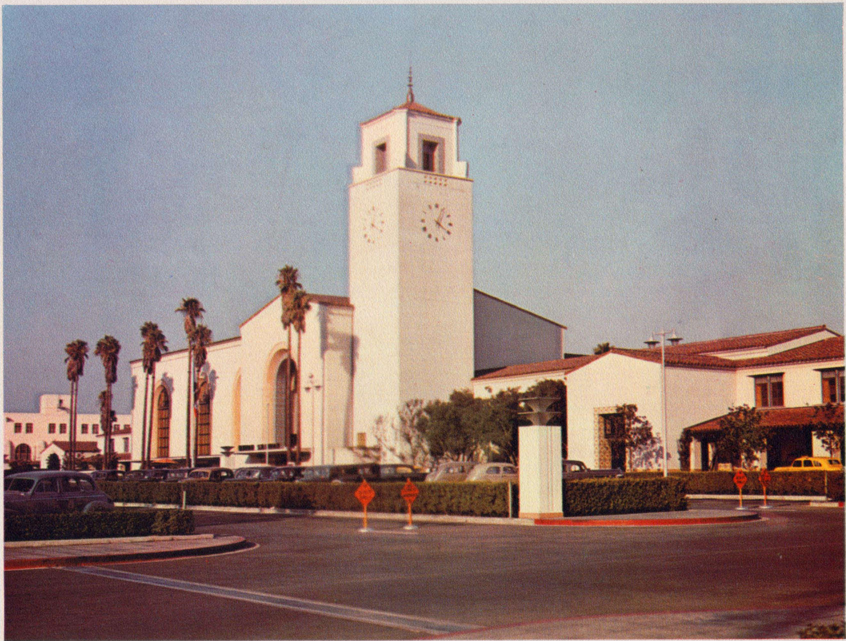
UNION PASSENGER TERMINAL, LOS ANGELES