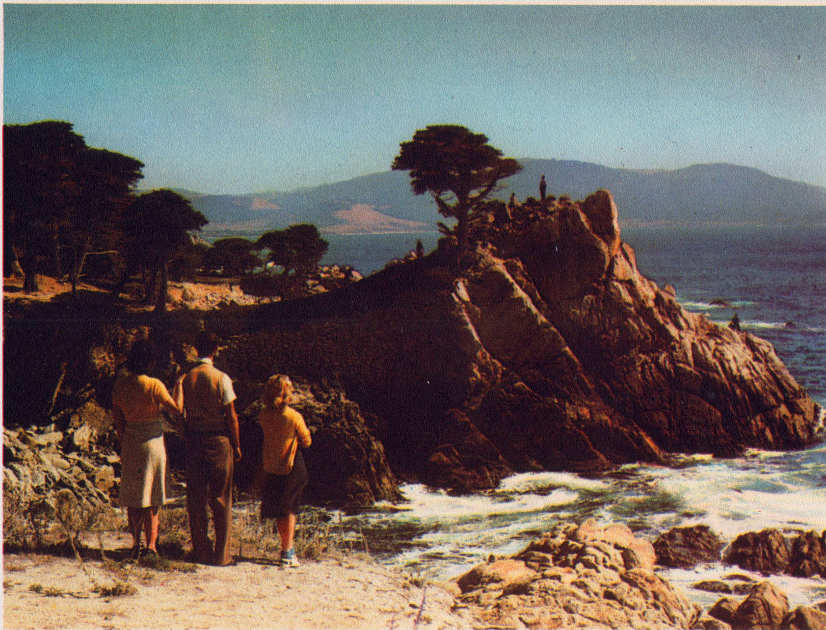
MIDWAY POINT ON NORTHERN CALIFORNIA'S MONTEREY PENINSULA