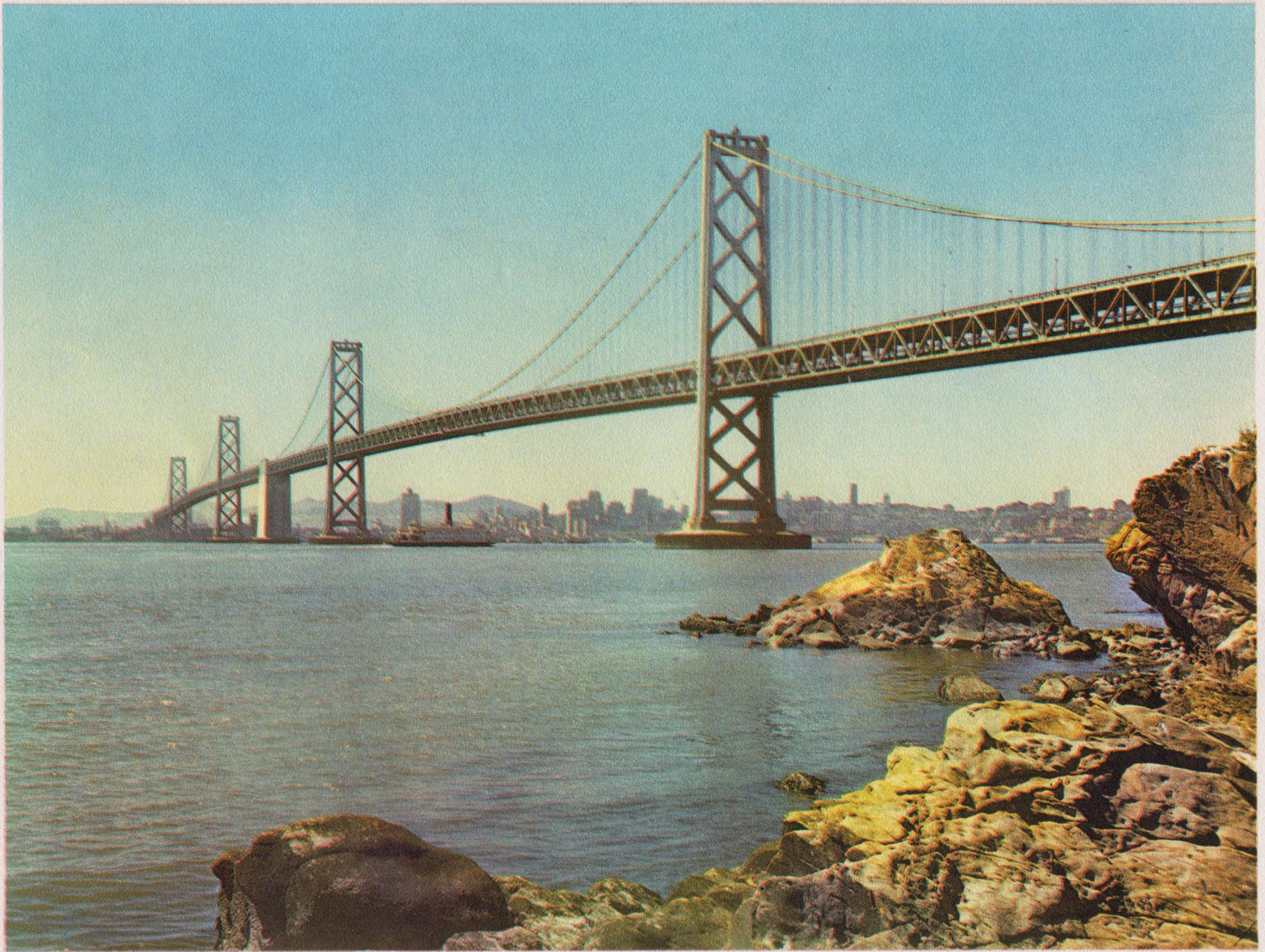
THE SAN FRANCISCO-OAKLAND BAY BRIDGE FROM YERBA BUENA ISLAND—SAN FRANCISCO'S SKYLINE IN DISTANCE