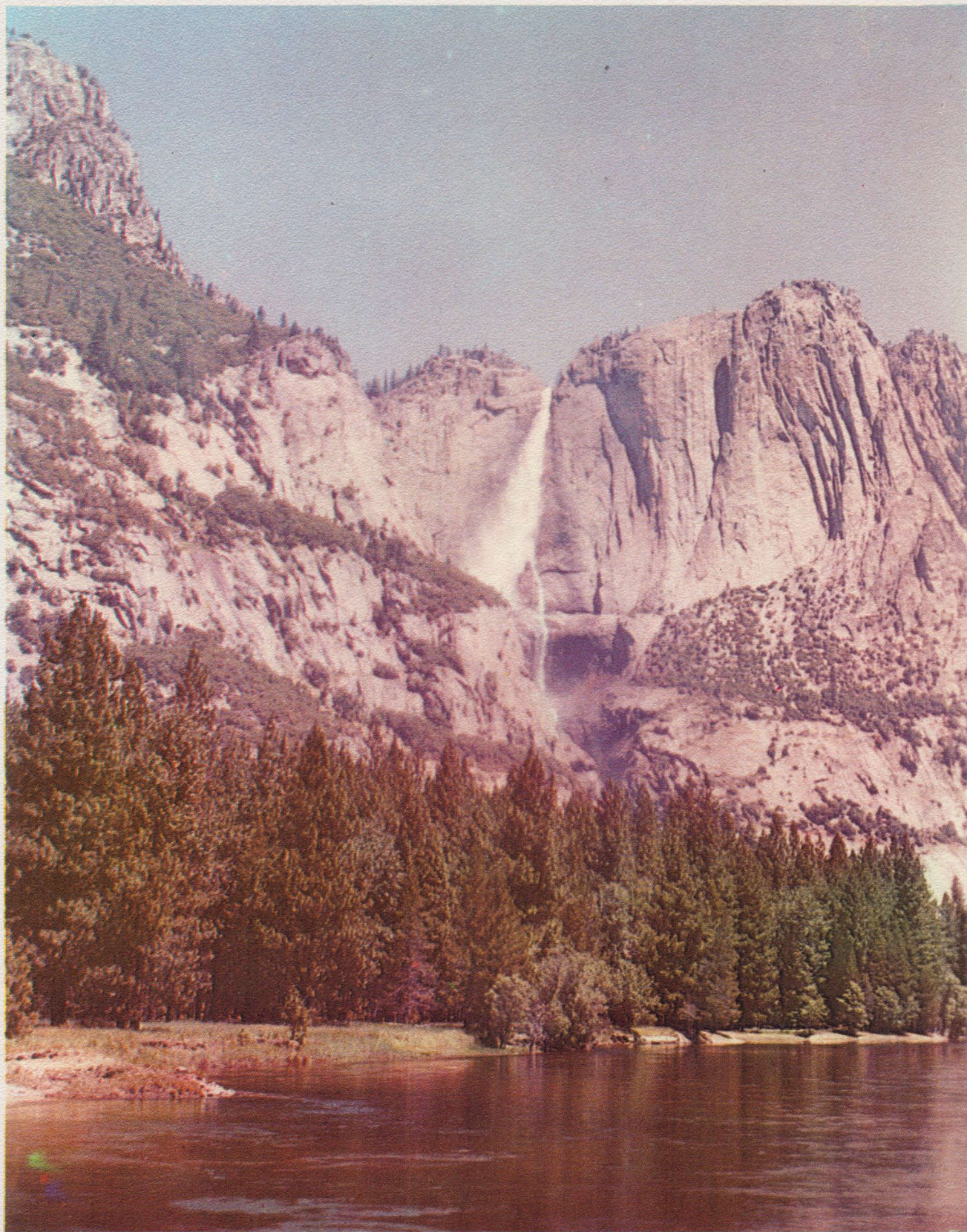
YOSEMITE FALLS, YOSEMITE NATIONAL PARK, CALIFORNIA