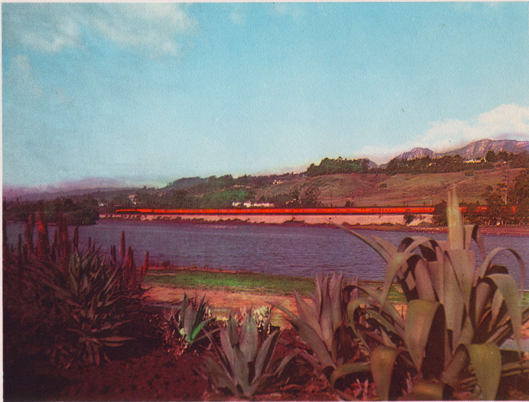
THE STREAMLINED "MORNING DAYLIGHT" ON THE COAST ROUTE BETWEEN SAN FRANCISCO AND LOS ANGELES