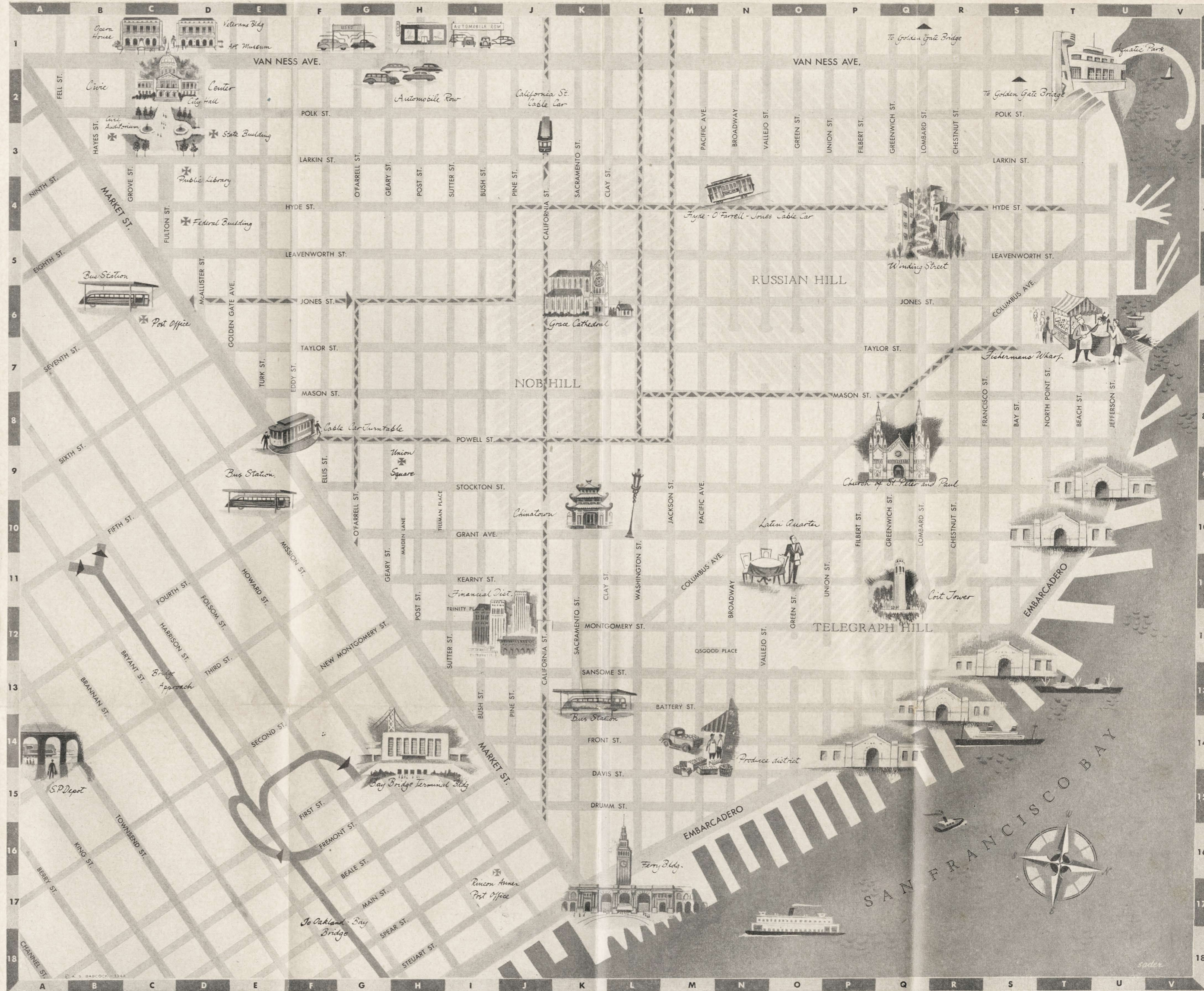
THE DOWNTOWN AREA—Its streets, cable car routes and three famous hills.

Ville de la Pair: Menu as luxurious as the Villa itself. Copious hors d'oeuvres with varied entrees from breast of pheasant to veal scallopine and steaks. Served in the finest French and Italian traditions. 251 Sixth St., Oakland, nr. Webster St. tunnel. TWInoaks 3-7556. I-8