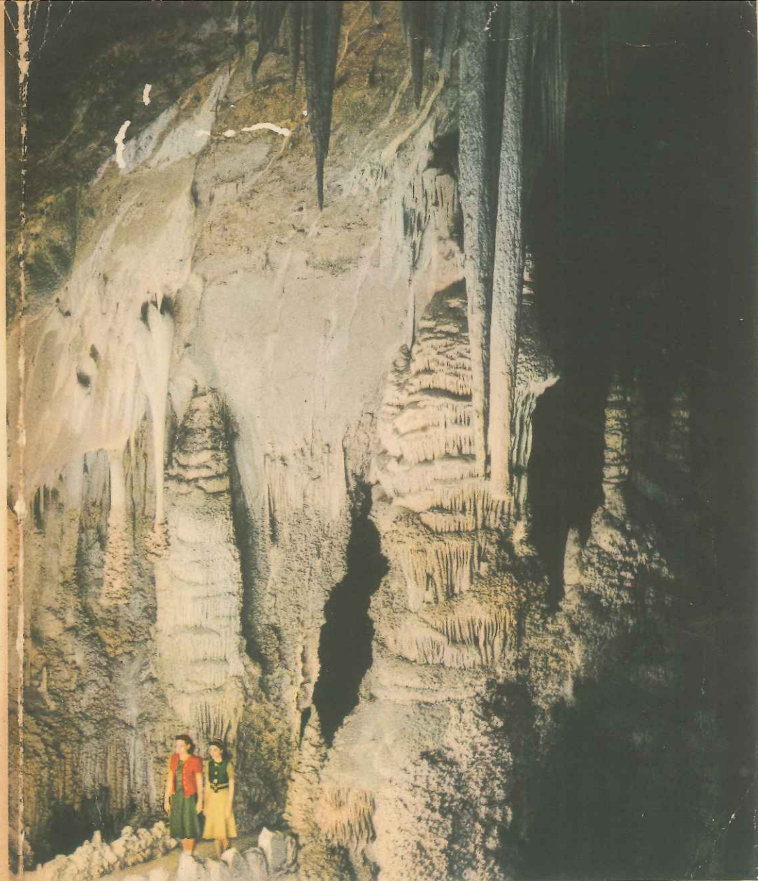
CARLSBAD CAVERNS NATIONAL PARK, GOLDEN STATE AND SUNSET ROUTES