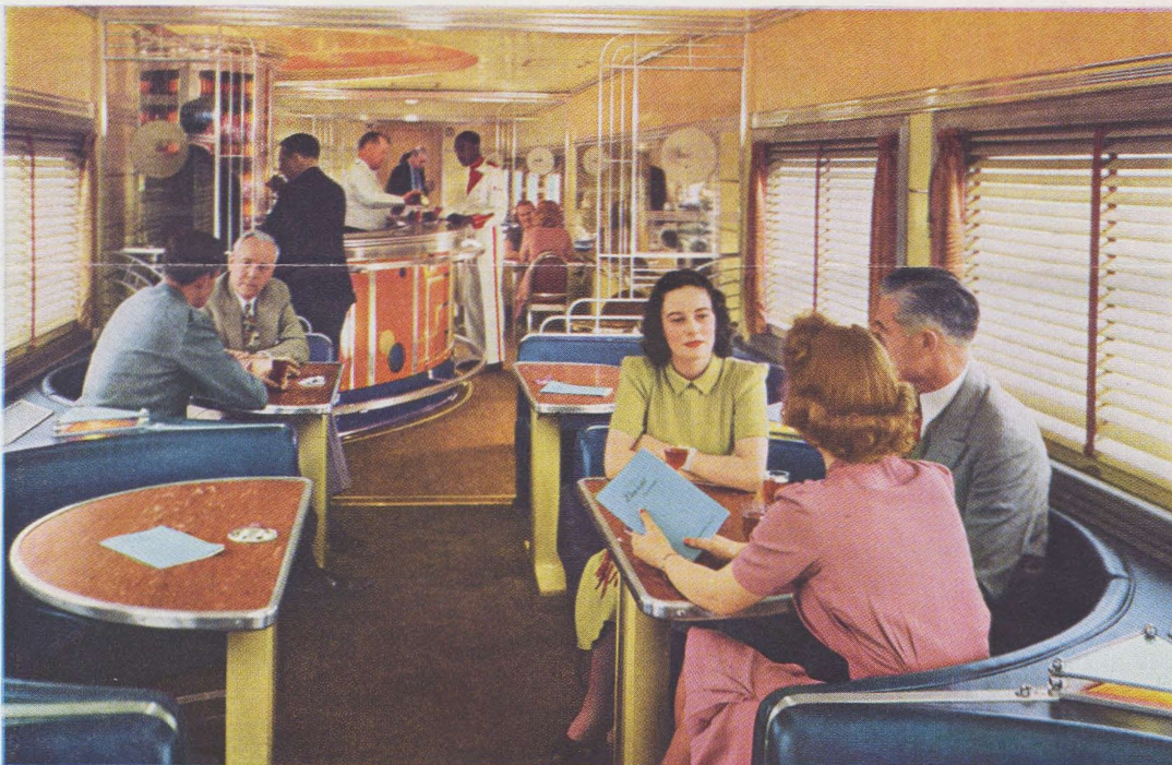
The Dining Cars on the San Joaquin Daylights serve S. P.'s famous "Meals Select." Notice the comfortable chairs and soft, pleasing colors, the tasteful drapes and big tables.