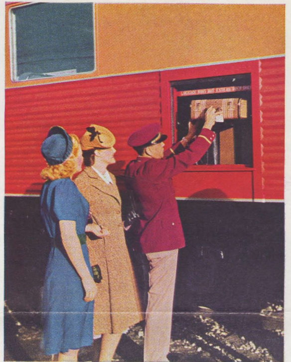
Baggage Elevators are a Southern Pacific innovation on the San Joaquin Daylights . Baggage is stored here so passengers do not have to wait in the aisles while it is being unloaded.

Wise travelers will remember that (except for the stimulating ferry trip across San Francisco Bay) San Joaquin Daylight passengers go all the way by train between San Francisco and Los Angeles. There are no changes en route on Southern Pacific.