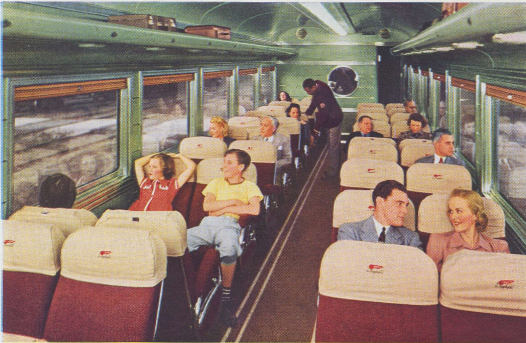
Streamlined Chair Cars on the San Joaquin Daylights are brand new, embodying all that we have learned in operating similar cars on the Coast Line Daylights . Easy chairs are adjustable to a comfortable reclining angle, have cushions of soft foam rubber. Windows are enormous. Fluorescent ceiling lights are white as daylight. Every car on the San Joaquin Daylight is air-cooled.