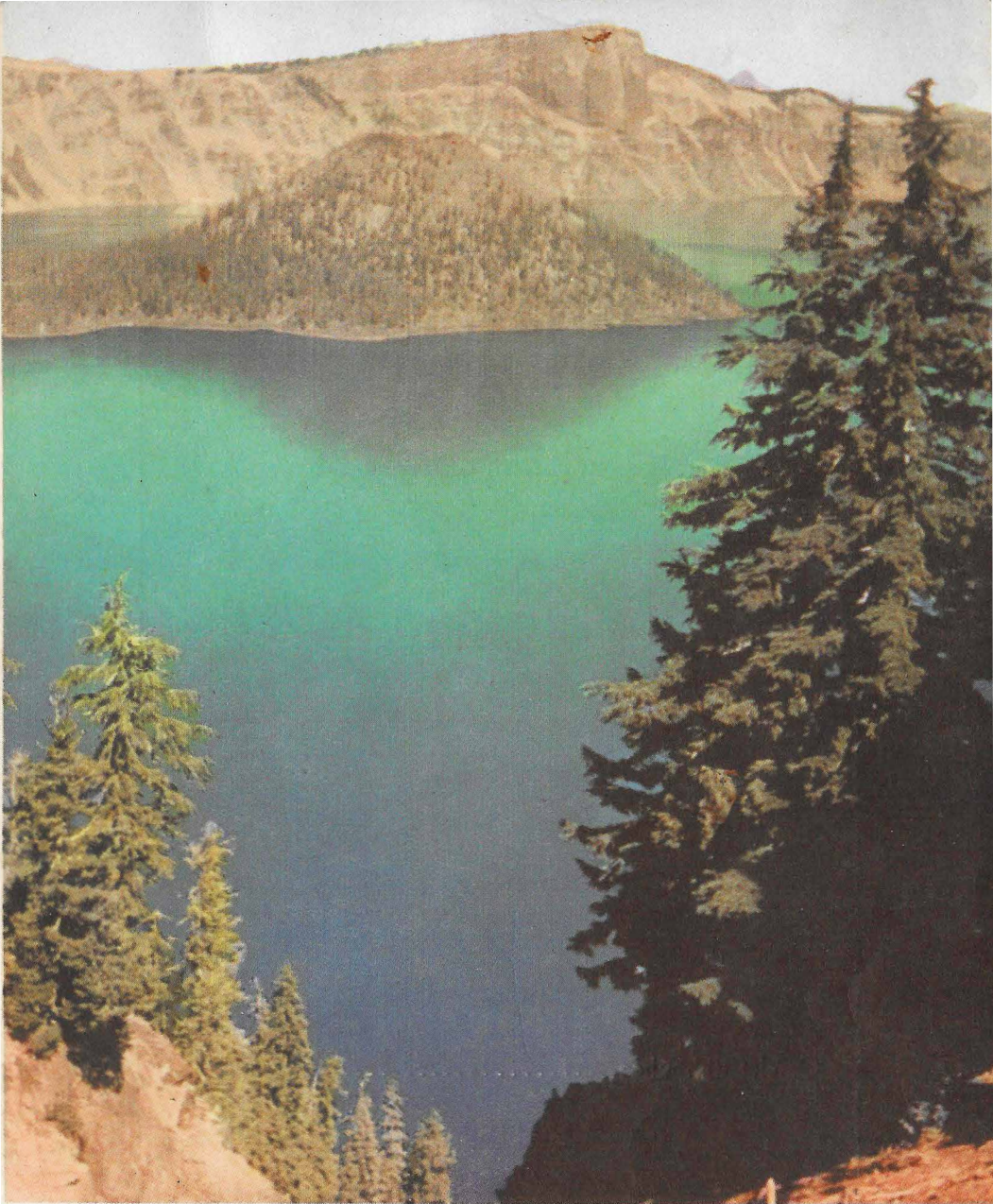
CRATER LAKE NATIONAL PARK, SHASTA ROUTE