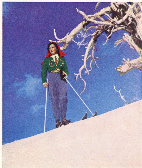
From December to May weather and snow conditions in California's High Sierra are excellent for winter sports. Skiing and tobogganing are rare good sport at Norden Sugar Bowl, Yosemite, Mt. Shasta, Lake Arrowhead, etc.