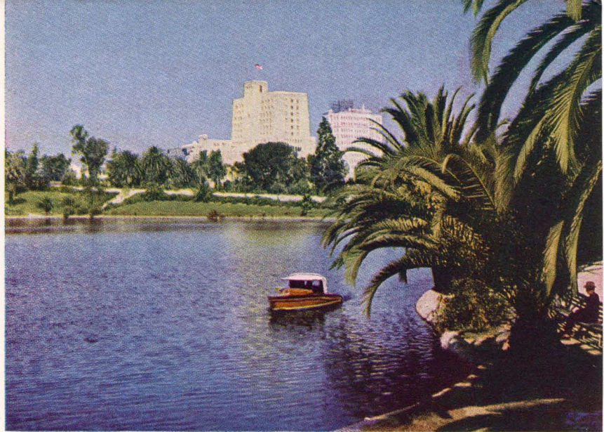
Los Angeles has grown from a tiny Spanish pueblo into one of the nation's proudest cities. Its homes, parks, boulevards, its smart shops, cosmopolitan hotels and moving picture industry are world-famed. Here we see tree-bordered Westlake Park—in the heart of the city.