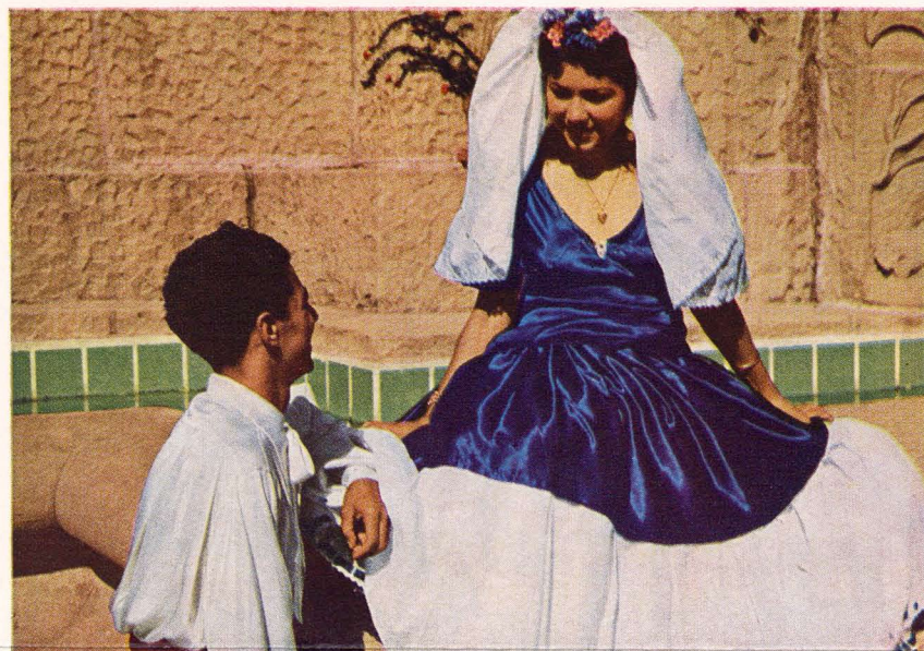
Picturesque community fiestas and festivals reconstruct California's storied past when this part of the world was more Spanish and Mexican than American. You'll see colorful costumes, hear soft-strummed guitars, watch gay dances.