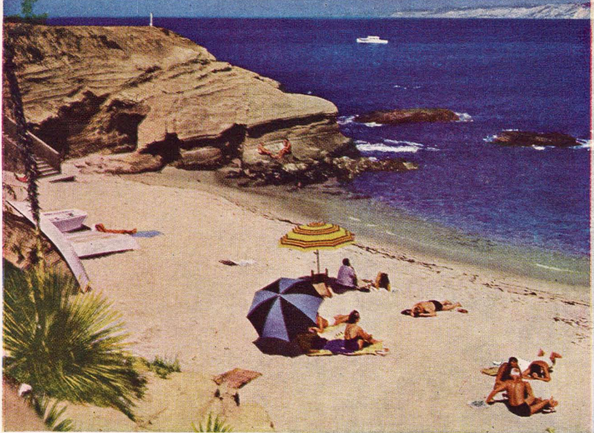
San Diego , unspoiled seaside city and important Army and Navy base, is famous for its numerous nearby beaches and resorts where you can romp on snow-white sands, challenge the surf, or just idle to your heart's content. Here we see a sheltered bathing cove at La Jolla (La Hoya) 14 mi. no. of San Diego.