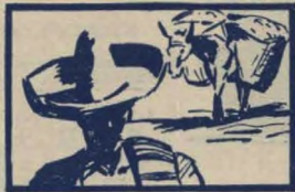
(A) Table 3 NEW ORLEANS, SAN ANTONIO AND MEXICO CITY, VIA LAREDO

TEXAS AND LOUISIANA LINES—SCHEDULES AND TRAIN ACCOMMODATIONS