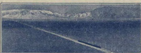
"Going to Sea by Rail" Across Great Salt Lake