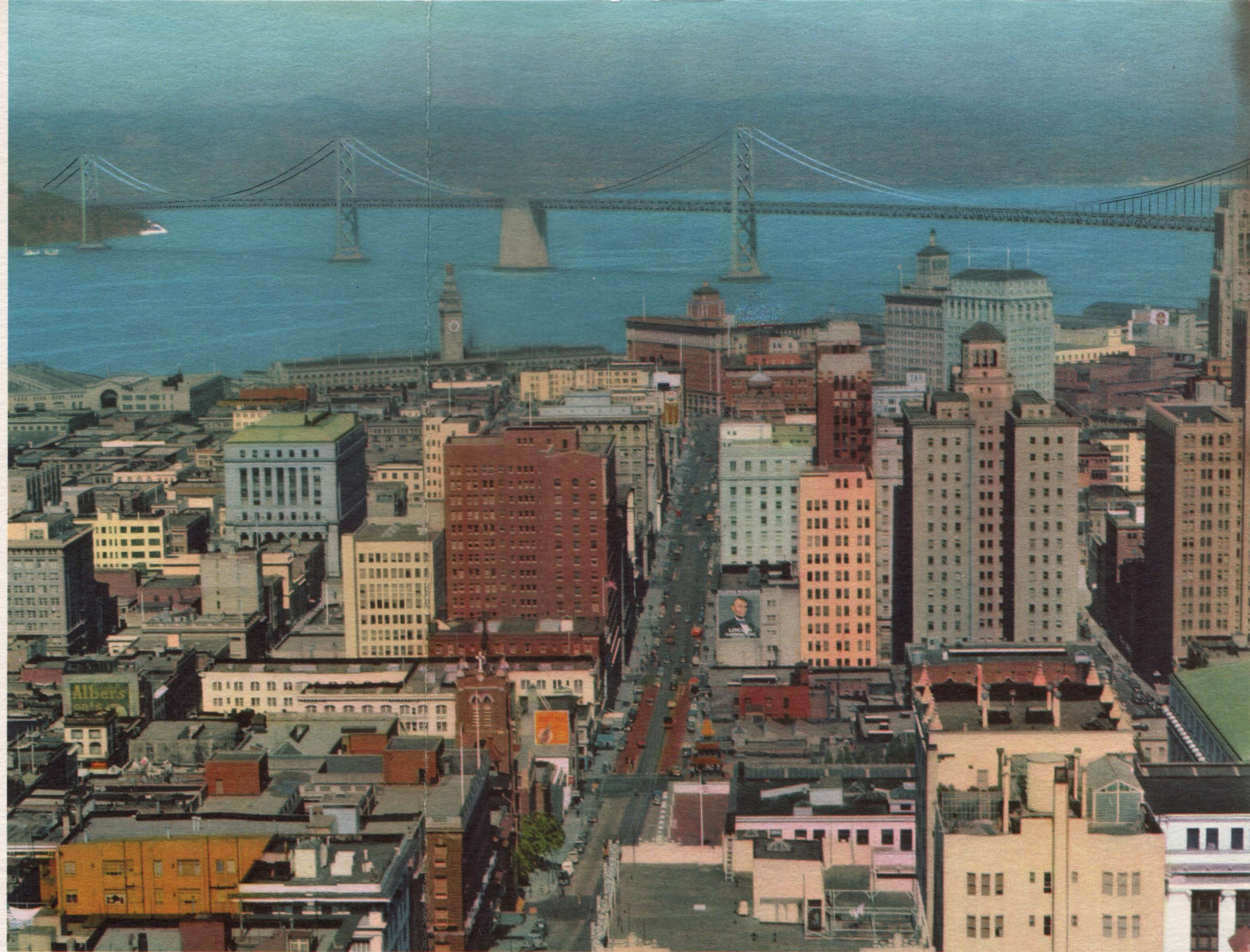
A portion of downtown San Francisco with the San Francisco-Oakland Bay Bridge in the background, also the Ferry Building and part of the Embarcadero.

Perhaps it is this fusing of so many races that contributes to the strength and vigor of San Francisco, and adds so much to its cosmopolitan charm. Truly, it is one of the great cities of the world.