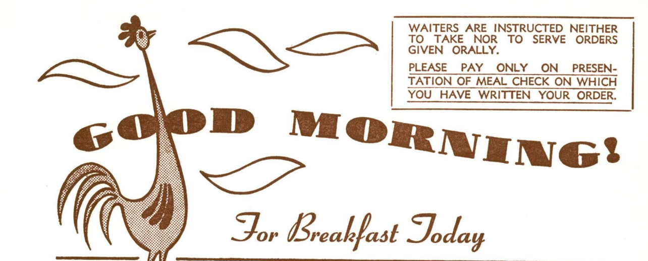
Table d'Hote Breakfast

Holders of "One Price Ticket" Please Present When Ordering