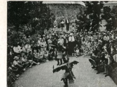
Each afternoon the Indians perform their unusual ceremonial dances in front of the Hopi House.