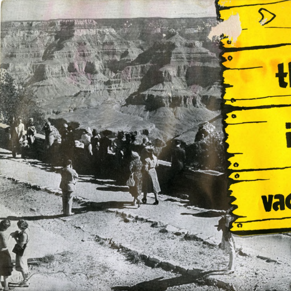
Visitors can stroll along the many footpaths on the rim and enjoy views of the Canyon from different points of interest. (Below) On the famous "Grand Canyon Mules" guides take visitors down Canyon trails that have been built by government engineers and sited for beauty as well as safety.