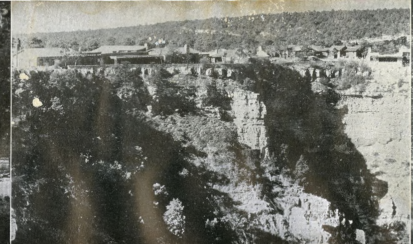
Bright Angel Lodge and Cabins, providing popular priced accommodations, form an interesting little village on the Canyon's rim.