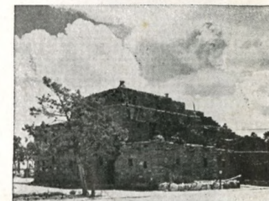
Opposite El Tovar stands the Hopi House with its interesting glimpses of Indian life.