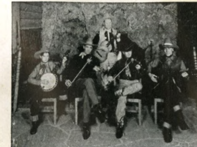
Nighttime entertainment is furnished by a talented cowboy orchestra and singers.