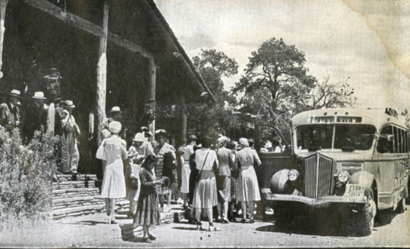
Rim drives by Harvey motor coaches, with experienced driver-guides, enable visitors to completely see this great scenic panorama.