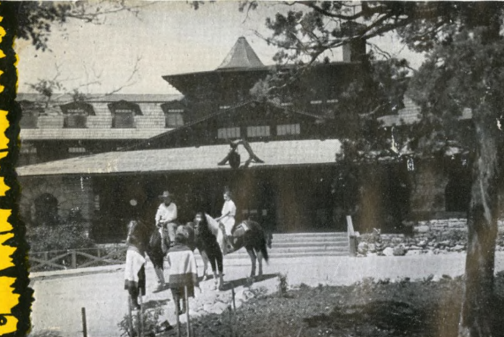
El Tovar, a rustic western style hotel on the rim of the Canyon, is one of the most famous resort hotels in America.