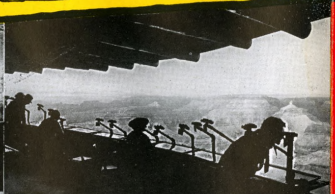
Many observation points, such as the Yavapai Observation Station, where lectures are given by the National Parks staff (above), and the Watchtower at Desert View (below), provide sweeping views of the Canyon.