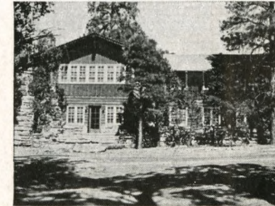
National Park Administration Building near El Tovar has an interesting collection of Grand Canyon exhibits.