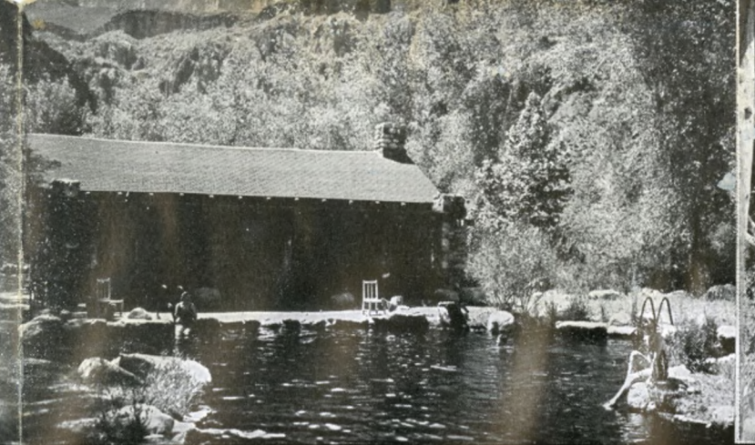
Phantom Ranch at the bottom of the Canyon provides delightful overnight accommodations for visitors taking trail trips.