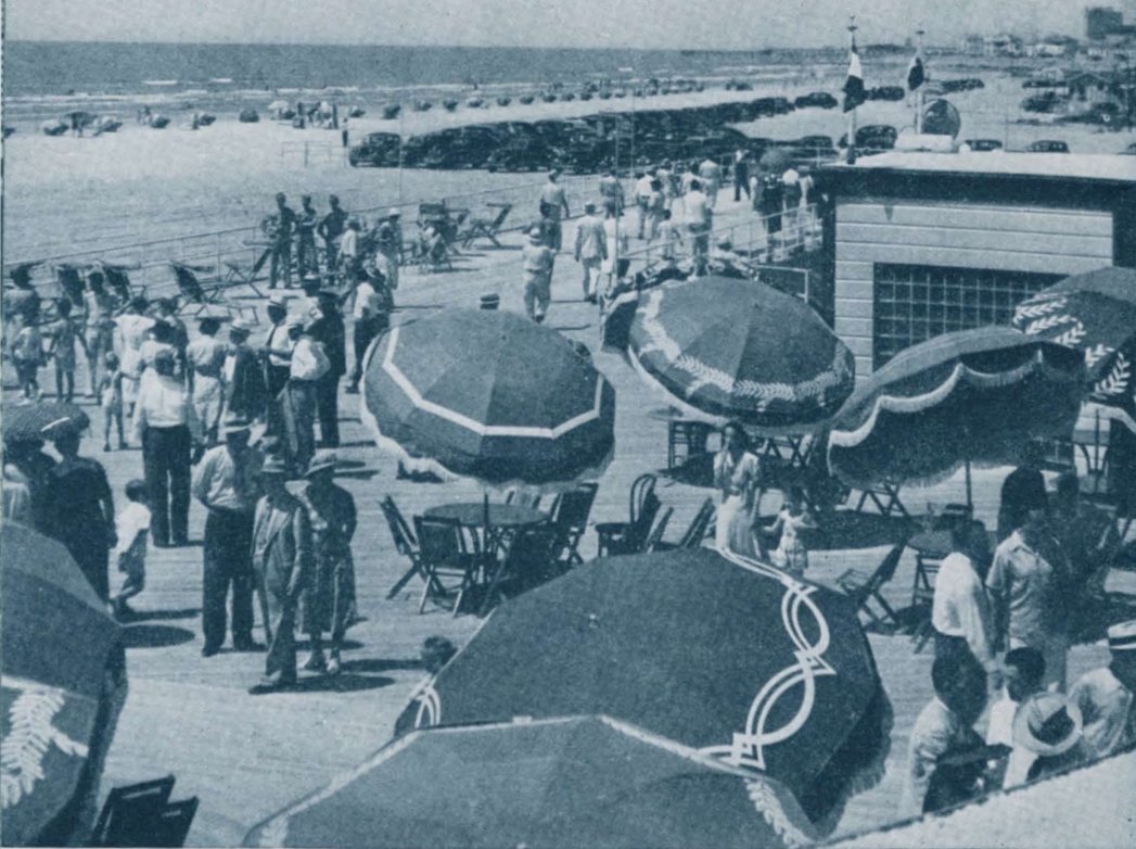
Galveston and the Gulf Coast . . . is gaining in popularity with vacation travelers. Galveston Island boasts the finest surf bathing in America and offers a variety of seacoast pleasures from boating and bathing, to big time deep sea fishing. (Above) Stewart Beach, $500,000 playground on Galveston Island.