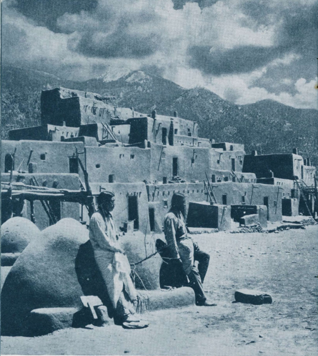
Taos Pueblo . . . Many vacation travelers delight in exploring the age-old inhabited Indian pueblos, prehistoric dwellings and primitive Spanish-American mountain villages via the Indian-detour motor cruises. (Above) Taos Pueblo, located in the mountains of Northern New Mexico, is one of the many popular stopping points on the Indian-detours.