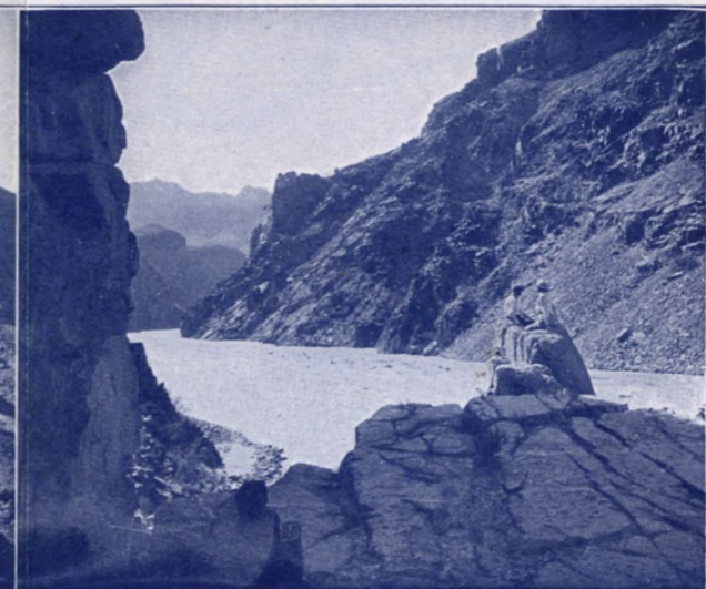
Colorado River—End of Hermit Trail