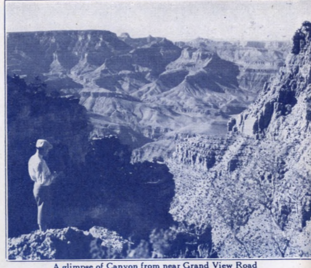
A glimpse of Canyon from near Grand View Road