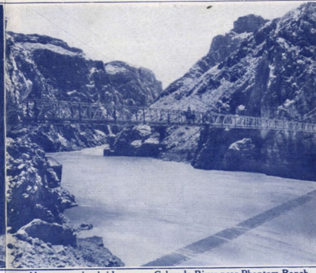
New suspension bridge across Colorado River near Phantom Ranch