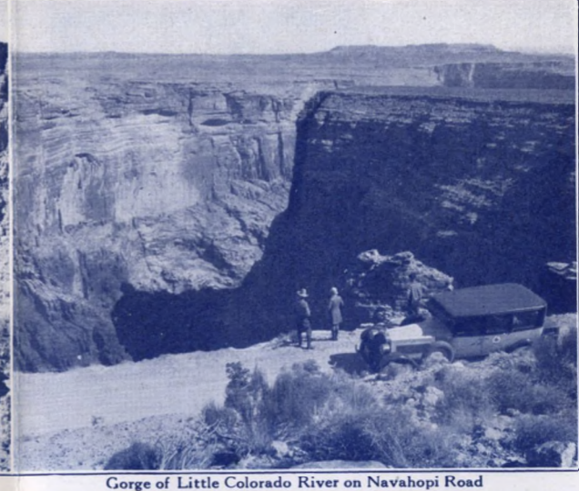
Gorge of Little Colorado River on Navahopi Road