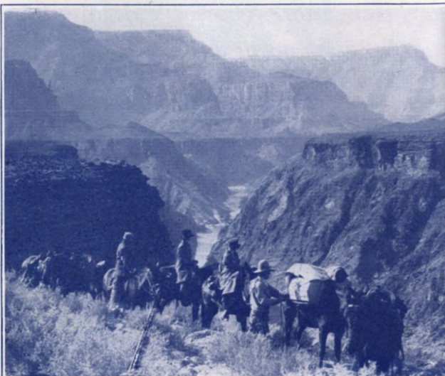
On Tonto Trail—Inner Canyon

Illustrated folder, describing Grand Canyon National Park, may be obtained at principal agencies of the Santa Fe.