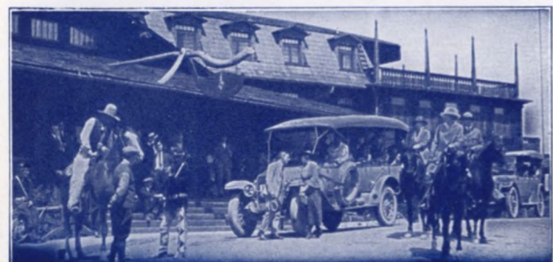
Outing Party Leaving El Tovar Hotel