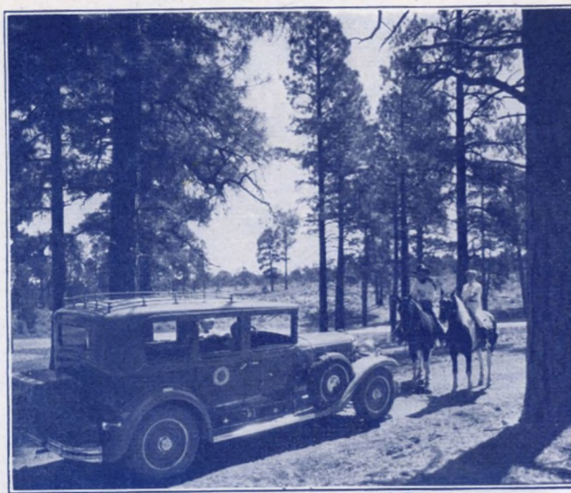
In Coconino Forest on South Rim