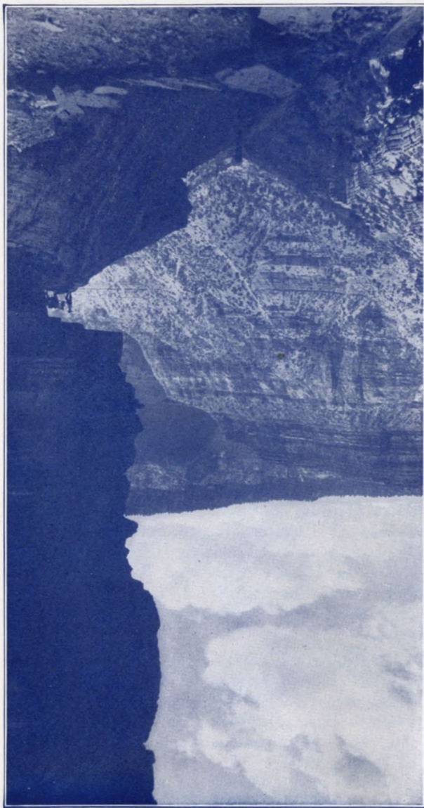
On Trail up Roaring Springs Canyon