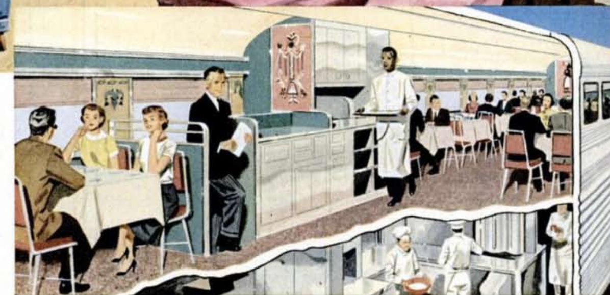
You dine penthouse-style. Soft music, magnificent views, and, of course, tempting Fred Harvey dishes—all high above the noise and distraction of the kitchen below.