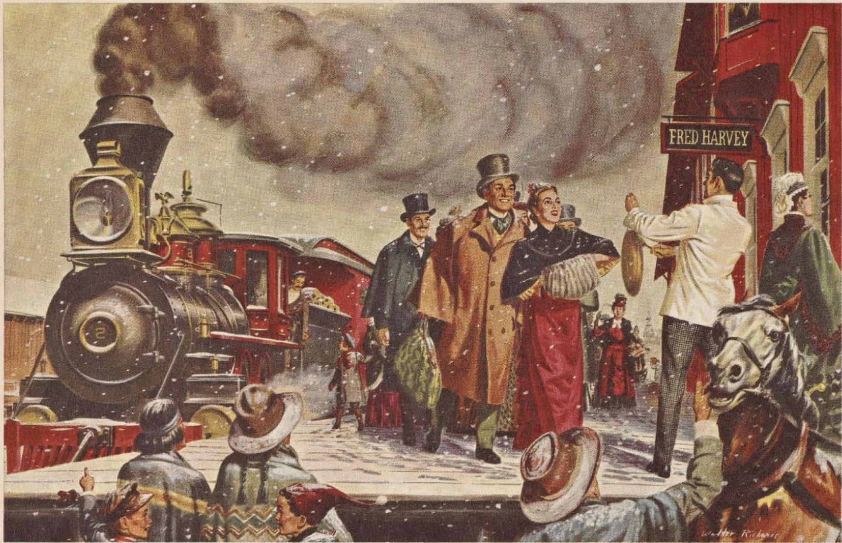
"THIRTY MINUTES FOR SUPPER" BY WALTER RICHARDS