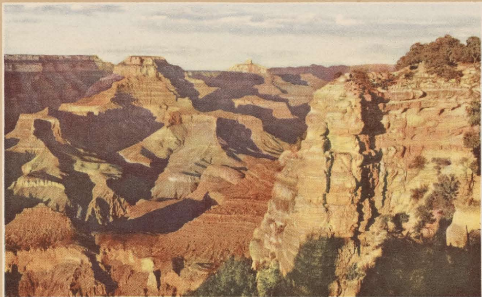
Looking East from Yaki Point, Grand Canyon National Park, Arizona