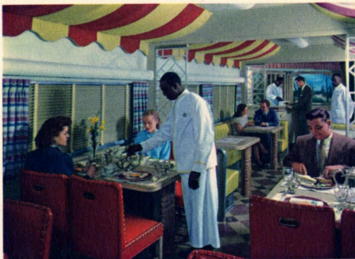
Refreshment headquarters for all passengers—particularly coach patrons