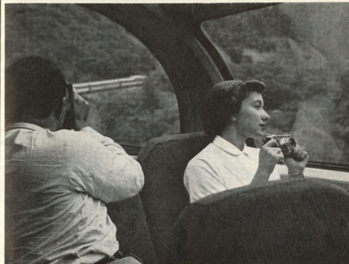
View of Beautiful Feather River Canyon from Vista Dome Chair Car

THE CALIFORNIA ZEPHYR features 'vista dome' Chair, Lounge and Observation cars from which all the beauty of the scenic Feather River Canyon and the Colorado Rockies may be seen.