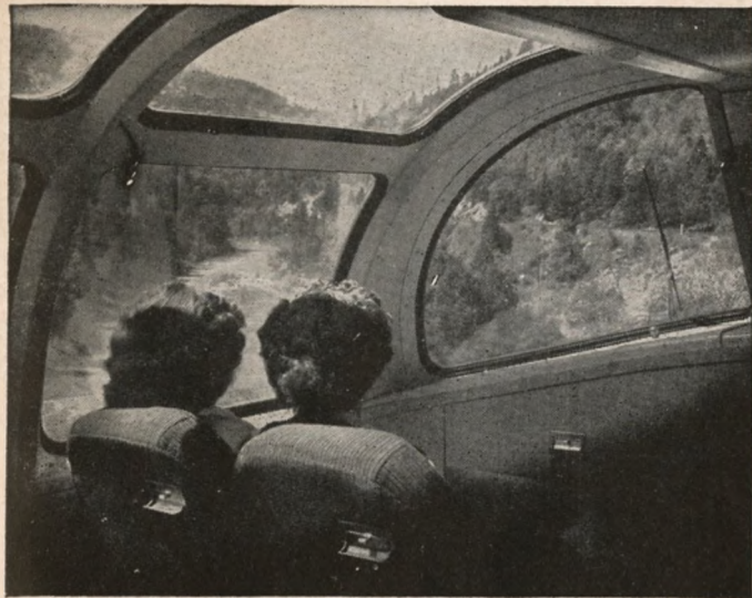
View of Beautiful Feather River Canyon from New Vista Dome Chair Car

For Ely, Nev. —Nevada Northern Railway Bus connects with Trains 1 and 2 at Wells.