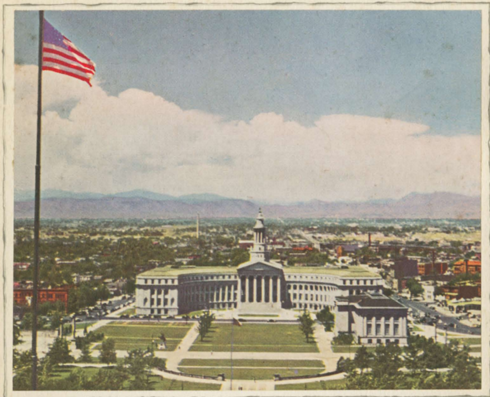
Denver Civic Center