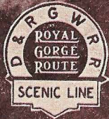
PIKE'S PEAK—GARDEN OF THE GODS