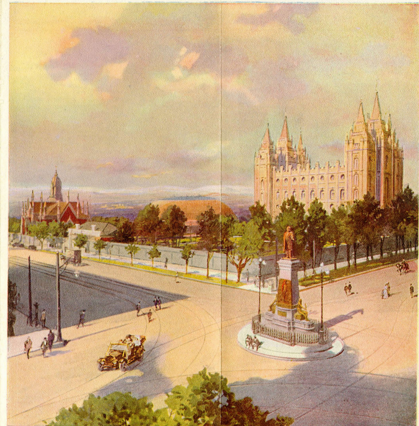
TEMPLE SQUARE, SALT LAKE CITY, UTAH