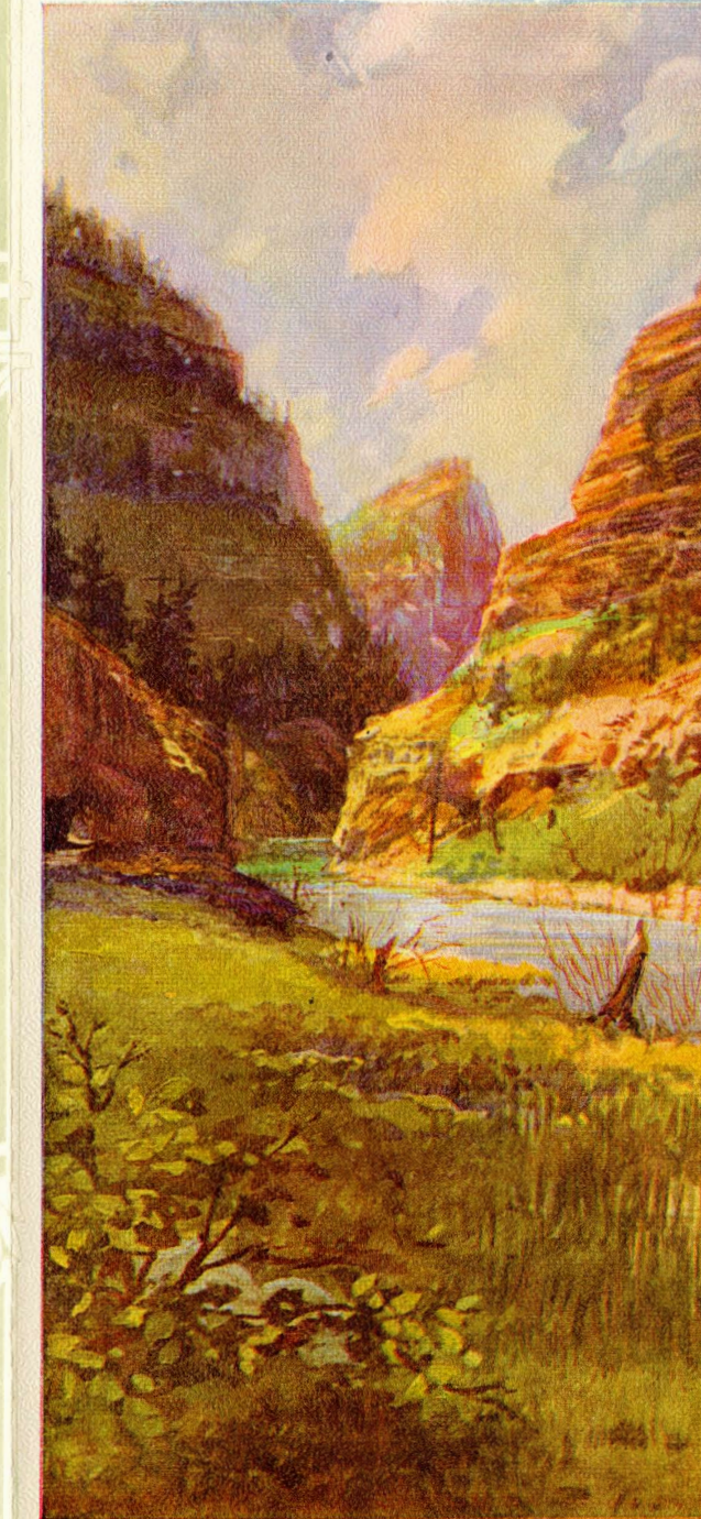
CAÑON OF THE GRAND RIVER, COLORADO