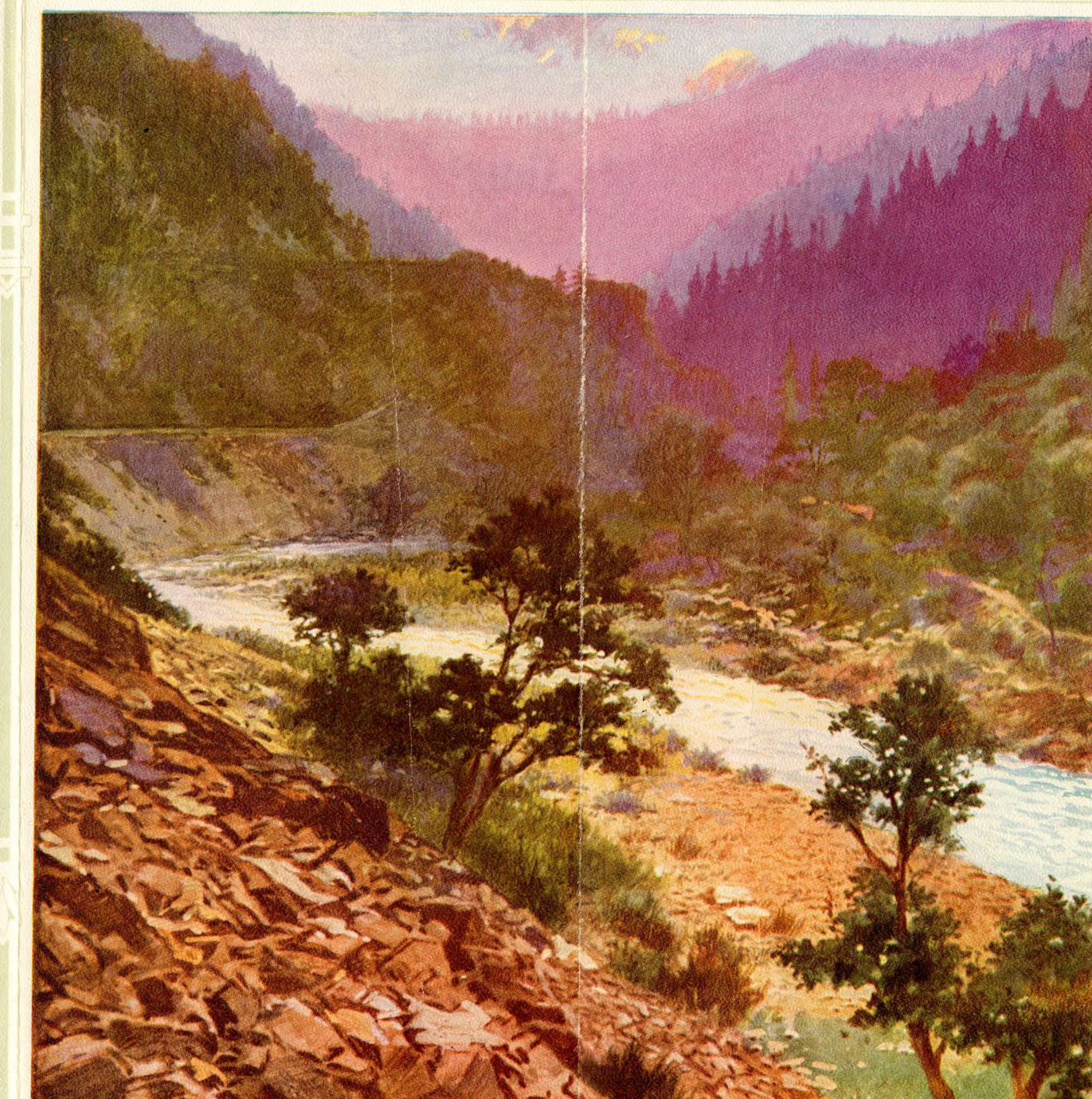
CASTLE BUTTE, CALIFORNIA