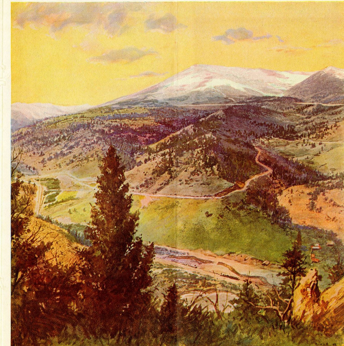
MARSHALL PASS, COLORADO