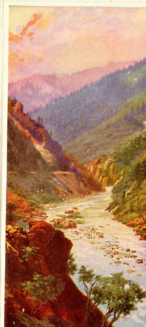
ALONG THE FEATHER RIVER, CALIFORNIA