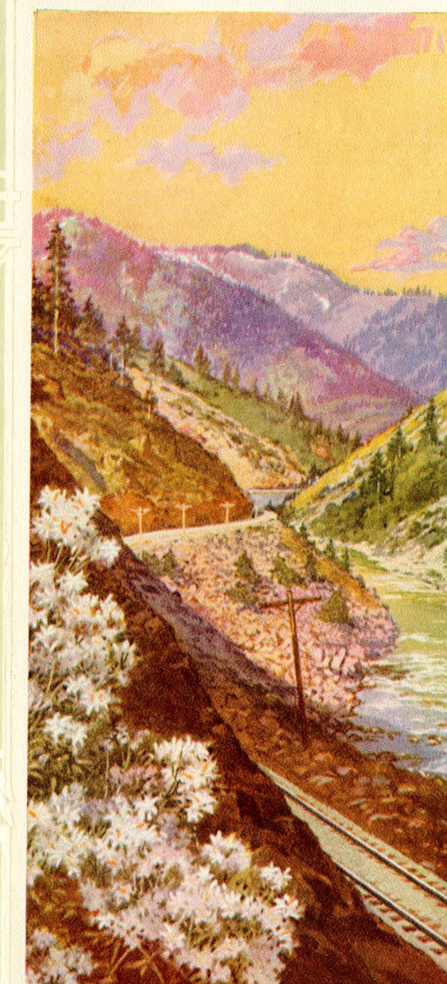
SERPENTINE CAÑON, CALIFORNIA