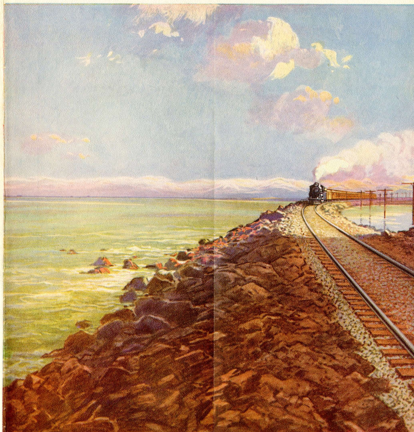
CROSSING GREAT SALT LAKE, UTAH