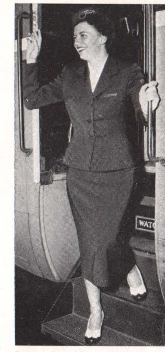
Stewardess-Nurse Service—another Northern Pacific extra