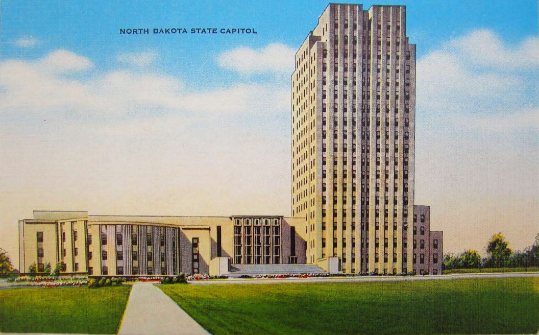
NORTH DAKOTA STATE CAPITOL