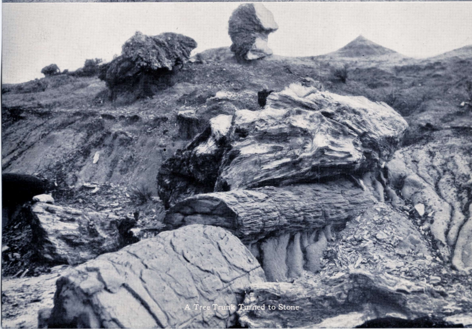
A Tree Trunk Turned to Stone