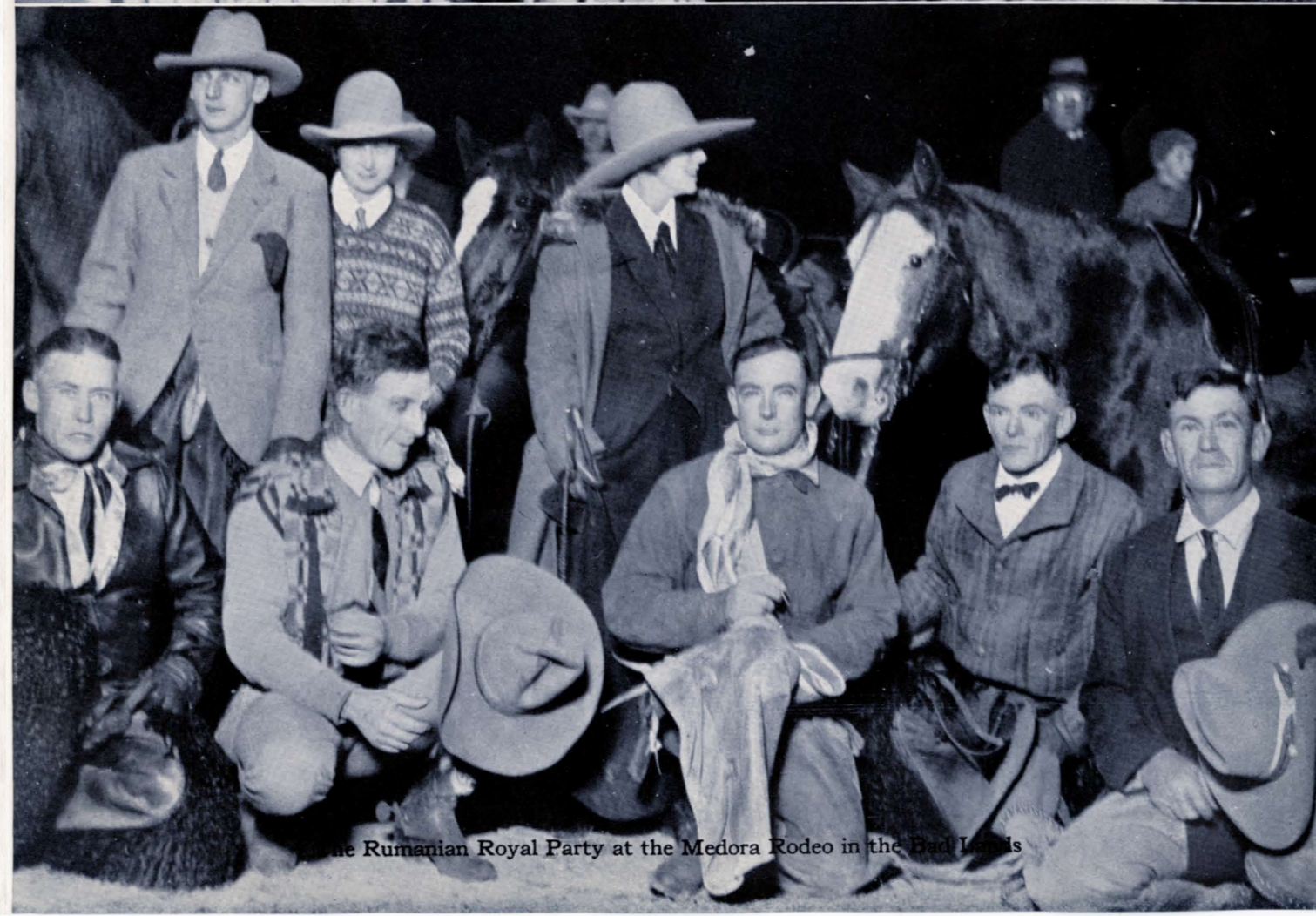
The Rumanian Royal Party at the Medora Rodeo in the Bad Lands