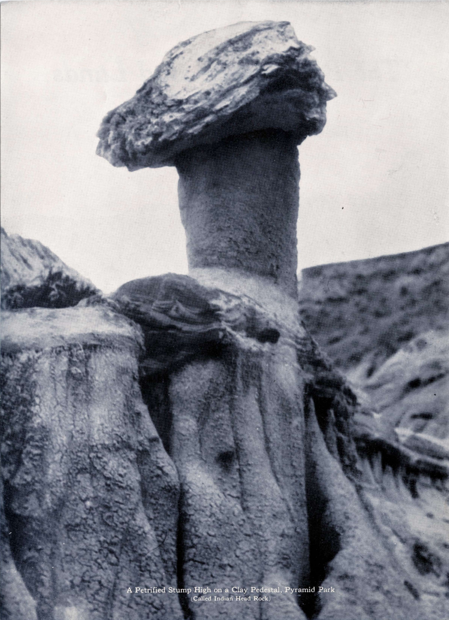
A Petrified Stump High on a Clay Pedestal, Pyramid Park (Called Indian Head Rock)