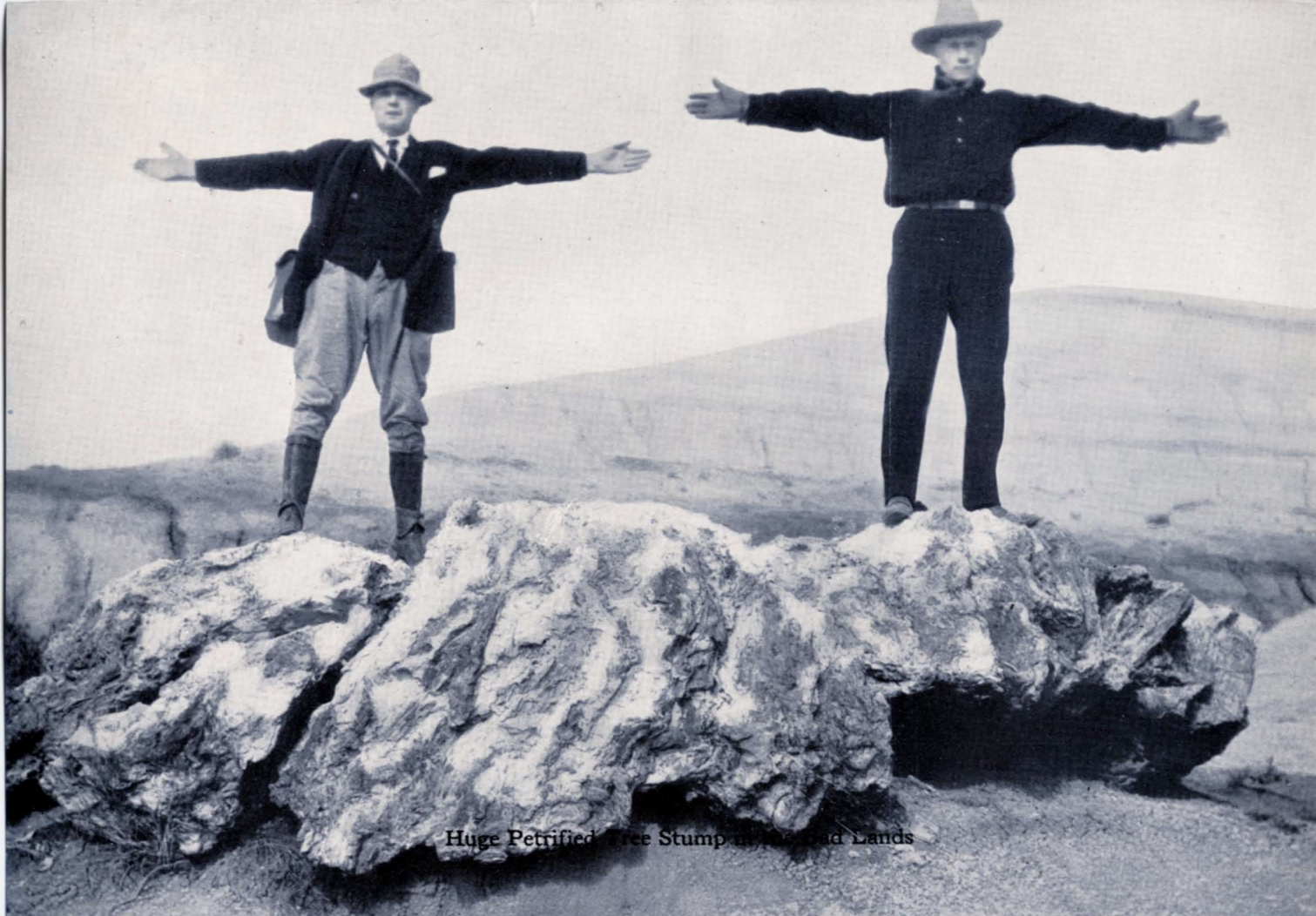
Huge Petrified Tree Stump in the Bad Lands