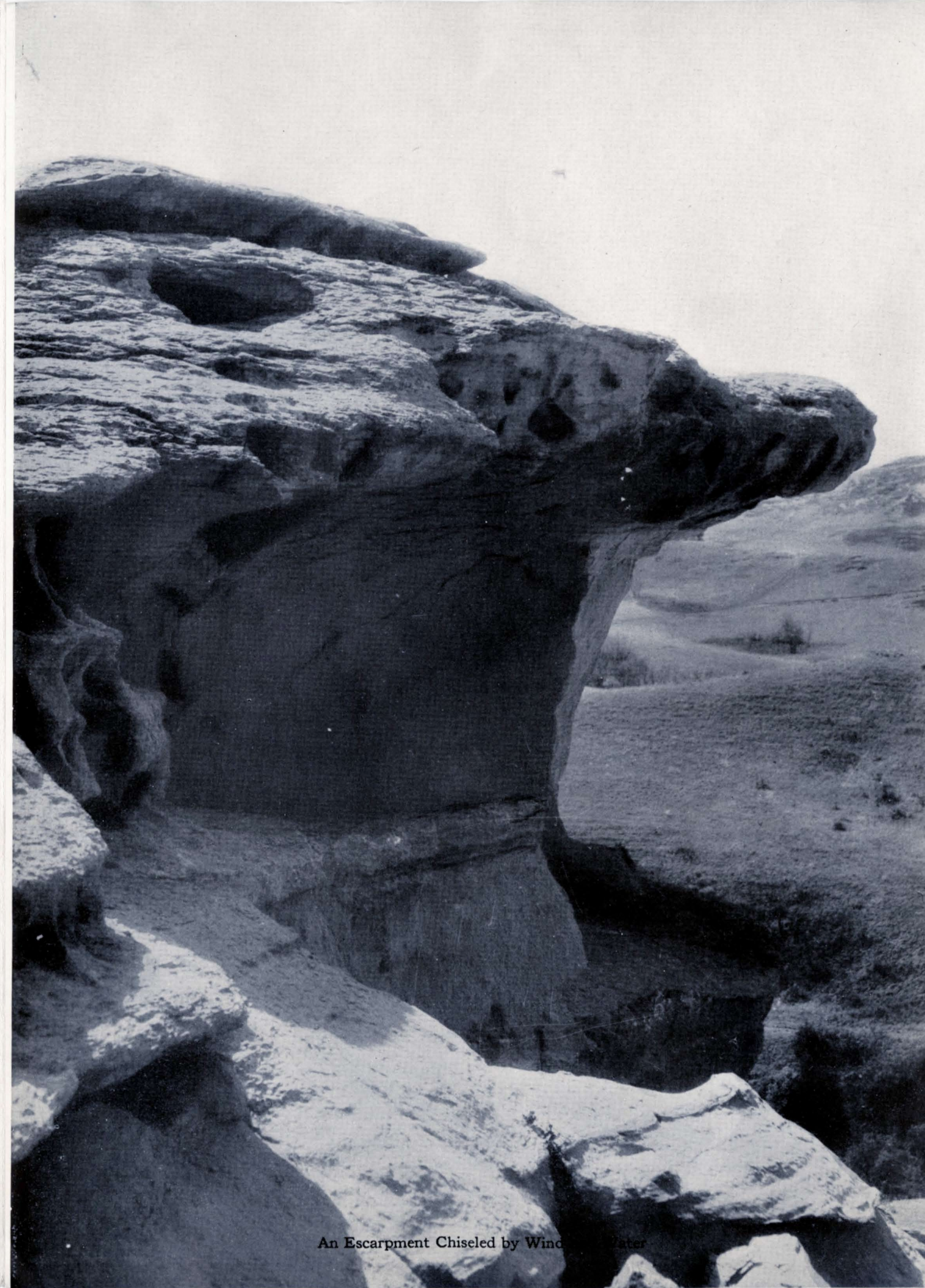
An Escarpment Chiseled by Wind and Water