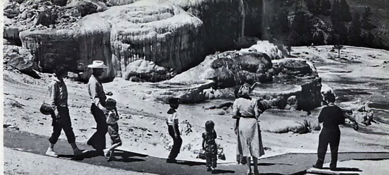
One of the great hot springs terraces at Mammoth

palisades, returning to Mammoth for dinner and overnight. The evening is open to explore the various hot springs terraces around the lodge. Entertainment available.