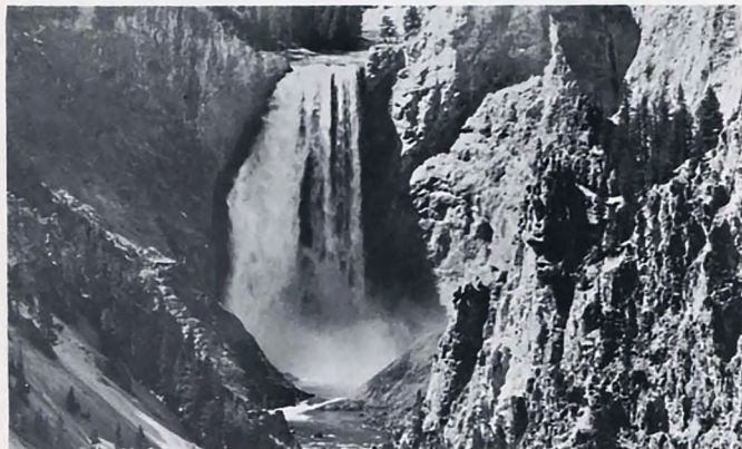
The Magnificent Grand Canyon of the Yellowstone

Arrange for your Yellowstone sidetrip by mailing the handy coupon in this folder, or through your favorite railroad ticket agent or travel bureau.