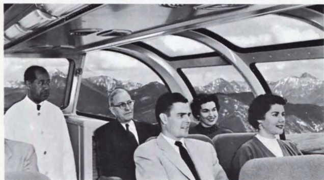
You'll enjoy scenery at its best from your seat in the Vista-Domes of the de luxe North Coast Limited

EASTBOUND—Railroad ticket (coach or 1st class) and proper reservations for seat or Pullman space from home city, routed NP to Gardiner, NPT Silver Gate to Red Lodge, thence Red Lodge to St. Paul via Northern Pacific. Use Form GL 25E, value $101.24.